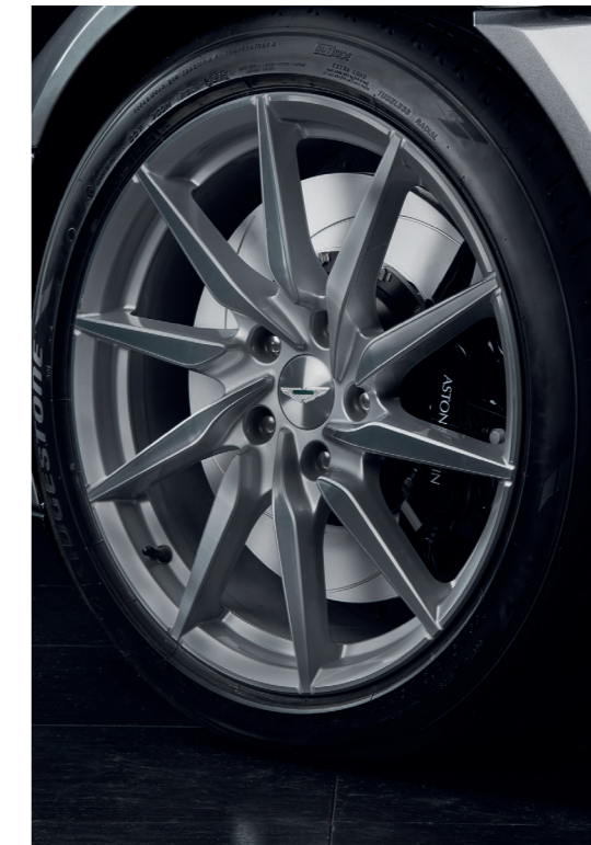
Winter Wheel and Tyre Kit