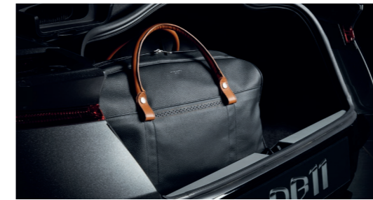
4-Piece Luggage Set