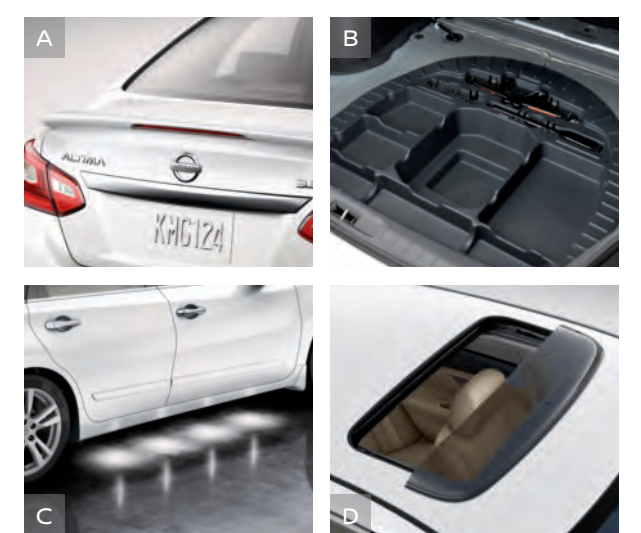
See your Nissan dealer for details, or go to accessories.nissan.ca