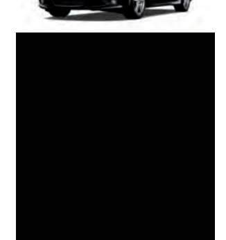
Super Black кнз 2.5/ 2.5 SR 2.5 SV TECH TECH CHARCOAL SPORT CLOTH

Nissan has taken care to ensure that the colour swatches presented here are the closest possible representations of actual vehicle colours. Swatches may vary slightly due to the printing process and whether viewed in daylight, fluorescent or incandescent light. Please see the actual colours at your local Nissan dealer.