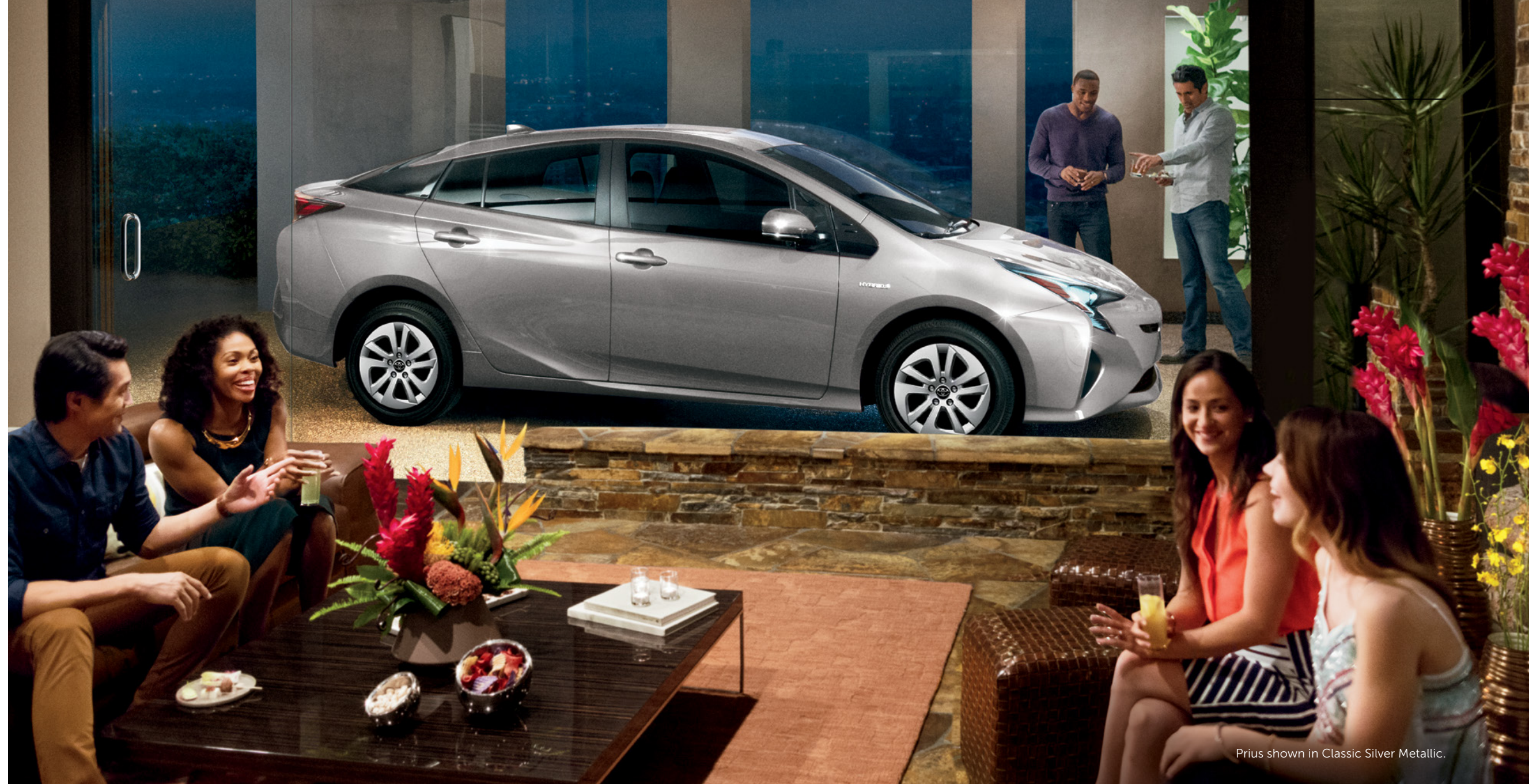
Prius shown in Classic Silver Metallic.

When you sit in the Prius, an interesting thing happens. You feel totally comfortable and at ease. Almost like whoever designed it, designed it just for you. And actually, that would be correct. We've created an inviting space that was designed from the driver out. One that perfectly balances comfort, convenience, and style. With a centre console that has been specifically contoured to give everyone more room up front. Plus a smart seat design that makes the back seats relaxing and spacious. To top it off, there's plenty of cargo space for whatever you need to bring. So load up. Stretch out. And enjoy the drive.