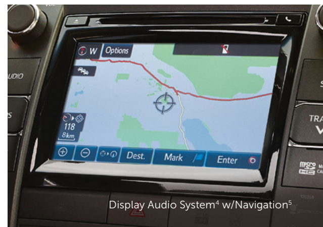
Display Audio System 4 w/Navigation 5