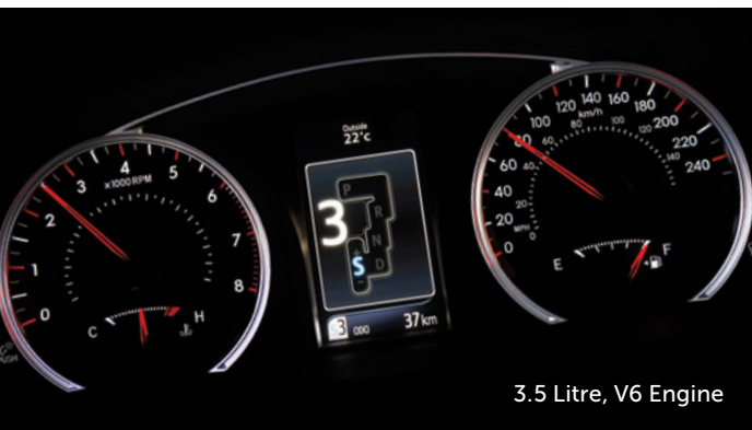
3.5 Litre, V6 Engine