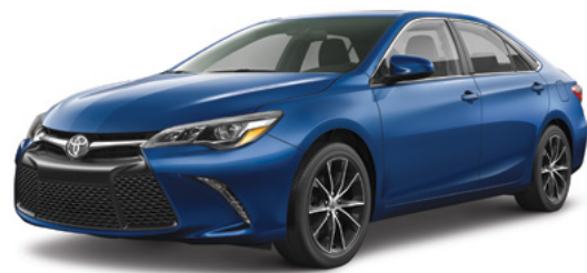
8T7 BLUE STREAK METALLIC