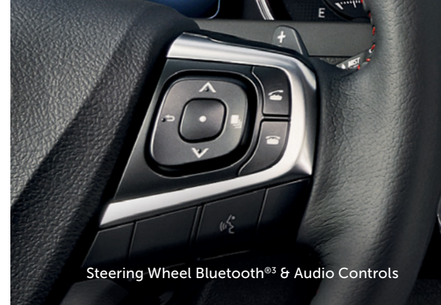
Steering Wheel Bluetooth ®3 & Audio Controls

What can the Camry do for you? It can talk, listen, inform, entertain, and amaze. It can infuse technology into just about every moment of every trip. It can turn on with the push of a button. It can charge your phone wirelessly while you drive. It can revolutionize the way you drive, with technology that can take you to the other side of the country as easily as it takes you around a traffic jam. The Camry can take you wherever you've dreamed of going, now and into the future.