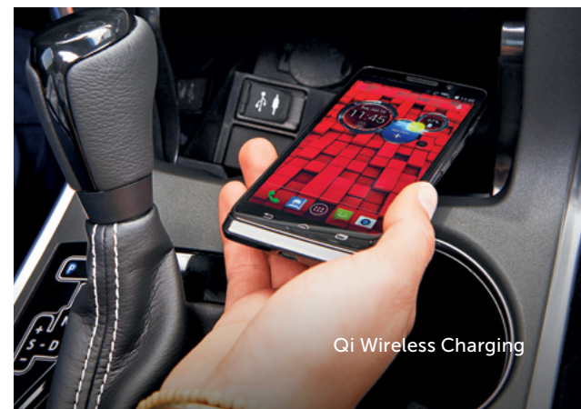
Qi Wireless Charging