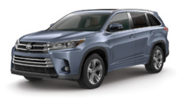
8V5 SHORELINE BLUE PEARL