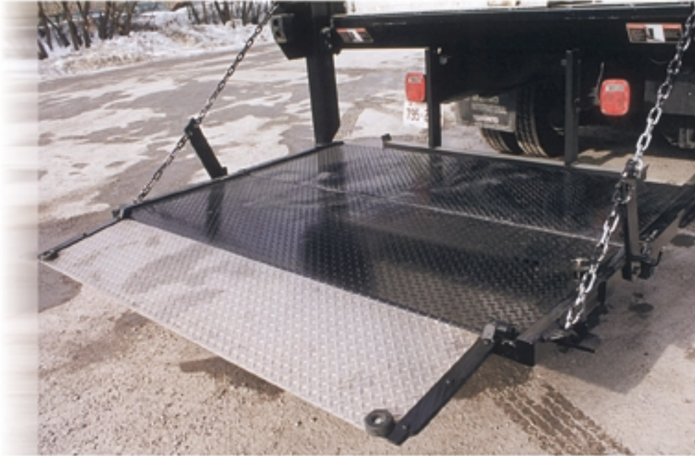
Shown: 16" Aluminum Flip Ramp - Optional