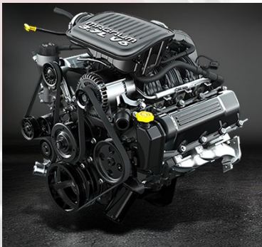
3.7L Magnum V6 (210 hp, 235 lb-ft)

Three powerful engine options – all with excellent fuel economy.