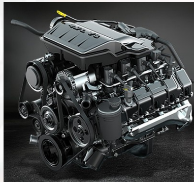
4.7L Flex Fuel V8 (310 hp, 330 lb-ft)