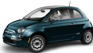
Verde Azzurro (Blue-Green)