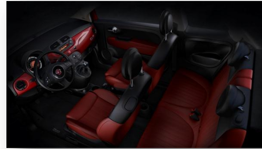
Rosso - Rouge (CXR)