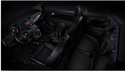
Nero - Noir (CEQ)