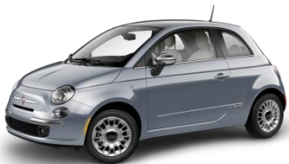
Luci Blu (Light Blue)