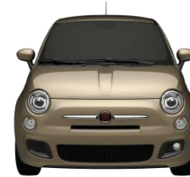
Mocha Latte (Mocha Latte)