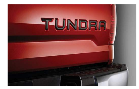
Black Tailgate Insert Badge $116.50

Manufactured from forged, highly polished billet aluminum, the TRD Oil Cap features a red on black TRD logo to customize the engine compartment with a high-tech, race-inspired appearance. It's finished with a high-luster coating to maintain its appearance for years to come.