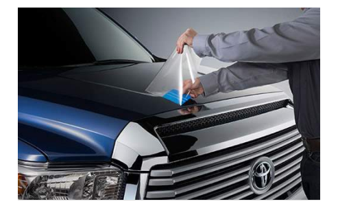
Pro Series Paint Protection Film $430.00

Guard your vehicle from weathering, UV radiation and road debris that can chip and scratch the finish with 3M Pro Series Genuine Toyota Paint Protection Film. This durable and nearly invisible thermoplastic urethane is designed to protect the hood and front fenders to maintain a like-new appearance. Backed by a 10 year limited warranty.