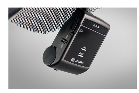
Toyota Genuine Dash Camera $670.10

The Toyota Genuine Dash Camera is designed to provide a safe and memorable driving experience in your Toyota vehicle. Safely record the ongoings of the open road while keeping your eyes on the road. Never miss a moment in motion; capture it! The Toyota Genuine Dash Camera will also allow you to record the surroundings of your vehicle while it is parked.