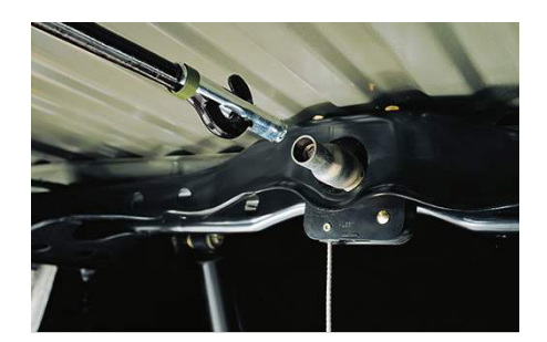
Spare Tire Lock $96.50

Add functionality with additional Bed Cleats. Designed specifically for the Tundra Bed Rails, they are constructed of sturdy die-cast aluminum, and each fully adjustable Bed Cleat is rated for a maximum load of 220 lb. Sold individually.