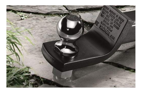
Towing Hitch Ball - 2" - 6,000 lbs $32.50

The Toyota Genuine Dash Camera is designed to provide a safe and memorable driving experience in your Toyota vehicle. Safely record the ongoings of the open road while keeping your eyes on the road. Never miss a moment in motion; capture it! The Toyota Genuine Dash Camera will also allow you to record the surroundings of your vehicle while it is parked.