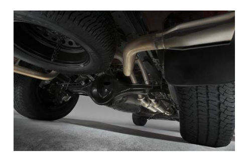
TRD Performance Dual Exhaust System $1,479.00

Provides a convenient, secure stepping platform that makes it easy to get in and out of the truck bed. •Works with tailgate up or down •Hands-free operation allows users to raise or lower the step by nudging with their foot •Stores discreetly under rear bumper •Lightweight, highstrength aluminum die-cast construction features a glass-reinforced nylon step pad with ribbed, nonskid stepping surface •300-lb. load capacity •Weather-resistant black anodized and Teflon® powder-coat finish for long-term durability •Quick and simple no-drill, bolt-on installation