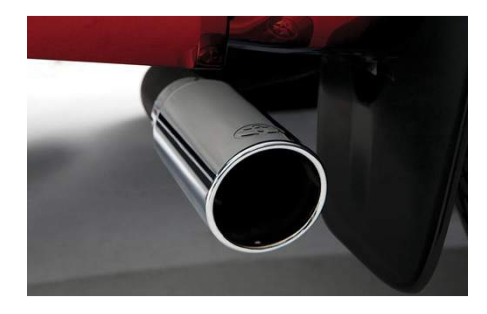
Stainless Steel Exhaust Tip $106.00

Energize the brute within with some deep breathing exercises. The TRD exhaust gives your engine greater power with a less restrictive path, while bellowing out a deep, throaty tone. Made from stainless steel grades, and featuring a cat-back exhaust design with dual TRD logoetched tips. This dual exhaust allows for a less restrictive path, helping reduce backpressure for added low-to mid-range torque, along with improved horsepower.