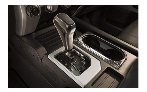
TRD Shift Knob $190.50

Enhance your connection to your Tundra every time you shift with the TRD Shift Knob. Delivers an enhanced shifting feel while providing an impressive addition to your interior.