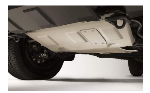
TRD Front Skid Plate $732.00

Enhances Tundra's tough, capable stance and helps protect vehicle underbody from damage that can result from flying stones, salt, branches, ice chunks, and other types of road debris. Made from stamped and formed 1/4-in.thick silver powder-coated aluminum.