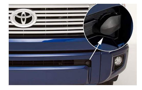
Block Heater $409.50

Guard your vehicle from weathering, UV radiation and road debris that can chip and scratch the finish with 3M Pro Series Genuine Toyota Paint Protection Film. This durable and nearly invisible thermoplastic urethane is designed to protect the hood and front fenders to maintain a like-new appearance. Backed by a 10 year limited warranty.