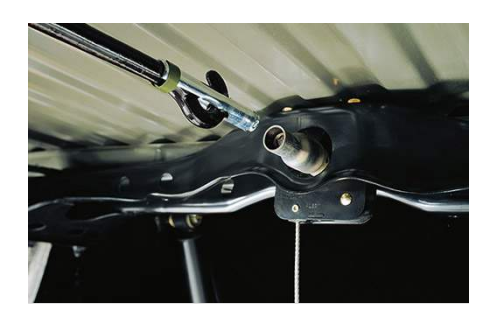
Spare Tire Lock $96.50

Secure your spare tire with a precision machined lock constructed of hardened steel with zinc-nickel plating. It quickly attaches to the spare's crank-down tool receiver mechanism, and the key attaches to the crank-down tool in the vehicle's tool kit.