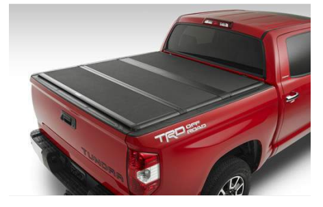
Hard Tri-Fold Tonneau Cover $1,355.00

It's simple physics. Increasing air flow helps increase performance! When you add a TRD Performance Air Intake System to your truck you get all the benefits of free-flowing colder air. These systems have been dyno tested to deliver enhanced horsepower and torque for superior acceleration, plus more pulling power.