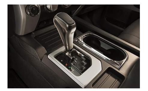
TRD Shift Knob $190.50

The Towing Mirrors help with visibility by being able to extend 4-in. to provide an even wider rear field of vision. They also feature integrated turn signals to help make your signaling more visible to other drivers.