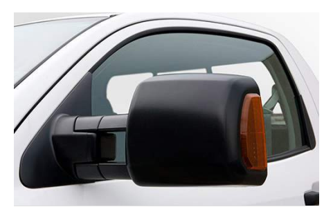
Towing Mirrors - Left Side $365.00

The Door Sill Protectors help guard against scuffs and scratches. Not only are they functional, but they also provide a styling accent that is immediately noticed when entering the vehicle. Kit of 2 (rear).