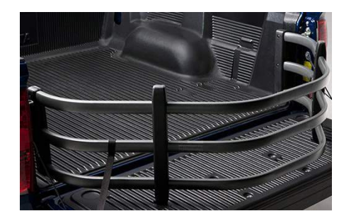
Bed Extender $505.50

Create some additional space in your Tundra's bed with the Bed Extender. It extends over the tailgate, creating even more space in Tundra's bed for carrying your items. The Extender can also be rotated inward, providing an enclosed cargo area to secure smaller items with the tailgate closed. Made to last with lightweight, high-strength aluminum.