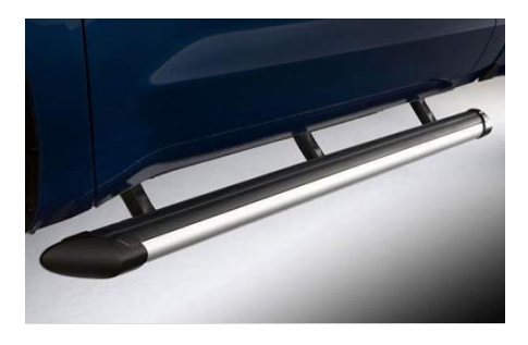
Side Step Bars - 4-inch Aluminum $675.00

Gain easy access into your Tundra while enhancing the exterior appearance. These durable and robust 5-inch Side Step Bars feature dual-moulded, skidresistant step pads and come in a brilliant chrome finish. Not only does the chrome finish look great, it also provides protection against the elements.