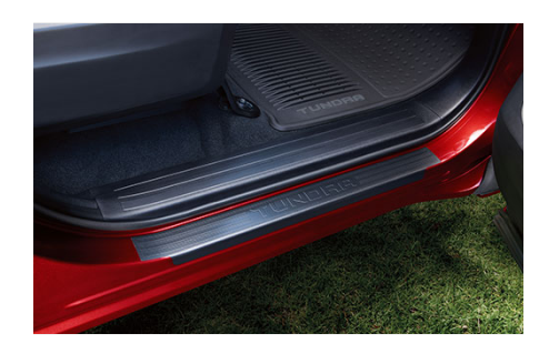
Kit: Door Sill Protectors (front and rear).

Add to your Tundra's bold style with these shiny exhaust tips. Built Toyotatough, they're constructed from polished, corrosion resistant double-walled 304 stainless steel. Plus, they're easy to install – no cutting, drilling or welding! Features a finely etched Toyota logo.