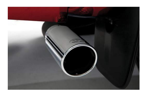
Stainless Steel Exhaust Tip $106.00

A convenient storage tray, customdesigned for your Tundra's center console area. Three distinct compartments provide areas for coins or small objects, phones, tablets, and tools. The console also features railings to accommodate letter-size hanging file folders.