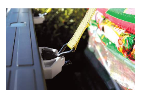
Bed Cleat $69.50

A custom-designed system with 400 watts of heating power not only warms a vehicle up quicker but also reduces engine strain and wear. The heater also saves fuel and battery power during startups. With the socket conveniently integrated into the front valence, the Plug-In Block Heater has a factory finished look. It comes with both a main 8-foot and spare 18-inch power supply cord, with a 16-foot cord available separately.