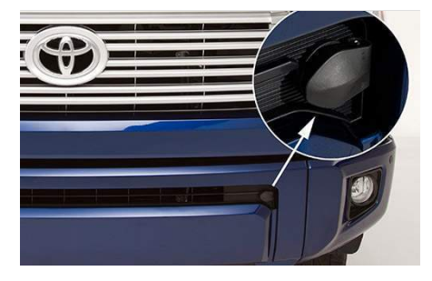
Block Heater $409.50

The soft tri-fold tonneau cover gives your truck added versatility. Designed and engineered specifically for your Tundra, this low-profile soft tonneau cover is made from lightweight aluminum and the highest-grade vinyl in the industry. Backed by a factory 3-year/60,000km New Vehicle Limited Warranty, and can be incorporated into your vehicle payments.