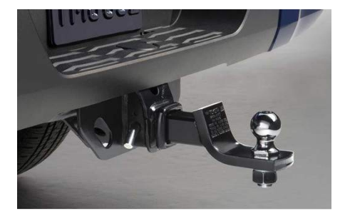
Towing Hitch Ball - 2 5/16" - 14,000 lbs $57.50

The Towing Hitch Ball is designed and tested to meet your vehicle's towing specifications and quality standards.