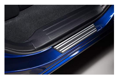
Rear Door Sill Protectors $126.00

Secure your spare tire with a precision machined lock constructed of hardened steel with zinc-nickel plating. It quickly attaches to the spare's crank-down tool receiver mechanism, and the key attaches to the crank-down tool in the vehicle's tool kit.