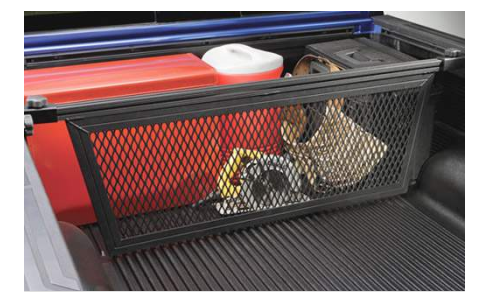
Bed Divider $376.00

Create some additional space in your Tundra's bed with the Bed Extender. It extends over the tailgate, creating even more space in Tundra's bed for carrying your items. The Extender can also be rotated inward, providing an enclosed cargo area to secure smaller items with the tailgate closed. Made to last with lightweight, high-strength aluminum.