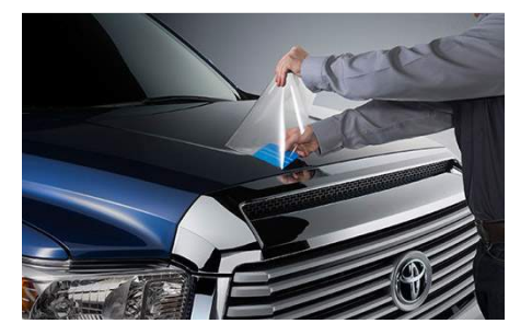
Pro Series Paint Protection Film $430.00

Add functionality with additional Bed Cleats. Designed specifically for the Tundra Bed Rails, they are constructed of sturdy die-cast aluminum, and each fully adjustable Bed Cleat is rated for a maximum load of 220 lb. Sold individually.