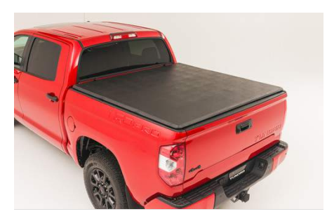
Soft Tri-Fold Tonneau Cover $827.50

The Bed Divider allows you to create a separated partition in your Tundra's bed space, to help keep items from sliding around. The Bed Divider is engineered to work with Tundra's Bed Rails (standard or add-on accessory) and is rated for a 400-lb load capacity. Please note, the Bed Divider accessory cannot be installed in conjunction with the Hard Tri-Fold Tonneau Cover accessory.