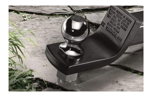
Towing Hitch Ball - 2" - 6,000 lbs $32.50

The Towing Hitch Ball is designed and tested to meet your vehicle's towing specifications and quality standards.