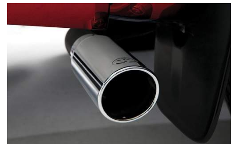
Stainless Steel Exhaust Tip $106.00

Provides a convenient, secure stepping platform that makes it easy to get in and out of the truck bed. •Works with tailgate up or down •Hands-free operation allows users to raise or lower the step by nudging with their foot •Stores discreetly under rear bumper •Lightweight, high-strength aluminum die-cast construction features a glass-reinforced nylon step pad with ribbed, nonskid stepping surface •300-lb. load capacity •Weather-resistant black anodized and Teflon® powder-coat finish for long-term durability •Quick and simple no-drill, bolt-on installation