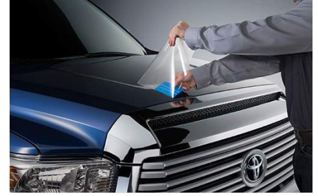
Pro Series Paint Protection Film $430.00

The soft tri-fold tonneau cover gives your truck added versatility. Designed and engineered specifically for your Tundra, this low-profile soft tonneau cover is made from lightweight aluminum and the highest-grade vinyl in the industry. Backed by a factory 3-year/60,000km New Vehicle Limited Warranty, and can be incorporated into your vehicle payments.