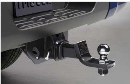
Towing Hitch Ball - 2 5/16" - 14,000 lbs $57.50

The Towing Hitch Ball is designed and tested to meet your vehicle's towing specifications and quality standards.