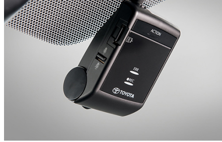
Toyota Genuine Dash Camera $670.10

The Door Sill Protectors help guard against scuffs and scratches. Not only are they functional, but they also provide a styling accent that is immediately noticed when entering the vehicle. Kit of 4 (front and rear).