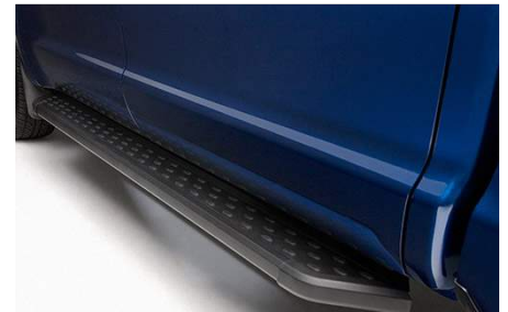
Running Boards $770.01

Gain easy access into your Tundra while enhancing the exterior appearance. These Side Step Bars feature a corrosion-resistant aluminum construction, with a skid-resistant step pad to help ensure secure footing when entering your Tundra.