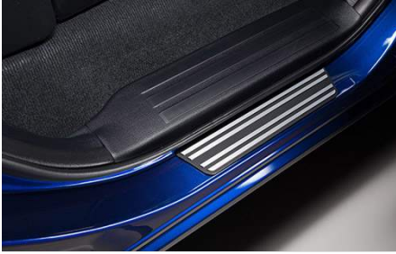
Rear Door Sill Protectors $126.00

The Door Sill Protectors help guard against scuffs and scratches. Not only are they functional, but they also provide a styling accent that is immediately noticed when entering the vehicle. Kit of 2 (rear).