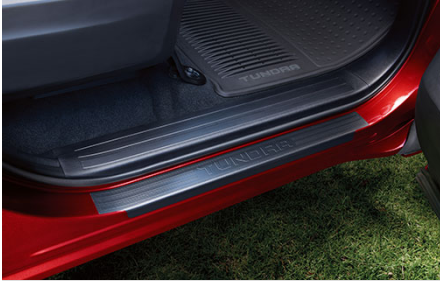
Kit: Door Sill Protectors (front and rear). $132.50

The Door Sill Protectors help guard against scuffs and scratches. Not only are they functional, but they also provide a styling accent that is immediately noticed when entering the vehicle. Kit of 4 (front and rear).