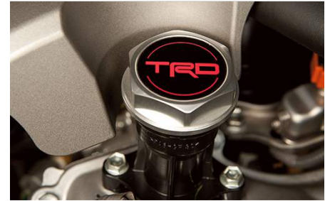
TRD Forged Aluminum Oil Cap $85.50

Keep your oil pure as long as possible, and help enhance the life of your engine, with the TRD Oil Filter that kicks out impurities through a 100% synthetic fiber filtration medium.