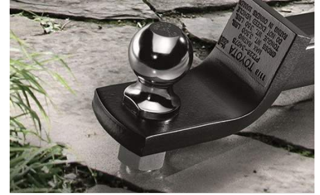
Towing Hitch Ball - 2" - 6,000 lbs $32.50

The Toyota Genuine Dash Camera is designed to provide a safe and memorable driving experience in your Toyota vehicle. Safely record the on-goings of the open road while keeping your eyes on the road. Never miss a moment in motion; capture it! The Toyota Genuine Dash Camera will also allow you to record the surroundings of your vehicle while it is parked.