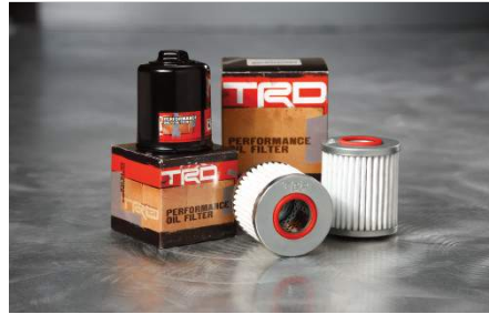
TRD Performance Oil Filter $97.50

• Individual letters fit in the stamped tailgate Tundra logo • Attached with strong 3M adhesive backing • Two colors available: bright chrome and flat black