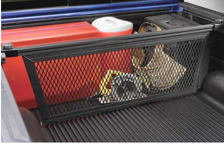
Bed Divider $376.00

The Bed Divider allows you to create a separated partition in your Tundra's bed space, to help keep items from sliding around. The Bed Divider is engineered to work with Tundra's Bed Rails (standard or add-on accessory) and is rated for a 400-lb load capacity. Please note, the Bed Divider accessory cannot be installed in conjunction with the Hard Tri-Fold Tonneau Cover accessory.