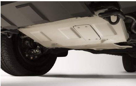
TRD Front Skid Plate $732.00

Versatile tri-fold design to suit all kinds of cargo needs. - The hard tri-fold tonneau cover adds extra security with five rotary latches, so you can rest assured that your cargo is protected. - This hard tri-fold tonneau cover is weather-resistant and can fold to the cab for bed access - Meets Toyota's high quality standard