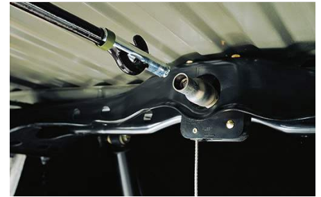
Spare Tire Lock $96.50

Add functionality with additional Bed Cleats. Designed specifically for the Tundra Bed Rails, they are constructed of sturdy die-cast aluminum, and each fully adjustable Bed Cleat is rated for a maximum load of 220 lb. Sold individually.