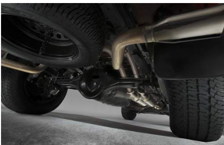
TRD Performance Dual Exhaust System $1,479.00

This TRD sway bar enhances the vehicle's handling characteristics, and provides a more stable cornering stance. It features a gloss red powder coat finish that resists corrosion and protects against road damage, while providing a striking visual enhancement.