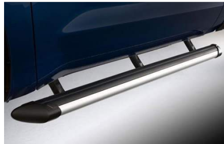
Side Step Bars - 4-inch Aluminum $675.00

• Individual letters fit in the stamped tailgate Tundra logo • Attached with strong 3M adhesive backing • Two colors available: bright chrome and flat black