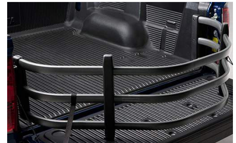
Bed Extender $505.50

Protect your Tundra's bed when you need it. Custom designed for an exact fit, the Bed Mat protects against scratches, spills, and damage. Made from thick cord-reinforced, synthetic rubber for durability, the Bed Mat is resistant to cracking and breaking while providing airflow and drainage to keep the Tundra's bed dry. The anti-slip design also prevents items from sliding around in the bed area.