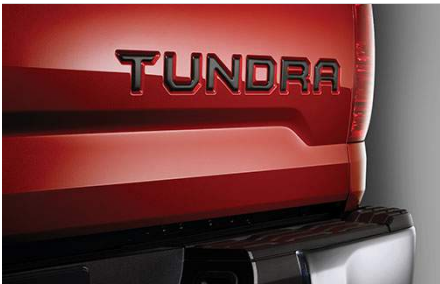
Black Tailgate Insert Badge $116.50

Manufactured from forged, highly polished billet aluminum, the TRD Oil Cap features a red on black TRD logo to customize the engine compartment with a high-tech, race-inspired appearance. It's finished with a high-luster coating to maintain its appearance for years to come.