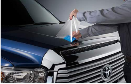
Pro Series Paint Protection Film $430.00

Guard your vehicle from weathering, UV radiation and road debris that can chip and scratch the finish with 3M Pro Series Genuine Toyota Paint Protection Film. This durable and nearly invisible thermoplastic urethane is designed to protect the hood and front fenders to maintain a like-new appearance. Backed by a 10 year limited warranty.