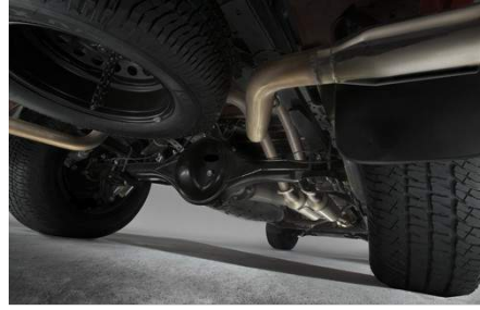
TRD Performance Dual Exhaust System $1,479.00

The Towing Mirrors help with visibility by being able to extend 4-in. to provide an even wider rear field of vision. They also feature integrated turn signals to help make your signaling more visible to other drivers.