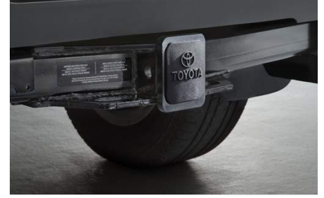
Towing Hitch with Connector (4.6L Models) $740.50

The Toyota Genuine Dash Camera is designed to provide a safe and memorable driving experience in your Toyota vehicle. Safely record the on-goings of the open road while keeping your eyes on the road. Never miss a moment in motion; capture it! The Toyota Genuine Dash Camera will also allow you to record the surroundings of your vehicle while it is parked.