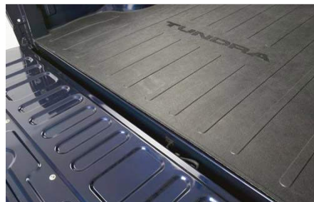
Bed Mat $194.50

Add even more versatility to your Tundra with the Bed Rail system. Galvanized steel construction provides superior strength while black powder coating resists corrosion. The kit includes four die-cast aluminum tie-down Bed Cleats, which are rated for loads up to 880 lb. (220 lb. each). The Bed Rails also allow you to add additional accessories to the Tundra's bed, such as the Bed Divider.