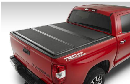
Hard Tri-Fold Tonneau Cover $1,605.00

Keep your oil pure as long as possible, and help enhance the life of your engine, with the TRD Oil Filter that kicks out impurities through a 100% synthetic fiber filtration medium.