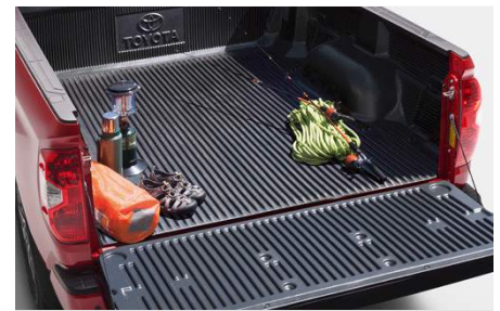
Bed Liner (Accommodates bed rails) $549.00

Manufactured from forged, highly polished billet aluminum, the TRD Oil Cap features a red on black TRD logo to customize the engine compartment with a high-tech, race-inspired appearance. It's finished with a high-luster coating to maintain its appearance for years to come.