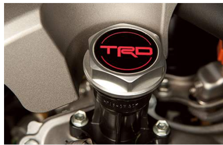
TRD Forged Aluminum Oil Cap $85.50

Versatile tri-fold design to suit all kinds of cargo needs. - The hard tri-fold tonneau cover adds extra security with five rotary latches, so you can rest assured that your cargo is protected. - This hard tri-fold tonneau cover is weather-resistant and can fold to the cab for bed access - Meets Toyota's high quality standard