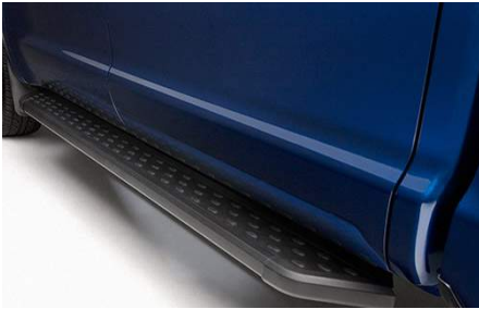
Running Boards $770.01

Gain easy access into your Tundra while enhancing the exterior appearance. These Side Step Bars feature a corrosion-resistant aluminum construction, with a skid-resistant step pad to help ensure secure footing when entering your Tundra.