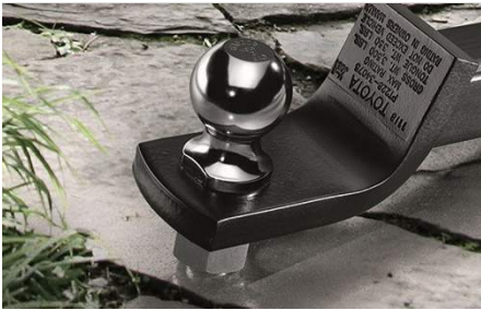
Towing Hitch Ball - 2" - 6,000 lbs $32.50

Specifically engineered for Tundra to obtain the safest maximum tow rating and to meet or exceed all industry towing standards. It is e-coated and powder coated to prevent rust and corrosion.