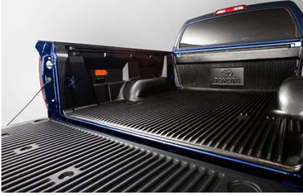
Bed Liner (Accommodates bed rails) $799.00

Keeps Tundra's bed looking new; the custom-fitted Bed Liner for Tundra not only protects against dents and scratches but also reduces mold and mildew by allowing drainage and increased airflow. The Liner, featuring a no-drill attachment system and made from high-density polyethylene copolymer, keeps loads from moving around in the bed. The Bed Liner also includes protection for the tailgate.