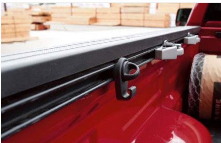
Bed Rail $343.00

Enhances Tundra's tough, capable stance and helps protect vehicle underbody from damage that can result from flying stones, salt, branches, ice chunks, and other types of road debris. Made from stamped and formed 1/4-in.-thick silver powder-coated aluminum.