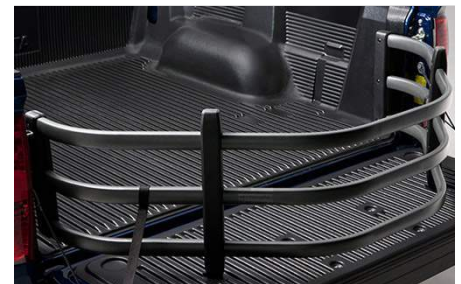
Bed Extender $505.50

Protect your Tundra's bed when you need it. Custom designed for an exact fit, the Bed Mat protects against scratches, spills, and damage. Made from thick cord-reinforced, synthetic rubber for durability, the Bed Mat is resistant to cracking and breaking while providing airflow and drainage to keep the Tundra's bed dry. The anti-slip design also prevents items from sliding around in the bed area.