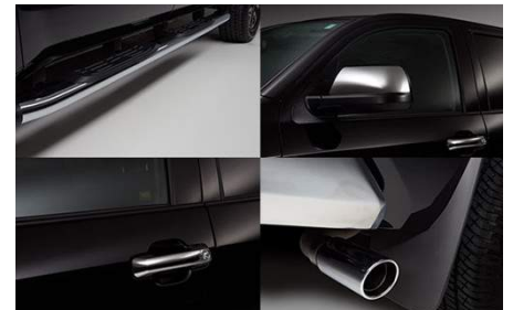
Chrome Accent Package $1,371.00

This TRD sway bar enhances the vehicle's handling characteristics, and provides a more stable cornering stance. It features a gloss red powder coat finish that resists corrosion and protects against road damage, while providing a striking visual enhancement.