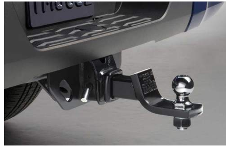
Towing Hitch Ball - 2 5/16" - 14,000 lbs $57.50

The Towing Hitch Ball is designed and tested to meet your vehicle's towing specifications and quality standards.