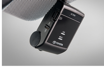
Toyota Genuine Dash Camera $670.10

The Door Sill Protectors help guard against scuffs and scratches. Not only are they functional, but they also provide a styling accent that is immediately noticed when entering the vehicle. Kit of 4 (front and rear).