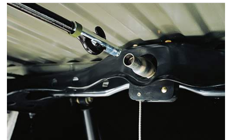
Spare Tire Lock $96.50

A custom-designed system with 400 watts of heating power not only warms a vehicle up quicker but also reduces engine strain and wear. The heater also saves fuel and battery power during start-ups. With the socket conveniently integrated into the front valence, the Plug-In Block Heater has a factory finished look. It comes with both a main 8-foot and spare 18-inch power supply cord, with a 16-foot cord available separately.