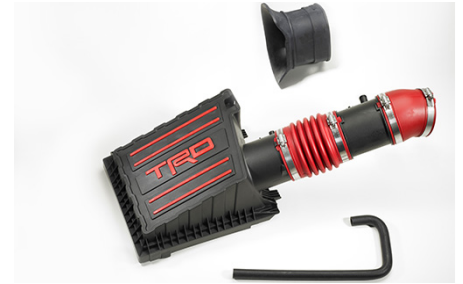
TRD Performance Air Intake System $602.50

Gain easy access into your Tundra while enhancing the exterior appearance. These durable and robust 5-inch Side Step Bars feature dual-moulded, skid-resistant step pads and come in a brilliant chrome finish. Not only does the chrome finish look great, it also provides protection against the elements.