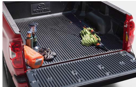
Bed Liner (Incompatible with Bed Rails) $549.00

A convenient storage tray, custom-designed for your Tundra's center console area. Three distinct compartments provide areas for coins or small objects, phones, tablets, and tools. The console also features railings to accommodate letter-size hanging file folders.