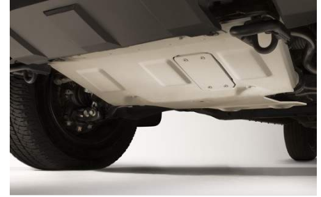
TRD Front Skid Plate $732.00

Versatile tri-fold design to suit all kinds of cargo needs. - The hard tri-fold tonneau cover adds extra security with five rotary latches, so you can rest assured that your cargo is protected. - This hard tri-fold tonneau cover is weather-resistant and can fold to the cab for bed access - Meets Toyota's high quality standard