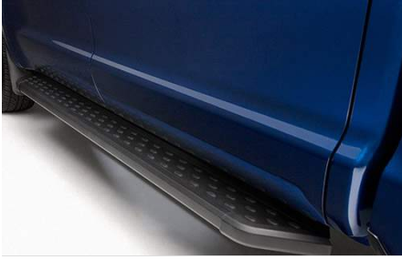
Running Boards $770.01

Not only do the Running Boards assist with entering your Tundra, they also help protect the lower body from road debris. Constructed from highly durable aluminum for corrosion-resistance, they feature a wide-step surface with rubber grommets to help ensure a secure footing. Engineered to mount securely to the Tundra's sides using existing mounting points.