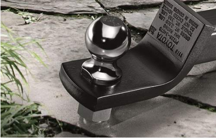
Towing Hitch Ball - 2" - 6,000 lbs $32.50

The Towing Hitch Ball is designed and tested to meet your vehicle's towing specifications and quality standards.