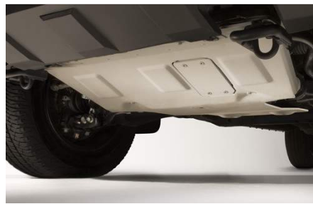
TRD Front Skid Plate $732.00

It's simple physics. Increasing air flow helps increase performance! When you add a TRD Performance Air Intake System to your truck you get all the benefits of free-flowing colder air. These systems have been dyno tested to deliver enhanced horsepower and torque for superior acceleration, plus more pulling power.