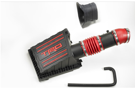
TRD Performance Air Intake System $602.50

Boost the look of your Tundra by adding TRD centre wheel caps for extra ruggedness.