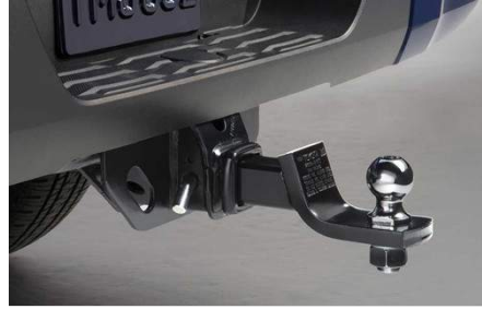
Towing Hitch Ball - 2 5/16" - 14,000 lbs $57.50

The Towing Hitch Ball is designed and tested to meet your vehicle's towing specifications and quality standards.