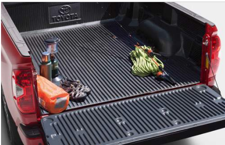
Bed Liner (Accommodates bed rails) $549.00

Manufactured from forged, highly polished billet aluminum, the TRD Oil Cap features a red on black TRD logo to customize the engine compartment with a high-tech, race-inspired appearance. It's finished with a high-luster coating to maintain its appearance for years to come.