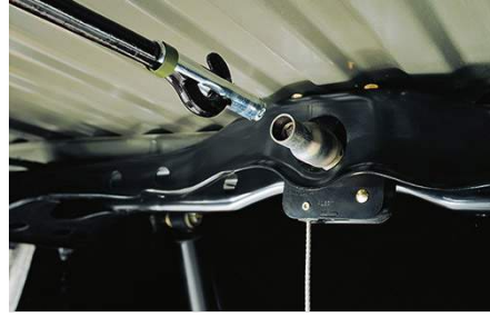
Spare Tire Lock $96.50

Guard your vehicle from weathering, UV radiation and road debris that can chip and scratch the finish with 3M Pro Series Genuine Toyota Paint Protection Film. This durable and nearly invisible thermoplastic urethane is designed to protect the hood and front fenders to maintain a like-new appearance. Backed by a 10 year limited warranty.