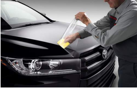
Pro Series Paint Protection Film $430.00

Guard your Highlander from weathering, UV radiation and road debris that can chip and scratch the finish with 3M Pro Series Genuine Toyota Paint Protection Film. This durable and nearly invisible thermoplastic urethane is designed to protect the hood and front fenders to maintain a like-new appearance. Backed by a 10 year limited warranty. At participating dealers only.