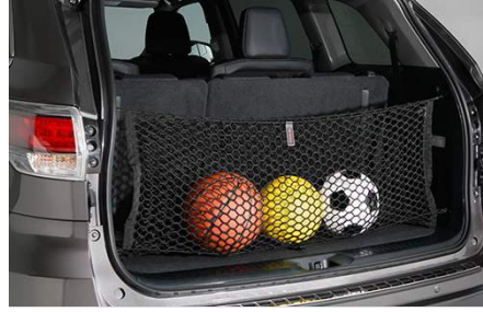
Cargo Net $72.50

Guard your Highlander from weathering, UV radiation and road debris that can chip and scratch the finish with 3M Pro Series Genuine Toyota Paint Protection Film. This durable and nearly invisible thermoplastic urethane is designed to protect the hood and front fenders to maintain a like-new appearance. Backed by a 10 year limited warranty. At participating dealers only.