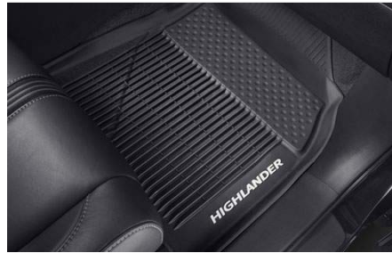
Tub Style All Season Floor Mats (Front and Rear) $165.50

The Towing Hitch system is specifically designed and manufactured for Highlander and Highlander Hybrid models, and has been engineered to obtain the vehicle's safest maximum tow rating. The included Towing Hitch Wire Harness with 4 pin flat connector seamlessly integrates with Highlander and Highlander Hybrid's electrical system. All Toyota Genuine Hitch systems are e-coated and powder coated to prevent rust and corrosion and they are designed to meet or exceed all industry towing standards.