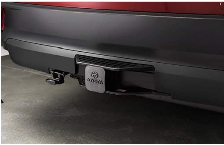
Towing Hitch with Wire Harness $977.00

Designed and engineered to work with the Toyota Genuine Towing Hitch, the Ball Platform is built and tested to meet your Highlander or Highlander Hybrid's exact towing capacity. Its placement has been optimized to maintain the proper vehicle departure angle.