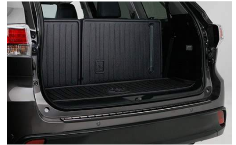
Cargo Liner $140.50

The Towing Hitch Ball is designed and tested to meet Highlander and Highlander Hybrid's towing specifications and quality standards. It works seamlessly with the accessory Towing Hitch.