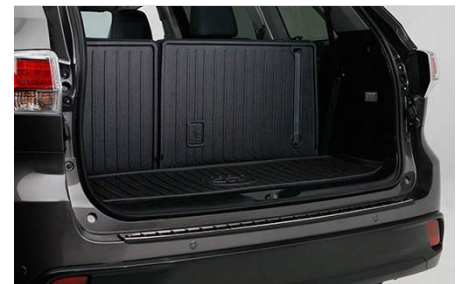
Cargo Liner $140.50

The Towing Hitch Ball is designed and tested to meet Highlander and Highlander Hybrid's towing specifications and quality standards. It works seamlessly with the accessory Towing Hitch.