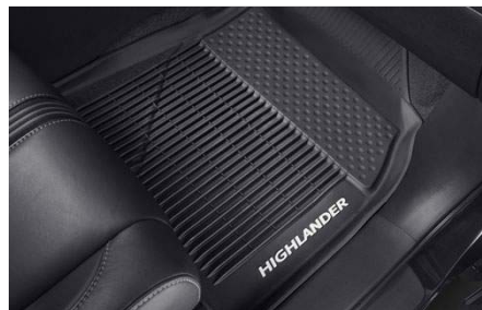
Tub Style All Season Floor Mats (Front and Rear) $165.50

The Towing Hitch system is specifically designed and manufactured for Highlander and Highlander Hybrid models, and has been engineered to obtain the vehicle's safest maximum tow rating. The included Towing Hitch Wire Harness with 4 pin flat connector seamlessly integrates with Highlander and Highlander Hybrid's electrical system. All Toyota Genuine Hitch systems are e-coated and powder coated to prevent rust and corrosion and they are designed to meet or exceed all industry towing standards.