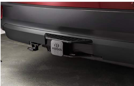
Towing Hitch with Wire Harness $977.00

Designed and engineered to work with the Toyota Genuine Towing Hitch, the Ball Platform is built and tested to meet your Highlander or Highlander Hybrid's exact towing capacity. Its placement has been optimized to maintain the proper vehicle departure angle.