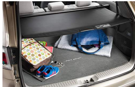
Tonneau Cover $230.50

Designed and engineered to work with the Toyota Genuine Towing Hitch, the Ball Platform is built and tested to meet your Highlander or Highlander Hybrid's exact towing capacity. Its placement has been optimized to maintain the proper vehicle departure angle.