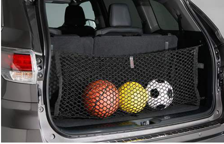
Cargo Net $72.50

The Cargo Net features hammock-style netting with elastic closure. This flexible and stretchable, nylon-braided net secured by tie-down rings in Highlander and Highlander Hybrid's rear cargo area prevents items from shifting around while on the road. Easy to install, and remove when not in use.