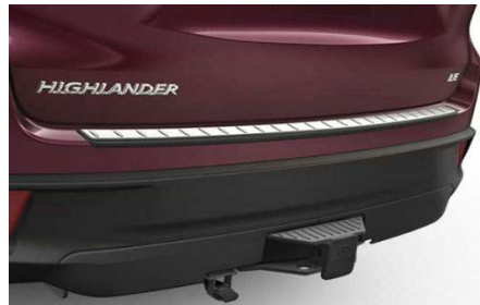
Towing Hitch with Wire Harness $977.00

Toyota Tub Style All-Season Floor Mats are an advanced concept in superior protection for the vehicle's interior. • These floor mats fully cover the floor and surrounding edges on all sides. • Sculpted channels are designed to trap water, mud, moisture, and debris, and help keep carpet clean and dry • The high-tech composite materials ensure these mats will not crack or harden in freezing weather • Anti-skid ridges make the mats perfectly fit in your vehicle, and prevent them from shifting • One piece rear mat to help provide more complete coverage • Molded Highlander logo on the front mats