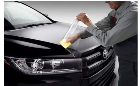
Pro Series Paint Protection Film $430.00

The Tonneau Cover conceals the rear cargo area from view for increased privacy and added peace of mind. The cover also conveniently retracts when not in use and can be stored in the Highlander's subfloor compartment to make room for larger items. Available in black or beige.