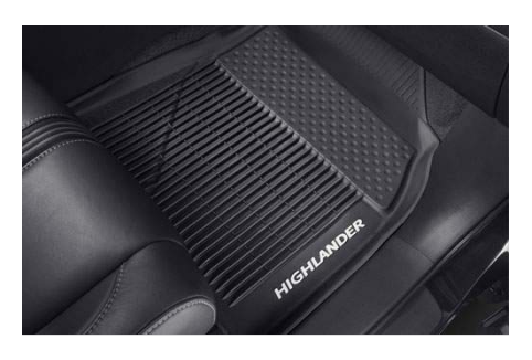
Tub Style All Season Floor Mats (Front and Rear) $165.50

The Towing Hitch Ball is designed and tested to meet Highlander and Highlander Hybrid's towing specifications and quality standards. It works seamlessly with the accessory Towing Hitch.