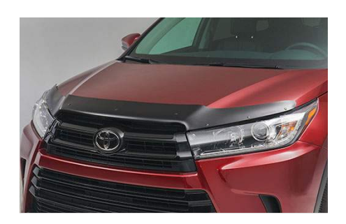
Hood Deflector $207.50

Made from thick high-grade tinted acrylic, the Hood Deflector offers high impact resistance and reduces the potential damage to your hood from road debris. The stylish wraparound design complements the vehicle's appearance while providing extra side protection.