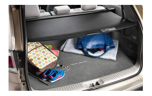
Tonneau Cover $230.50

Designed and engineered to work with the Toyota Genuine Towing Hitch, the Ball Platform is built and tested to meet your Highlander or Highlander Hybrid's exact towing capacity. Its placement has been optimized to maintain the proper vehicle departure angle.