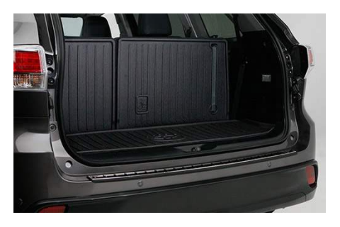
Cargo Liner $140.50

Guard your Highlander from weathering, UV radiation and road debris that can chip and scratch the finish with 3M Pro Series Genuine Toyota Paint Protection Film. This durable and nearly invisible thermoplastic urethane is designed to protect the hood and front fenders to maintain a like-new appearance. Backed by a 10 year limited warranty. At participating dealers only.