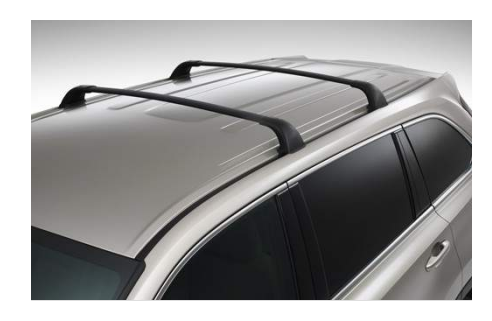
Cross Bars $452.50

A custom-designed system with 400 watts of heating power not only warms a vehicle up quicker but also reduces engine strain and wear. The heater also saves fuel and battery power during startups. With the socket conveniently integrated into the front valence, the Plug-In Block Heater has a factory finished look. It comes with both a main 8-foot and spare 18-inch power supply cord, with a 16-foot cord available separately.