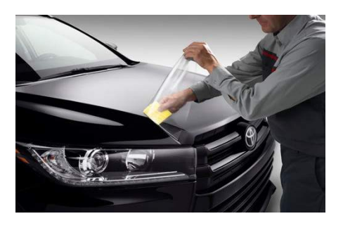
Pro Series Paint Protection Film $430.00

The Tonneau Cover conceals the rear cargo area from view for increased privacy and added peace of mind. The cover also conveniently retracts when not in use and can be stored in the Highlander's subfloor compartment to make room for larger items. Available in black or beige.