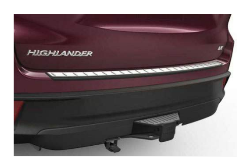
Towing Hitch with Wire Harness

The Towing Hitch system is specifically designed and manufactured for Highlander and Highlander Hybrid models, and has been engineered to obtain the vehicle's safest maximum tow rating. The included Towing Hitch Wire Harness with 4 pin flat connector seamlessly integrates with Highlander and Highlander Hybrid's electrical system. All Toyota Genuine Hitch systems are e-coated and powder coated to prevent rust and corrosion and they are designed to meet or exceed all industry towing standards.