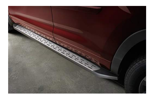
Running Boards $940.00

Made from thick high-grade tinted acrylic, the Hood Deflector offers high impact resistance and reduces the potential damage to your hood from road debris. The stylish wraparound design complements the vehicle's appearance while providing extra side protection.