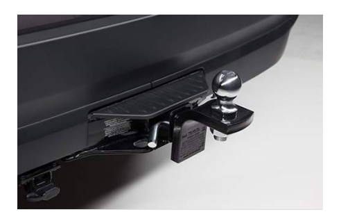
Towing Hitch Ball Platform $95.50

Not only do Running Boards assist with entering a vehicle, they also help protect the lower body from road debris. The Running Boards feature a stainless steel finish with a raised-rubber pattern to help ensure secure footing when entering and exiting the vehicle. Designed exclusively for Highlander and Highlander Hybrid, the Running Boards seamlessly integrate with the vehicle's new dynamic and stylish exterior look.