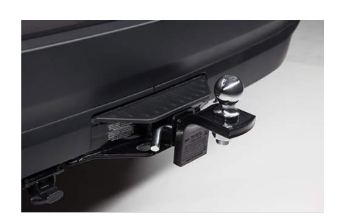
Towing Hitch Ball - 2" - 6,000 lbs $32.50

The Towing Hitch Ball is designed and tested to meet Highlander and Highlander Hybrid's towing specifications and quality standards. It works seamlessly with the accessory Towing Hitch.