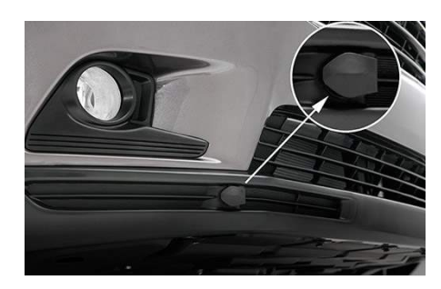
Plug-In Block Heater $411.50

The Towing Hitch system is specifically designed and manufactured for Highlander and Highlander Hybrid models, and has been engineered to obtain the vehicle's safest maximum tow rating. The included Towing Hitch Wire Harness with 4 pin flat connector seamlessly integrates with Highlander and Highlander Hybrid's electrical system. All Toyota Genuine Hitch systems are e-coated and powder coated to prevent rust and corrosion and they are designed to meet or exceed all industry towing standards.