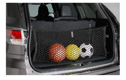
Cargo Net $72.50

The Cargo Net features hammock-style netting with elastic closure. This flexible and stretchable, nylon-braided net secured by tie-down rings in Highlander and Highlander Hybrid's rear cargo area prevents items from shifting around while on the road. Easy to install, and remove when not in use.