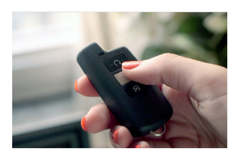
START+ Long Range Remote Engine Starter (Non Smart Key)

Body Side Mouldings protect Highlander or Highlander Hybrid from dings and bumps, while adding a touch of elegance to the vehicle's exterior. Constructed from highly durable material that has undergone Toyota's rigorous product testing, the Body Side Mouldings offer long-lasting protection from any type of minor incidental contact to the sides of the vehicle.