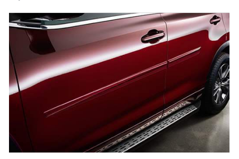
Body Side Moulding $289.50

Body Side Mouldings protect Highlander or Highlander Hybrid from dings and bumps, while adding a touch of elegance to the vehicle's exterior. Constructed from highly durable material that has undergone Toyota's rigorous product testing, the Body Side Mouldings offer long-lasting protection from any type of minor incidental contact to the sides of the vehicle.