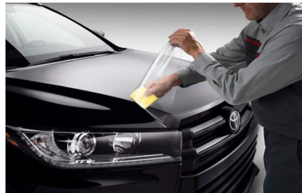
Pro Series Paint Protection Film $430.00

Designed and engineered to work with the Toyota Genuine Towing Hitch, the Ball Platform is built and tested to meet your Highlander or Highlander Hybrid's exact towing capacity. Its placement has been optimized to maintain the proper vehicle departure angle.