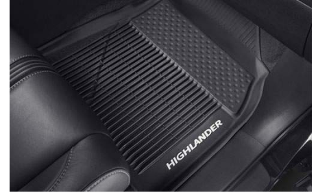
Tub Style All Season Floor Mats (Front and Rear) $165.50

The Towing Hitch Ball is designed and tested to meet Highlander and Highlander Hybrid's towing specifications and quality standards. It works seamlessly with the accessory Towing Hitch.