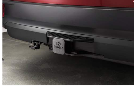
Towing Hitch with Wire Harness $977.00

Made from thick high-grade tinted acrylic, the Hood Deflector offers high impact resistance and reduces the potential damage to your hood from road debris. The stylish wraparound design complements the vehicle's appearance while providing extra side protection.