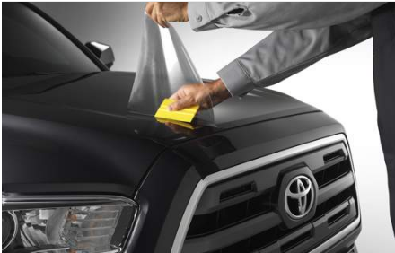
Pro Series Paint Protection Film $430.00

Further enhance your Tacoma's utility and versatility by adding some additional tie-down bed cleats. The tie-down bed cleats are fully adjustable and slide along your Tacoma's bed rail system. They are held in place by a spring-loaded, twist /locking clamp, giving you the ultimate flexibility to place them anywhere along your bed rails.