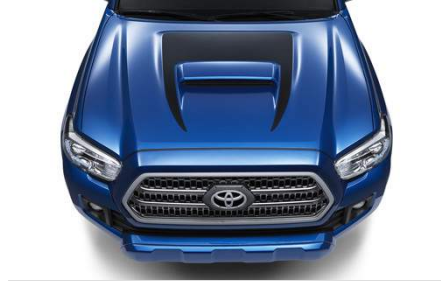
Hood Graphic $171.00

Energize the brute within with some deep breathing exercises. The TRD exhaust gives your engine greater power with a less restrictive path, while bellowing out a deep, throaty tone. Made from premium stainless steel grades, and featuring a cat-back exhaust design with TRD logo-etched exhaust tip. The TRD Performance Exhaust System allows for a less restrictive path, helping to reduce backpressure for added low-to mid-range torque, along with improved horsepower.