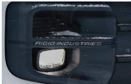
TRD LED Fog Lights $690.25

Not only do running boards assist in entering a vehicle, they also help protect the lower body from road debris. Constructed with high quality material, they feature a wide-step surface with plastic step pad. The custom engineering ensures a perfect fit and easy installation.