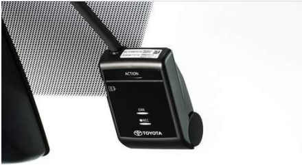
Toyota Genuine Dash Camera $620.50

The Toyota Genuine Dash Camera is designed to provide a safe and memorable driving experience in your Toyota vehicle. Safely record the on-goings of the open road while keeping your eyes on the road. Never miss a moment in motion; capture it! The Toyota Genuine Dash Camera will also allow you to record the surroundings of your vehicle while it is parked.