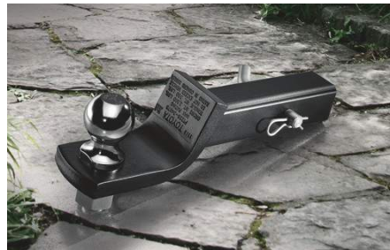
Towing Hitch Ball - 2 5/16" - 14,000 lbs $57.50

Enhance your connection to your Tacoma every time you shift with the TRD Shift Knob. Delivers an enhanced shifting feel while providing an impressive addition to your interior.