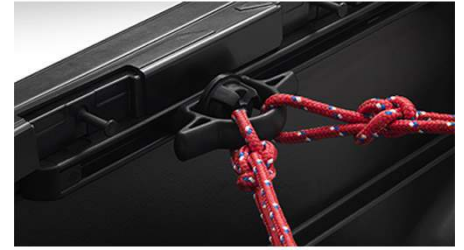
Bed Cleat $55.50

The extra large truck bed can be too big sometimes. The cargo divider will allow you to create a smaller partition of your bed space to keep your cargo or boxes from flying around inside your truck bed.