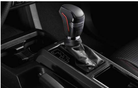
TRD Shift Knob $175.50

The Toyota Towing Hitch Ball is designed and tested to meet your Toyota's towing specification and quality standards.