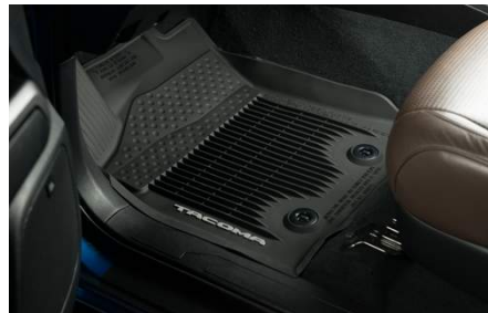
Tub Style All Season Floor Mats $165.50

High-performance LED truck bed lighting helps improve cargo management at night or in dark locations •Two separate light assemblies—on the inside bed walls and near the rear of the cargo area—provide excellent light distribution while loading and unloading •Precise placement angles lights toward important cargo locations •Constructed of high-quality, durable materials