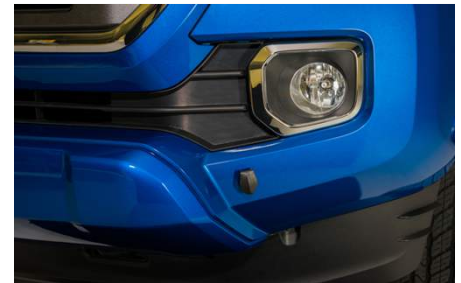
Plug-In Block Heater $411.50

The Toyota Towing Hitch Ball is designed and tested to meet your Toyota's towing specification and quality standards.