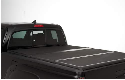
Hard Tri-Fold Tonneau Cover $1,513.00

Versatile tri-fold design to suit all kinds of cargo needs. - The hard tri-fold tonneau cover adds extra security with five rotary latches, so you can rest assured that your cargo is protected. - This hard tri-fold tonneau cover is weather-resistant and can fold to the cab for bed access - Meets Toyota's high quality standard