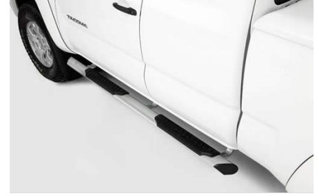
Side Step Bars - 4-inch $575.00

Gain easy access into your Tacoma while enhancing the exterior appearance. These durable and robust 5-inch Side Step Bars feature dual-moulded, skid-resistant step pads and come in a brilliant chrome finish. Not only does the chrome finish look great, it also provides protection against the elements.