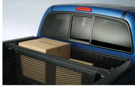
Bed Divider $446.00

Versatile tri-fold design to suit all kinds of cargo needs. - The hard tri-fold tonneau cover adds extra security with five rotary latches, so you can rest assured that your cargo is protected. - This hard tri-fold tonneau cover is weather-resistant and can fold to the cab for bed access - Meets Toyota's high quality standard