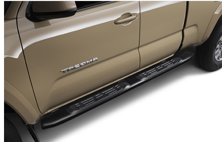
5-in. Oval Tube Steps - Black $808.50

Guard your Tacoma from weathering, UV radiation and road debris that can chip and scratch the finish with 3M Pro Series Genuine Toyota Paint Protection Film. This durable and nearly invisible thermoplastic urethane is designed to protect the hood and front fenders to maintain a like-new appearance. Backed by a 10 year limited warranty. At participating dealers only