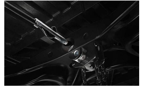
Spare Tire Lock $96.50

These durable TRD 16-inch off-road beadlock wheels offer owners a distinctive and rugged upgrade to their stock wheels. Constructed of low-pressure alloy, the wheels provide a higher strength-to-weight ratio for optimal performance. They feature a bronze painted finish and machined outer lip with beadlock styling. TRD embossed snap-in center cap included.