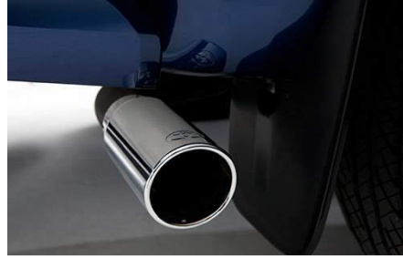
Exhaust Tip $103.50

Designed to offer an extra measure of cargo carrying capacity, these truck bed D-rings help provide a secure method of tying down equipment and gear in the Tacoma bed. Sturdy construction and pivoting capability allow for multiple positions and use. (Max capacity per ring is 199.6 kgs).