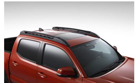
Roof Rack $517.50

Engineered by TRD, these intense LED fog lights pack a lot of brightness into a compact package. Aluminum housings feature the Rigid Industries® logo, and rugged construction helps ensure that these lights can endure harsher environments. With their wide-angle beam pattern, these lights help ensure you have light when, and where, you need it.