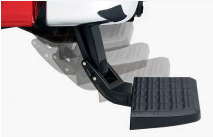
Rear Bumper Step $345.50

A rugged good look. The dual step pads not only help passengers get into a vehicle but also give the vehicle a rugged look. Available in Aluminium, these wedge step bars are custom fitted and designed for your vehicle. Plus, the steps are easy to install since no drilling is required.