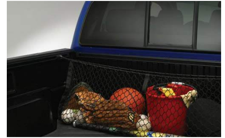
Cargo Net $55.51

Protect your truck bed when you need it. Custom designed for an exact fit, the mat protects against scratches, spills and damage. Made from thick cord-reinforced, synthetic rubber for durability, the mat is resistant to cracking and breaking while also providing airflow and drainage to keep the truck bed dry. The anti-slip design also prevents items from sliding in the cargo area. Mat can also be trimmed to fit into a truck with a bedliner.