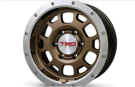
TRD 16" Off-Road Beadlock-Style Alloy Wheels - Bronze

The Toyota Genuine Dash Camera is designed to provide a safe and memorable driving experience in your Toyota vehicle. Safely record the on-goings of the open road while keeping your eyes on the road. Never miss a moment in motion; capture it! The Toyota Genuine Dash Camera will also allow you to record the surroundings of your vehicle while it is parked.