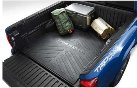
Bed Mat $154.50

Make the access to your Tacoma a little simpler by installing the Tacoma Bed Step. Made from high quality aluminium, this step has a 136 kg (300 lbs.) load rating, bolts directly on (no drilling required) and tucks up out of sight when not in use.