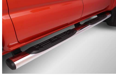
Side Step Bars - 5-inch Chrome $893.50

It's simple physics. Increasing air flow helps increase performance! When you add a TRD Performance Air Intake System to your truck you get all the benefits of free-flowing colder air. These systems have been dyno tested to deliver enhanced horsepower and torque for superior acceleration, plus more pulling power.