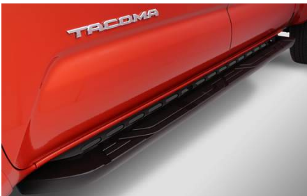
Running Boards $519.98

Secure your spare tire with a precision machined lock constructed of hardened steel with zinc-nickel plating. It quickly attaches to the spare's crank-down tool receiver mechanism, and the key attaches to the crank-down tool in the vehicle's tool kit.