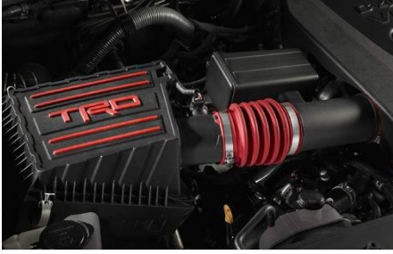
TRD Performance Air Intake System $752.00

It's simple physics. Increasing air flow helps increase performance! When you add a TRD Performance Air Intake System to your truck you get all the benefits of free-flowing colder air. These systems have been dyno tested to deliver enhanced horsepower and torque for superior acceleration, plus more pulling power.