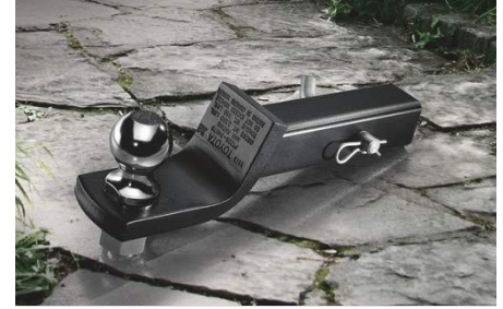
Towing Hitch Ball - 2" - 6,000 lbs $32.50

Add to your Tacoma's bold style with these shiny exhaust tips. Built Toyota-tough, they're constructed from polished, corrosion resistant double-walled 304 stainless steel. Plus, they're easy to install – no cutting, drilling or welding! Features a finely etched Toyota logo.