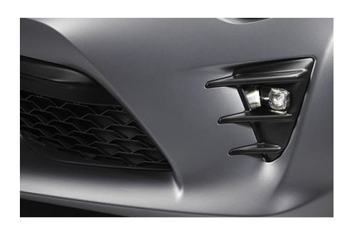
LED Fog Light Kit $660.00

Protection for a long-lasting cargo area. This durable, long-lasting custom designed vinyl liner features a raised lip to contain spills for simple cleanup. Textured finish minimizes load shifting and the cargo area carpeting gets extra protection for wear and tear. The easy-to-install liner is equally simple to remove for cleaning. It's the ideal place for storing wet and dirty cargo. Consider it the ultimate way to protect the vehicle interior from scratches and spills.