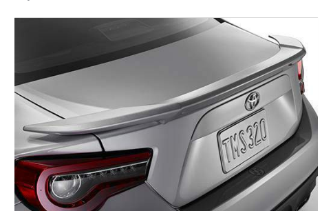
Rear Spoiler $599.00

Manufactured from high-quality, lightweight materials, the 86 rear spoiler features precisely sculpted detail to add a sporty, integrated appearance to the vehicle. Paint color is matched to the vehicle's color palette and paint quality meets factory specifications for appearance and performance.