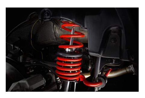
TRD Lowering Springs $1,077.50

Made from thick high-grade tinted acrylic, the Hood Deflector offers high impact resistance and reduces the potential damage to your hood from road debris. The stylish wraparound design complements the vehicle's appearance while providing extra side protection.