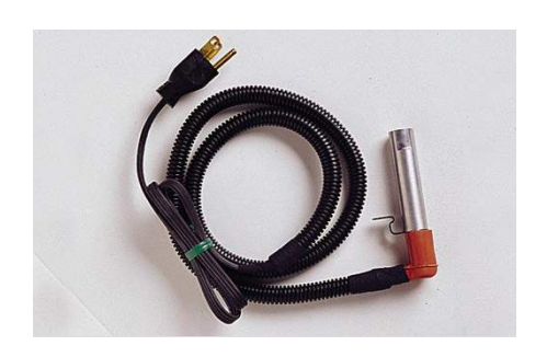
Block Heater $485.00

This custom-designed Block Heater not only warms your vehicle up quicker, but also reduces engine strain and wear. The system also helps to save fuel and battery power during startups, and the strain relief electrical cord reduces cord damage.