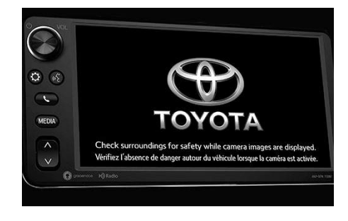
Premium Display Audio with Navigation $1,183.00

Guard your vehicle from weathering, UV radiation and road debris that can chip and scratch the finish with 3M Pro Series Genuine Toyota Paint Protection Film. This durable and nearly invisible thermoplastic urethane is designed to protect the hood and front fenders to maintain a like-new appearance. Backed by a 10 year limited warranty.