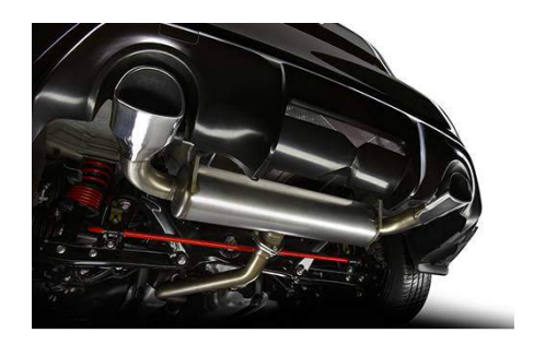
TRD Exhaust System $1,526.50

Like a living thing, an engine needs to breathe. Increase the quality of air that flows to your powerplant and quantifiably increase its performance with the TRD Performance Air Intake. Features reusable TRD high-flow air filter Dynotested to deliver an increase in both horsepower and torque for improved acceleration Designed to work with the factory ECU and emissions system Tested according to TRD's stringent performance standards