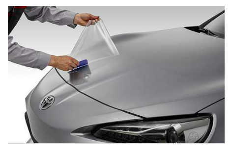
Pro Series Paint Protection Film $430.00

•Enhances style and functionality of the vehicle •Seamless integration of fog lamps into bumper •Helps provide visibility in severe inclement weather conditions and night driving •Designed to complement the vehicle's exterior lines •Helps provide added measure of security •Wide-angle high intensity LED lights