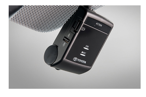
Toyota Genuine Dash Camera $682.50

TRD's high-performance, high-friction brake pads are made from an aramid-and ceramic-strengthened compound, delivering an optimum combination of cold and hot friction, along with a high maximum operating temperature and low noise levels. Delivering increased braking performance while decreasing brake fade during repeated stops or extended downhill driving, TRD brake pads are engineered to minimize brake noise and enhance stopping power.