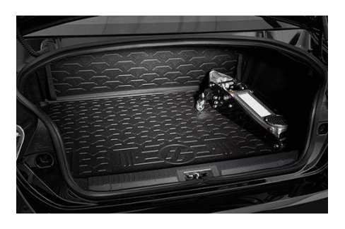
Cargo Liner $150.50

The Toyota Genuine Side Window Deflectors are aerodynamically shaped to minimize wind noise and buffering when driving with open windows. The deflectors are designed to integrate flawlessly with your vehicle, while maintaining its sleek look. Breathe in the fresh air without having to worry about wind, rain or the cold Canadian snow.