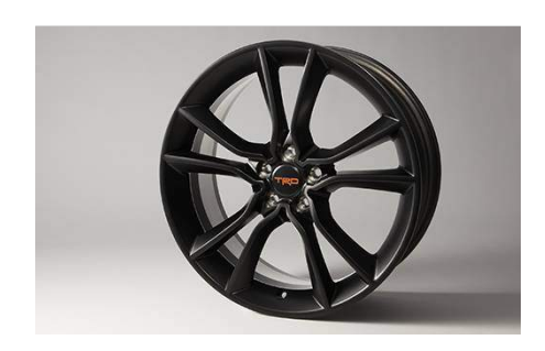
TRD 18" Alloy Wheel (Staggered Fitment)

Manufactured from high-quality, lightweight materials, the 86 rear spoiler features precisely sculpted detail to add a sporty, integrated appearance to the vehicle. Paint color is matched to the vehicle's color palette and paint quality meets factory specifications for appearance and performance.