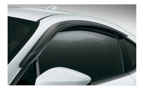
Side Window Deflectors $187.50

Prevent scrapes and scratches from daily vehicle use with Toyota's Rear Bumper Appliqué. It is specifically designed to maintain your vehicle's flawless bumper surface. This durable, clear and UV-resistant protection film is custom fitted to your vehicle and is stylishly outfitted with the Toyota logo. It's the stain, chemical and fuel resistant barrier your paint has been waiting for.