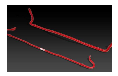
TRD Sway Bars $934.50

Engineered by TRD to enhance the vehicle's handling characteristics, the sway bars provide a flatter, more stable cornering stance, reducing front wheel slip and limiting body roll without adding harshness to the ride. Constructed of high-quality alloy steel, the sway bars feature a gloss red powder coat finish that resists corrosion and protects against road damage, while providing a striking visual enhancement to the underbody of the vehicle.