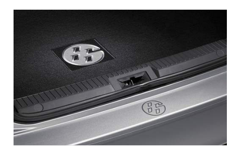
Rear Bumper Appliqué $106.50

Prevent scrapes and scratches from daily vehicle use with Toyota's Rear Bumper Appliqué. It is specifically designed to maintain your vehicle's flawless bumper surface. This durable, clear and UV-resistant protection film is custom fitted to your vehicle and is stylishly outfitted with the Toyota logo. It's the stain, chemical and fuel resistant barrier your paint has been waiting for.