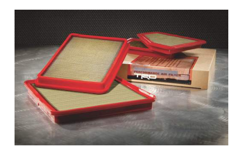
TRD Air Filter $111.50

This custom-designed Block Heater not only warms your vehicle up quicker, but also reduces engine strain and wear. The system also helps to save fuel and battery power during startups, and the strain relief electrical cord reduces cord damage.