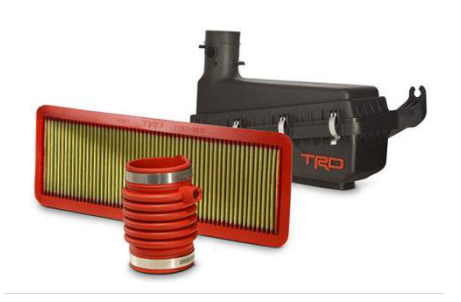
TRD Performance Air Intake $576.50

Pre-oiled and ready to install. Washable and reusable. This exact drop-in replacement filter will last the life of the vehicle, provide unrivalled engine protection and increase air flow.