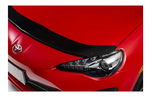
Hood Deflector $186.00

Engineered by TRD to enhance the vehicle's handling characteristics, the sway bars provide a flatter, more stable cornering stance, reducing front wheel slip and limiting body roll without adding harshness to the ride. Constructed of high-quality alloy steel, the sway bars feature a gloss red powder coat finish that resists corrosion and protects against road damage, while providing a striking visual enhancement to the underbody of the vehicle.