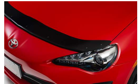
Hood Deflector $186.00

Engineered by TRD to enhance the vehicle's handling characteristics, the sway bars provide a flatter, more stable cornering stance, reducing front wheel slip and limiting body roll without adding harshness to the ride. Constructed of high-quality alloy steel, the sway bars feature a gloss red powder coat finish that resists corrosion and protects against road damage, while providing a striking visual enhancement to the underbody of the vehicle.