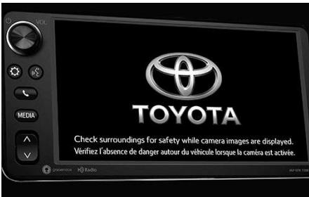
Premium Display Audio with Navigation $1,183.00

Guard your vehicle from weathering, UV radiation and road debris that can chip and scratch the finish with 3M Pro Series Genuine Toyota Paint Protection Film. This durable and nearly invisible thermoplastic urethane is designed to protect the hood and front fenders to maintain a like-new appearance. Backed by a 10 year limited warranty.