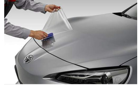
Pro Series Paint Protection Film $430.00

Protection for a long-lasting cargo area. This durable, long-lasting custom designed vinyl liner features a raised lip to contain spills for simple cleanup. Textured finish minimizes load shifting and the cargo area carpeting gets extra protection for wear and tear. The easy-to-install liner is equally simple to remove for cleaning. It's the ideal place for storing wet and dirty cargo. Consider it the ultimate way to protect the vehicle interior from scratches and spills.