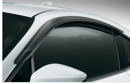
Side Window Deflectors $187.50

Prevent scrapes and scratches from daily vehicle use with Toyota's Rear Bumper Appliqué. It is specifically designed to maintain your vehicle's flawless bumper surface. This durable, clear and UV-resistant protection film is custom fitted to your vehicle and is stylishly outfitted with the Toyota logo. It's the stain, chemical and fuel resistant barrier your paint has been waiting for.