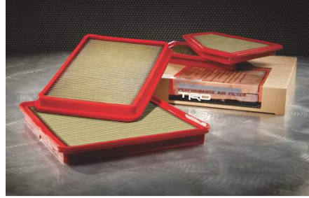
TRD Air Filter $111.50

This custom-designed Block Heater not only warms your vehicle up quicker, but also reduces engine strain and wear. The system also helps to save fuel and battery power during startups, and the strain relief electrical cord reduces cord damage.