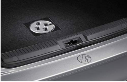
Rear Bumper Appliqué $106.50

Prevent scrapes and scratches from daily vehicle use with Toyota's Rear Bumper Appliqué. It is specifically designed to maintain your vehicle's flawless bumper surface. This durable, clear and UV-resistant protection film is custom fitted to your vehicle and is stylishly outfitted with the Toyota logo. It's the stain, chemical and fuel resistant barrier your paint has been waiting for.