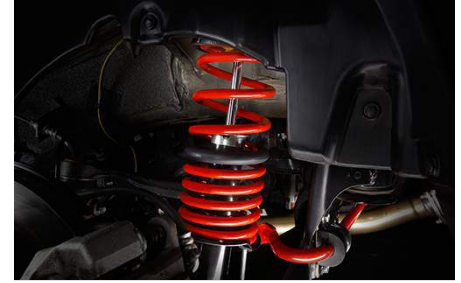
TRD Lowering Springs $1,077.50

Made from thick high-grade tinted acrylic, the Hood Deflector offers high impact resistance and reduces the potential damage to your hood from road debris. The stylish wraparound design complements the vehicle's appearance while providing extra side protection.