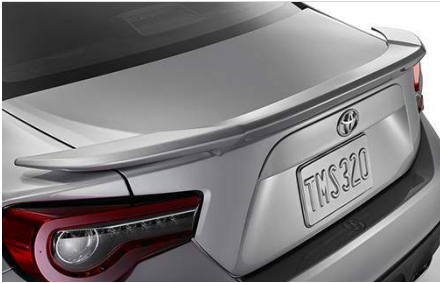
Rear Spoiler $599.00

Manufactured from high-quality, lightweight materials, the 86 rear spoiler features precisely sculpted detail to add a sporty, integrated appearance to the vehicle. Paint color is matched to the vehicle's color palette and paint quality meets factory specifications for appearance and performance.