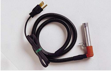
Block Heater $485.00

This custom-designed Block Heater not only warms your vehicle up quicker, but also reduces engine strain and wear. The system also helps to save fuel and battery power during startups, and the strain relief electrical cord reduces cord damage.