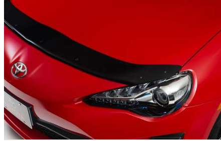
Hood Deflector $186.00

Engineered by TRD to enhance the vehicle's handling characteristics, the sway bars provide a flatter, more stable cornering stance, reducing front wheel slip and limiting body roll without adding harshness to the ride. Constructed of high-quality alloy steel, the sway bars feature a gloss red powder coat finish that resists corrosion and protects against road damage, while providing a striking visual enhancement to the underbody of the vehicle.