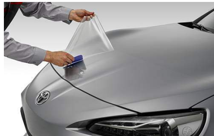
Pro Series Paint Protection Film $430.00

•Enhances style and functionality of the vehicle •Seamless integration of fog lamps into bumper •Helps provide visibility in severe inclement weather conditions and night driving •Designed to complement the vehicle's exterior lines •Helps provide added measure of security •Wide-angle high intensity LED lights