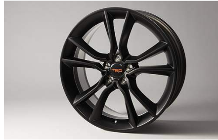
TRD 18" Alloy Wheel (Staggered Fitment)

Manufactured from high-quality, lightweight materials, the 86 rear spoiler features precisely sculpted detail to add a sporty, integrated appearance to the vehicle. Paint color is matched to the vehicle's color palette and paint quality meets factory specifications for appearance and performance.