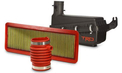
TRD Performance Air Intake $576.50

Pre-oiled and ready to install. Washable and reusable. This exact drop-in replacement filter will last the life of the vehicle, provide unrivalled engine protection and increase air flow.