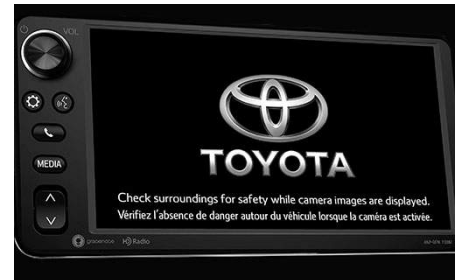
Premium Display Audio with Navigation $1,183.00

Guard your vehicle from weathering, UV radiation and road debris that can chip and scratch the finish with 3M Pro Series Genuine Toyota Paint Protection Film. This durable and nearly invisible thermoplastic urethane is designed to protect the hood and front fenders to maintain a like-new appearance. Backed by a 10 year limited warranty.