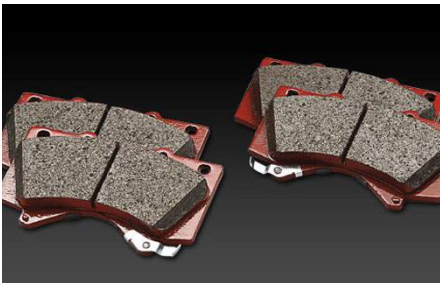
TRD Performance Brake Pads - Rear $182.00

TRD lowering springs lower the 86's centre of gravity by approximately 1" (1 1/8-in.) front and rear, enhancing the vehicle's on-road performance through quicker turn-in, enhanced steering response and improved cornering ability. Featuring TRD-developed proprietary spring rates (linear in front, progressive in rear) and designed to work with stock struts and shock absorbers. Installation includes wheel alignment.