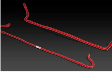
TRD Sway Bars $934.50

Engineered by TRD to enhance the vehicle's handling characteristics, the sway bars provide a flatter, more stable cornering stance, reducing front wheel slip and limiting body roll without adding harshness to the ride. Constructed of high-quality alloy steel, the sway bars feature a gloss red powder coat finish that resists corrosion and protects against road damage, while providing a striking visual enhancement to the underbody of the vehicle.