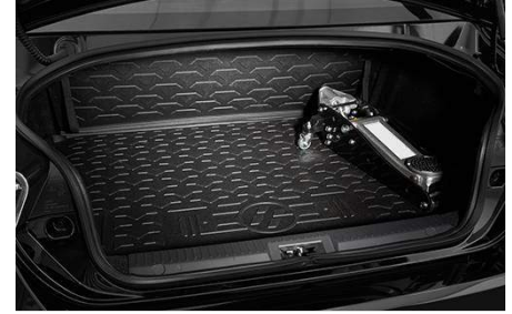
Cargo Liner $150.50

The Toyota Genuine Side Window Deflectors are aerodynamically shaped to minimize wind noise and buffering when driving with open windows. The deflectors are designed to integrate flawlessly with your vehicle, while maintaining its sleek look. Breathe in the fresh air without having to worry about wind, rain or the cold Canadian snow.