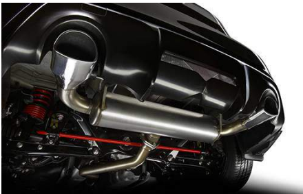
TRD Exhaust System $1,526.50

Like a living thing, an engine needs to breathe. Increase the quality of air that flows to your powerplant and quantifiably increase its performance with the TRD Performance Air Intake. Features reusable TRD high-flow air filter Dyno-tested to deliver an increase in both horsepower and torque for improved acceleration. Designed to work with the factory ECU and emissions system. Tested according to TRD's stringent performance standards.