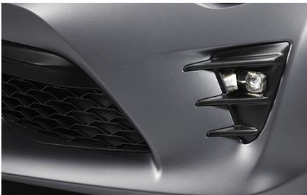
LED Fog Light Kit $660.00

Protection for a long-lasting cargo area. This durable, long-lasting custom designed vinyl liner features a raised lip to contain spills for simple cleanup. Textured finish minimizes load shifting and the cargo area carpeting gets extra protection for wear and tear. The easy-to-install liner is equally simple to remove for cleaning. It's the ideal place for storing wet and dirty cargo. Consider it the ultimate way to protect the vehicle interior from scratches and spills.