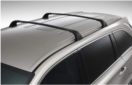
Cross Bars $386.77

The Cross Bars are engineered specifically to integrate with Highlander and Highlander Hybrid's factory roof channels, enhancing the vehicle's utility and cargo management versatility. The Cross Bars provide you with additional cargo space and can support a maximum load of 75 kg (165 lbs) when evenly distributed across both bars.