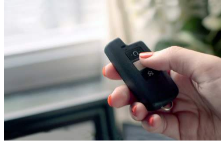
START+ Long Range Remote Engine Starter $947.03

The Towing Hitch system is specifically designed and manufactured for Highlander and Highlander Hybrid models, and has been engineered to obtain the vehicle's safest maximum tow rating. The included Towing Hitch Wire Harness with 4 pin flat connector seamlessly integrates with Highlander and Highlander Hybrid's electrical system. All Toyota Genuine Hitch systems are e-coated and powder coated to prevent rust and corrosion and they are designed to meet or exceed all industry towing standards.