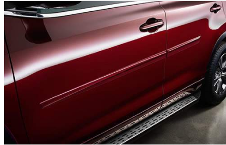
Body Side Moulding $298.77

The Cross Bars are engineered specifically to integrate with Highlander and Highlander Hybrid's factory roof channels, enhancing the vehicle's utility and cargo management versatility. The Cross Bars provide you with additional cargo space and can support a maximum load of 75 kg (165 lbs) when evenly distributed across both bars.