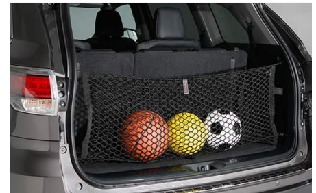
Cargo Net $74.35

The Toyota Genuine Dash Camera is designed to provide a safe and memorable driving experience in your Toyota vehicle. Safely record the on-goings of the open road while keeping your eyes on the road. Never miss a moment in motion; capture it! The Toyota Genuine Dash Camera will also allow you to record the surroundings of your vehicle while it is parked