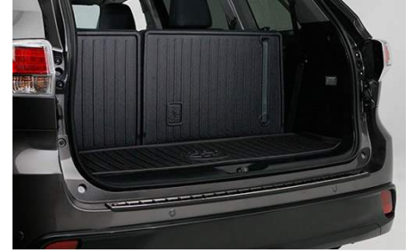
Cargo Liner $142.35

The Towing Hitch Ball is designed and tested to meet Highlander and Highlander Hybrid's towing specifications and quality standards. It works seamlessly with the accessory Towing Hitch.