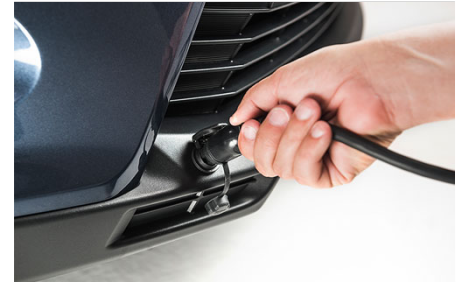
Premium Plug-In Block Heater $455.31

Body Side Mouldings protect Highlander or Highlander Hybrid from dings and bumps, while adding a touch of elegance to the vehicle's exterior. Constructed from highly durable material that has undergone Toyota's rigorous product testing, the Body Side Mouldings offer long-lasting protection from any type of minor incidental contact to the sides of the vehicle.