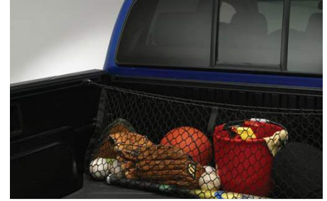
Cargo Net $57.35

Hear your engine roar with style. The TRD exhaust gives your engine greater power while bellowing out a deep, throaty tone -Made from premium stainless steel and features a cat-back exhaust design with dual TRD logo etched on polished tips -Engineered for a less restrictive path, to help reduce backpressure for added low- to midrange torque, along with improved horsepower -Produces a deep, throaty, award-winning exhaust note while meeting the legal 95-decibel noise limit, as required by law