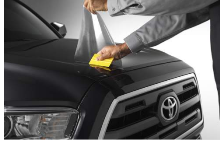
Pro Series Paint Protection Film $448.54

Pre-oiled and ready to install. Washable and reusable. This exact drop-in replacement filter will last the life of the vehicle, provide unrivalled engine protection and increase air flow.