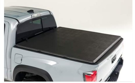
Soft Tri-Fold Tonneau Cover $786.77

Guard your Tacoma from weathering, UV radiation and road debris that can chip and scratch the finish with 3M Pro Series Genuine Toyota Paint Protection Film. This durable and nearly invisible thermoplastic urethane is designed to protect the hood and front fenders to maintain a like-new appearance.