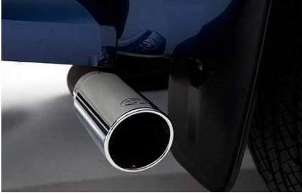
Exhaust Tip $107.21

Add to your Tacoma's bold style with these shiny exhaust tips. Built Toyota-tough, they're constructed from polished, corrosion resistant double-walled 304 stainless steel. Plus, they're easy to install – no cutting, drilling or welding! Features a finely etched Toyota logo.