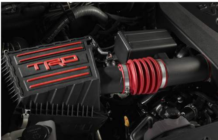
TRD Performance Air Intake System $763.12

• Individual letters fit in the stamped tailgate "Tacoma" logo • Easily attaches with strong adhesive • Two colors available: bright chrome and flat black