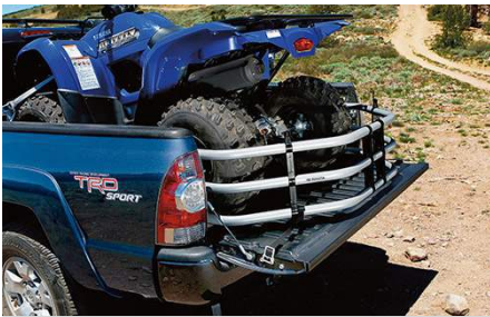
Bed Extender $389.06

Add to your Tacoma's bold style with these shiny exhaust tips. Built Toyota-tough, they're constructed from polished, corrosion resistant double-walled 304 stainless steel. Plus, they're easy to install – no cutting, drilling or welding! Features a finely etched Toyota logo.