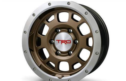
TRD 16" Off-Road Beadlock-Style Alloy Wheels - Bronze $1,816.50

Feed your engine some cooler air with the TRD Cold Air Intake! • System intake is located in the passenger side front fender well to supply engine with cooler, denser air rather than hot air from the engine compartment • Designed to work with factory ECU and emissions system • Features washable and reusable TRD high-flow air filter • Maintains high Toyota quality standards for durability and strength