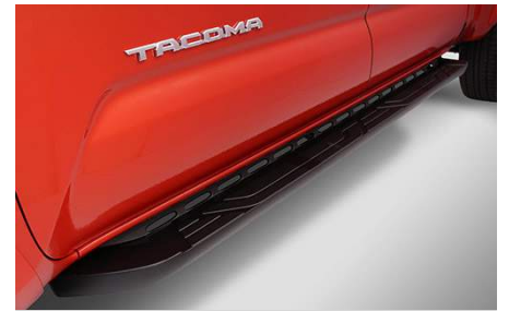
Running Boards $488.56

Versatile tri-fold design to suit all kinds of cargo needs. - The hard tri-fold tonneau cover adds extra security with five rotary latches, so you can rest assured that your cargo is protected. - This hard tri-fold tonneau cover is weather-resistant and can fold to the cab for bed access - Meets Toyota's high quality standard