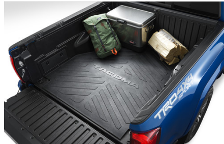
Bed Mat $156.35

Designed to offer an extra measure of cargo carrying capacity, these truck bed D-rings help provide a secure method of tying down equipment and gear in the Tacoma bed. Sturdy construction and pivoting capability allow for multiple positions and use. (Max capacity per ring is 199.6 kgs).