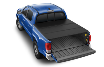
Hard Tri-Fold Tonneau Cover $1,524.12

Create some additional space in your Tacoma's bed with the Bed Extender. It extends over the tailgate, creating even more space in Tacoma's bed for carrying your items. The Extender can also be rotated inward, providing an enclosed cargo area to secure smaller items with the tailgate closed. Made to last with lightweight, high-strength aluminum.