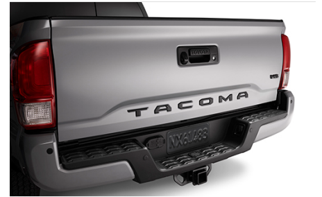
Black Tailgate Insert Badge $96.03

Enhance your connection to your Tacoma every time you shift with the TRD Shift Knob. Delivers an enhanced shifting feel while providing an impressive addition to your interior