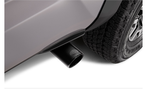
Exhaust Tip - Black Chrome $134.71

Secure your spare tire with a precision machined lock constructed of hardened steel with zinc-nickel plating. It quickly attaches to the spare's crank-down tool receiver mechanism, and the key attaches to the crank-down tool in the vehicle's tool kit.