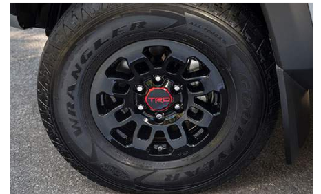
16" TRD Alloy Wheel - Black $1,553.66

These durable TRD 16-inch off-road beadlock wheels offer owners a distinctive and rugged upgrade to their stock wheels. Constructed of low-pressure alloy, the wheels provide a higher strength-to-weight ratio for optimal performance. They feature a bronze painted finish and machined outer lip with beadlock styling. TRD embossed snap-in center cap included.