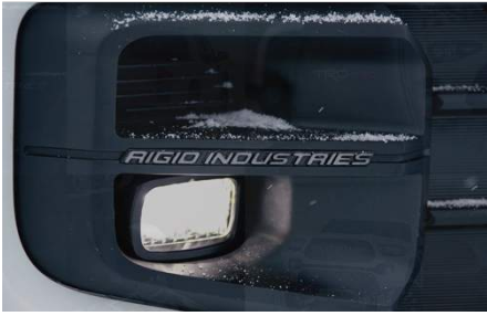
TRD LED Fog Lights $702.16

Engineered by TRD, these intense LED fog lights pack a lot of brightness into a compact package. Aluminum housings feature the Rigid Industries® logo, and rugged construction helps ensure that these lights can endure harsher environments. With their wide-angle beam pattern, these lights help ensure you have light when, and where, you need it.