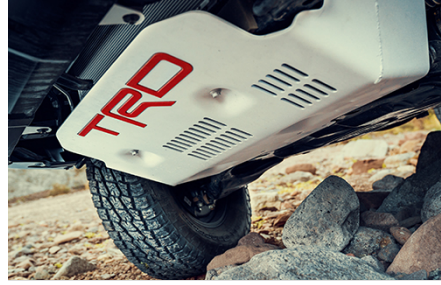
TRD Front Skid Plate $664.42

A rugged good look. The dual step pads not only help passengers get into a vehicle but also give the vehicle a rugged look. Available in Aluminium, these wedge step bars are custom fitted and designed for your vehicle. Plus, the steps are easy to install since no drilling is required.