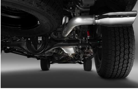
TRD Performance Exhaust System $1,341.48

Hear your engine roar - enhance both the presence and appearance of your truck with the TRD Exhaust! • Produces a deep, throaty exhaust note • Features stainless steel TRD logo-etched tip • Engineered to allow the engine to breathe easier and reduce the amount of back pressure in the system • Maintains high Toyota quality standards for durability and strength