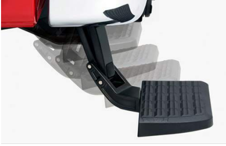
Rear Bumper Step $351.06

Make the access to your Tacoma a little simpler by installing the Tacoma Bed Step. Made from high quality aluminium, this step has a 136 kg (300 lbs.) load rating, bolts directly on (no drilling required) and tucks up out of sight when not in use.