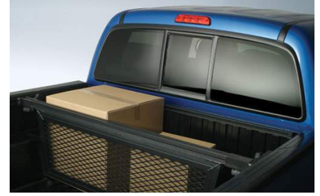
Bed Divider $469.71

5-in. oval tube steps provide dual-molded and skid-resistant heavy-duty step pads on both sides of the vehicle •Step pads help to channel water off the tube •Durable, lightweight aluminum construction is chip and rust resistant •Features chrome plated or black powder-coat finish for protection against the elements •Meets all Toyota-required load, cyclic and durability testing •Custom engineered for specific mounting locations provided on the vehicle, allowing for a strong mount with a quick and easy secure installation •Simple, no-drill installation