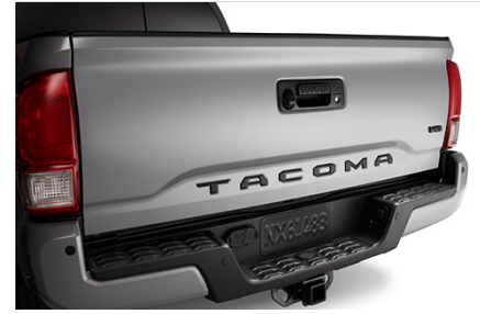
Chrome Tailgate Insert Badge $96.03

This custom-designed Block Heater not only warms your vehicle up quicker, but also reduces engine strain and wear. The system also helps to save fuel and battery power during startups, and the strain relief electrical cord reduces cord damage.