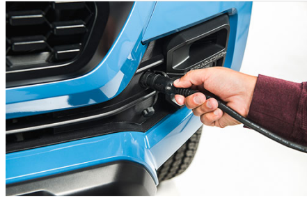
Premium Plug-In Block Heater $455.31

Engineered by TRD, these intense LED fog lights pack a lot of brightness into a compact package. Aluminum housings feature the Rigid Industries® logo, and rugged construction helps ensure that these lights can endure harsher environments. With their wide-angle beam pattern, these lights help ensure you have light when, and where, you need it.