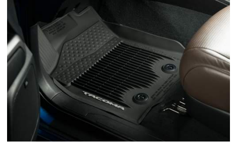
Tub Style All Season Floor Mats $167.35

Toyota START+ long range remote engine starter enables you to start your Toyota from 800 meters or 2,600 feet away (unobstructed). Toyota START+ activates your pre-set heating and air conditioning system, as well as your front and rear defoggers. Non-Genuine remote engine starters and any damages or failures resulting from installation and use, are not covered by any Toyota warranty. Only the Genuine Toyota START+, is covered by Toyota warranty. All Non-Genuine remote engine starter installation is hostile and requires cutting, splicing and soldering of wires and/or require an additional immobilizer bypass device. All features may not be applicable to all vehicle models.