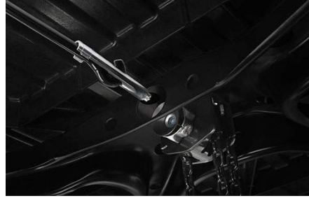
Spare Tire Lock $102.06

Add to your Tacoma's bold style with these shiny exhaust tips. Built Toyota-tough, they're constructed from polished, corrosion resistant double-walled 304 stainless steel. Plus, they're easy to install – no cutting, drilling or welding! Features a finely etched Toyota logo.