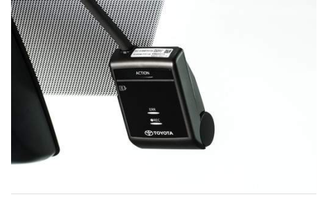
Toyota Genuine Dash Camera $640.89

Help keep the underbelly of your Tacoma safe from vengeful boulders with the TRD front skid plate. -Enhances Tacoma's tough, capable stance -Helps protect vehicle underbody from damage that can result from flying stones, branches, ice chunks and other types of road debris - Made from stamped and formed 1/4-in.-thick silver powder-coated aluminum - Skid plate won't interfere with or block the cooling system, while providing cut outs for unobstructed access to all maintenance points and vehicle tow hooks -Rigorous CAD simulations conducted by Toyota engineers, in addition to real world testing, help to maximize protection and prevent vibration stress and noise issues -Easy, no-drill installation uses vehicle's existing attachment mounts