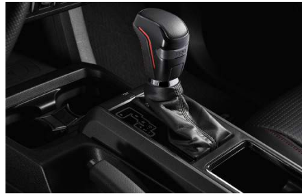
TRD Shift Knob $177.35

Toyota START+ long range remote engine starter enables you to start your Toyota from 800 meters or 2,600 feet away (unobstructed). Toyota START+ activates your pre-set heating and air conditioning system, as well as your front and rear defoggers. Non-Genuine remote engine starters and any damages or failures resulting from installation and use, are not covered by any Toyota warranty. Only the Genuine Toyota START+, is covered by Toyota warranty. All Non-Genuine remote engine starter installation is hostile and requires cutting, splicing and soldering of wires and/or require an additional immobilizer bypass device. All features may not be applicable to all vehicle models.