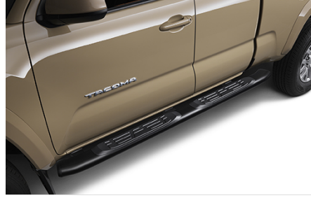
5-in. Oval Tube Steps - Black $821.50

Optional 5.0m Home Power Cable. This cable can be purchased instead of or in addition to the standard 2.5m Home Power Cable (PK5A4-89J40)