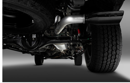
TRD Performance Exhaust with Black Chrome Exhaust Tip $1,601.48

Hear your engine roar - enhance both the presence and appearance of your truck with the TRD Exhaust! • Produces a deep, throaty exhaust note • Features stainless steel TRD logo-etched tip • Engineered to allow the engine to breathe easier and reduce the amount of back pressure in the system • Maintains high Toyota quality standards for durability and strength