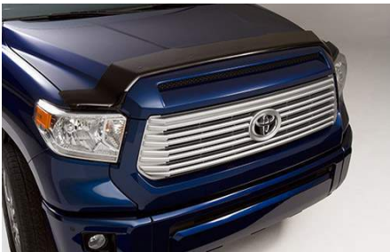
Hood Deflector $236.77

Protect your Tundra's bed when you need it. Custom designed for an exact fit, the Bed Mat protects against scratches, spills, and damage. Made from thick cord-reinforced, synthetic rubber for durability, the Bed Mat is resistant to cracking and breaking while providing airflow and drainage to keep the Tundra's bed dry. The anti-slip design also prevents items from sliding around in the bed area.