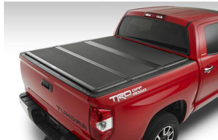
Hard Tri-Fold Tonneau Cover $1,373.54

Guard your vehicle from weathering, UV radiation and road debris that can chip and scratch the finish with 3M Pro Series Genuine Toyota Paint Protection Film. This durable and nearly invisible thermoplastic urethane is designed to protect the hood and front fenders to maintain a like-new appearance.