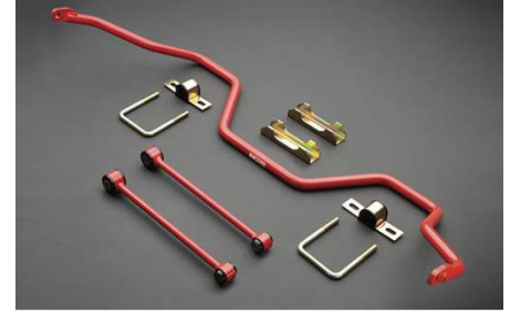
TRD Rear Sway Bar $529.12

• Individual letters fit in the stamped tailgate Tundra logo • Attached with strong 3M adhesive backing • Two colors available: bright chrome and flat black