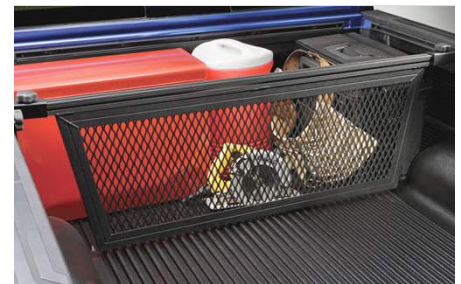
Bed Divider $379.71

•Individual letters fit in the stamped tailgate Tundra logo •Attached with strong 3M adhesive backing •Two colors available: bright chrome and flat black