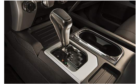
TRD Shift Knob $192.35

Enhances Tundra's tough, capable stance and helps protect vehicle underbody from damage that can result from flying stones, salt, branches, ice chunks, and other types of road debris. Made from stamped and formed 1/4-in.-thick silver powder-coated aluminum.