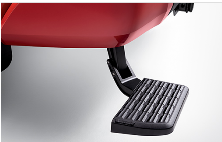
Rear Bumper Step $471.48

Create some additional space in your Tundra's bed with the Bed Extender. It extends over the tailgate, creating even more space in Tundra's bed for carrying your items. The Extender can also be rotated inward, providing an enclosed cargo area to secure smaller items with the tailgate closed. Made to last with lightweight, high-strength aluminum.