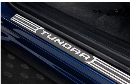
Door Sill Protectors $301.42

The Door Sill Protectors help guard against scuffs and scratches. Not only are they functional, but they also provide a styling accent that is immediately noticed when entering the vehicle. Kit of 4 (front and rear).