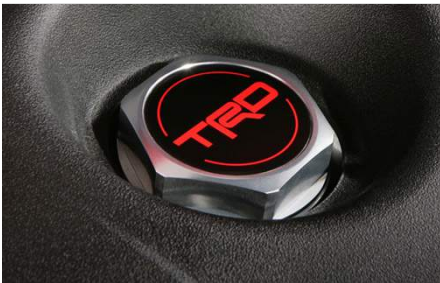
TRD Forged Aluminum Oil Cap $87.35

Enhance your connection to your Tundra every time you shift with the TRD Shift Knob. Delivers an enhanced shifting feel while providing an impressive addition to your interior.