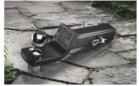
Towing Hitch Ball - 2 5/16" - 14,000 lbs $59.35

The Towing Hitch Ball is designed and tested to meet your vehicle's towing specifications and quality standards.