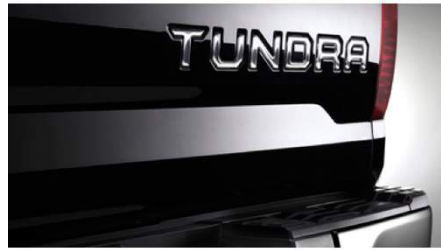
Chrome Tailgate Insert Badge $122.06

Hear your engine roar - enhance both the presence and appearance of your truck with the TRD Dual Exhaust! • Produces a deep, throaty exhaust note • Features dual stainless steel TRD logo-etched tips • Engineered to allow the engine to breathe easier and reduce the amount of back pressure in the system • Maintains high Toyota quality standards for durability and strength