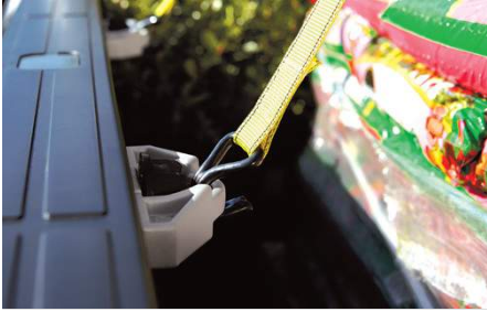
Bed Cleat $71.35

Add functionality with additional Bed Cleats. Designed specifically for the Tundra Bed Rails, they are constructed of sturdy die-cast aluminum, each fully adjustable Bed Cleat is rated for a maximum load of 220 lb. Sold individually.