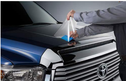
Pro Series Paint Protection Film $448.54

This TRD sway bar enhances the vehicle's handling characteristics, and provides a more stable cornering stance. It features a gloss red powder coat finish that resists corrosion and protects against road damage, while providing a striking visual enhancement.