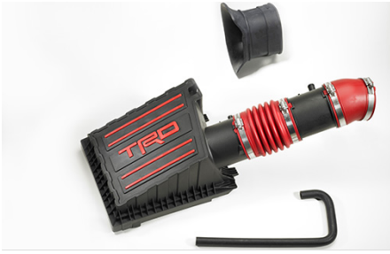
TRD Performance Air Intake System $611.77

Feed your engine some cooler air with the TRD Cold Air Intake! • Designed to work with factory ECU and emissions system • Features washable and reusable TRD high-flow air filter • Maintains high Toyota quality standards for durability and strength