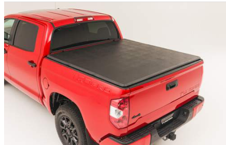
Soft Tri-Fold Tonneau Cover $836.77

Manufactured from forged, highly polished billet aluminum, the TRD Oil Cap features a red on black TRD logo to customize the engine compartment with a high-tech, race-inspired appearance. It's finished with a high-luster coating to maintain its appearance for years to come.