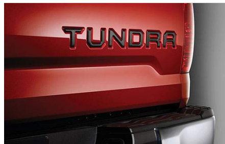
Black Tailgate Insert Badge $122.06

Provides a convenient, secure stepping platform that makes it easy to get in and out of the truck bed. •Works with tailgate up or down •Hands-free operation allows users to raise or lower the step by nudging with their foot •Stores discreetly under rear bumper •Lightweight, high-strength aluminum die-cast construction features a glass-reinforced nylon step pad with ribbed, nonskid stepping surface •300-lb. load capacity •Weather-resistant black anodized and Teflon® powder-coat finish for long-term durability •Quick and simple no-drill, bolt-on installation