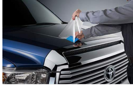
Pro Series Paint Protection Film $448.54

This custom-designed Block Heater not only warms your vehicle up quicker, but also reduces engine strain and wear. The system also helps to save fuel and battery power during startups, and the strain relief electrical cord reduces cord damage.