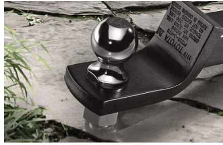
Towing Hitch Ball - 2" - 6,000 lbs $34.35

Feed your engine some cooler air with the TRD Cold Air Intake! • Designed to work with factory ECU and emissions system • Features washable and reusable TRD high-flow air filter • Maintains high Toyota quality standards for durability and strength