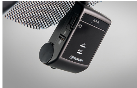
Toyota Genuine Dash Camera $696.43

Made from thick high-grade tinted acrylic, the Hood Deflector offers high impact resistance and reduces the potential damage to your hood from road debris. The stylish wraparound design complements the vehicle's appearance while providing extra side protection.