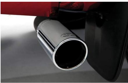
Stainless Steel Exhaust Tip $109.71

The Towing Hitch Ball is designed and tested to meet your Tundra's towing specification and quality standards.