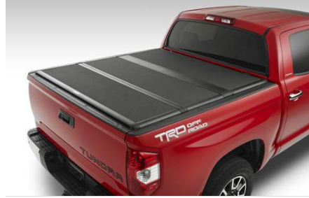
Hard Tri-Fold Tonneau Cover $1,373.54

Guard your vehicle from weathering, UV radiation and road debris that can chip and scratch the finish with 3M Pro Series Genuine Toyota Paint Protection Film. This durable and nearly invisible thermoplastic urethane is designed to protect the hood and front fenders to maintain a like-new appearance.