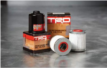
TRD Performance Oil Filter $106.77

Keep your oil pure as long as possible, and help enhance the life of your engine, with the TRD Oil Filter that kicks out impurities through a 100% synthetic fiber filtration medium.