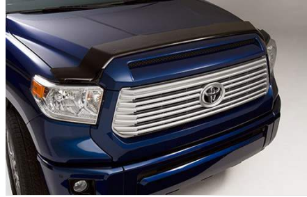
Hood Deflector $236.77

Protect your Tundra's bed when you need it. Custom designed for an exact fit, the Bed Mat protects against scratches, spills, and damage. Made from thick cord-reinforced, synthetic rubber for durability, the Bed Mat is resistant to cracking and breaking while providing airflow and drainage to keep the Tundra's bed dry. The anti-slip design also prevents items from sliding around in the bed area.