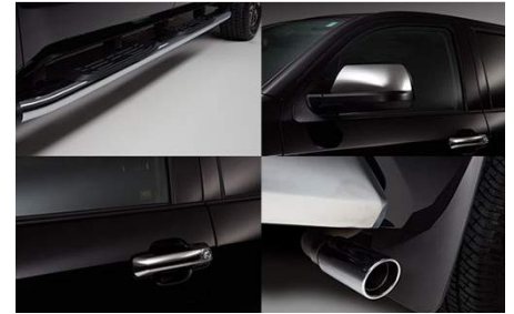
Chrome Accent Package $1,592.00

Enhances Tundra's tough, capable stance and helps protect vehicle underbody from damage that can result from flying stones, salt, branches, ice chunks, and other types of road debris. Made from stamped and formed 1/4-in.-thick silver powder-coated aluminum.