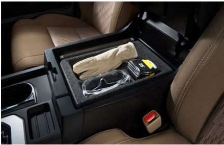
Centre Console Tray $156.77

The soft tri-fold tonneau cover gives your truck added versatility. Designed and engineered specifically for your Tundra, this low-profile soft tonneau cover is made from lightweight aluminum and the highest-grade vinyl in the industry. Backed by a factory 3-year/60,000km New Vehicle Limited Warranty, and can be incorporated into your vehicle payments.