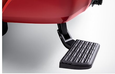
Rear Bumper Step $471.48

Create some additional space in your Tundra's bed with the Bed Extender. It extends over the tailgate, creating even more space in Tundra's bed for carrying your items. The Extender can also be rotated inward, providing an enclosed cargo area to secure smaller items with the tailgate closed. Made to last with lightweight, high-strength aluminum.