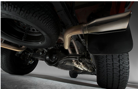
TRD Performance Dual Exhaust System - Black Tips $1,692.94

Keeps Tundra's bed looking new; the custom-fitted Bed Liner for Tundra not only protects against dents and scratches but also reduces mold and mildew by allowing drainage and increased airflow. The Liner, featuring a no-drill attachment system and made from high-density polyethylene copolymer, keeps loads from moving around in the bed. The Bed Liner also includes protection for the tailgate.