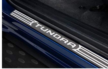
Door Sill Protectors $301.42

The Door Sill Protectors help guard against scuffs and scratches. Not only are they functional, but they also provide a styling accent that is immediately noticed when entering the vehicle. Kit of 4 (front and rear).