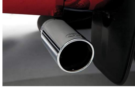
Stainless Steel Exhaust Tip $109.71

The Towing Hitch Ball is designed and tested to meet your Tundra's towing specification and quality standards.