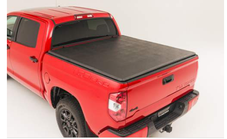
Soft Tri-Fold Tonneau Cover $836.77

Manufactured from forged, highly polished billet aluminum, the TRD Oil Cap features a red on black TRD logo to customize the engine compartment with a high-tech, race-inspired appearance. It's finished with a high-luster coating to maintain its appearance for years to come.