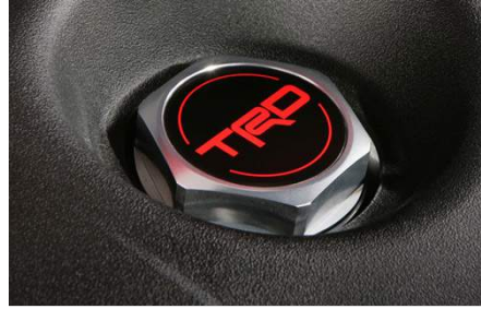
TRD Forged Aluminum Oil Cap $87.35

Enhance your connection to your Tundra every time you shift with the TRD Shift Knob. Delivers an enhanced shifting feel while providing an impressive addition to your interior.