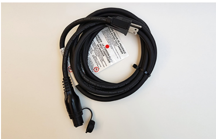
Premium Plug-In Block Heater - Optional 10m Home Power Cable $100.00

Optional 5.0m Home Power Cable. This cable can be purchased instead of or in addition to the standard 2.5m Home Power Cable (PK5A4-89J40)