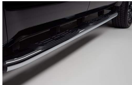
Side Step Bars - 5-inch Chrome $976.48

Hear your engine roar - enhance both the presence and appearance of your truck with the TRD Dual Exhaust! • Produces a deep, throaty exhaust note • Features dual stainless steel TRD logo-etched tips • Engineered to allow the engine to breathe easier and reduce the amount of back pressure in the system • Maintains high Toyota quality standards for durability and strength