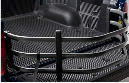
Bed Extender $514.77

Create some additional space in your Tundra's bed with the Bed Extender. It extends over the tailgate, creating even more space in Tundra's bed for carrying your items. The Extender can also be rotated inward, providing an enclosed cargo area to secure smaller items with the tailgate closed. Made to last with lightweight, high-strength aluminum.