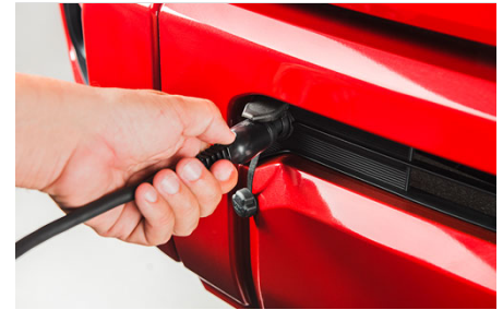
Premium Plug-In Block Heater $455.31

These Side Step Bars feature a corrosion-resistant aluminum construction, with a skid-resistant step pad to help ensure secure footing when entering your Tundra.