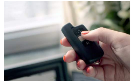
START+ Long Range Remote Engine Starter $1,085.86

Gain easy access into your Tundra while enhancing the exterior appearance. These durable and robust 5-inch Side Step Bars feature dual-moulded, skid-resistant step pads and come in a brilliant chrome finish. Not only does the chrome finish look great, it also provides protection against the elements.