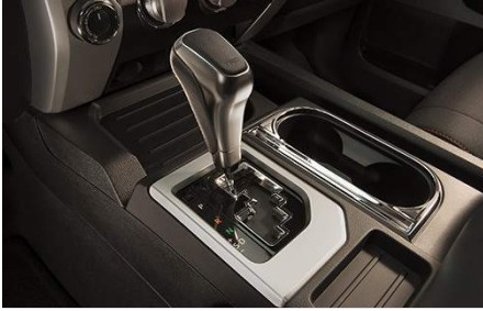
TRD Shift Knob $192.35

Enhance your connection to your Tundra every time you shift with the TRD Shift Knob. Delivers an enhanced shifting feel while providing an impressive addition to your interior.