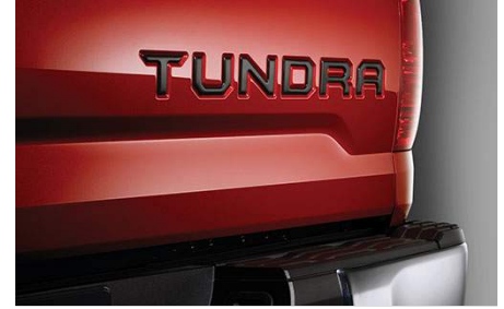
Black Tailgate Insert Badge $122.06

Provides a convenient, secure stepping platform that makes it easy to get in and out of the truck bed. •Works with tailgate up or down •Hands-free operation allows users to raise or lower the step by nudging with their foot •Stores discreetly under rear bumper •Lightweight, high-strength aluminum die-cast construction features a glass-reinforced nylon step pad with ribbed, nonskid stepping surface •300-lb. load capacity •Weather-resistant black anodized and Teflon® powder-coat finish for long-term durability •Quick and simple no-drill, bolt-on installation