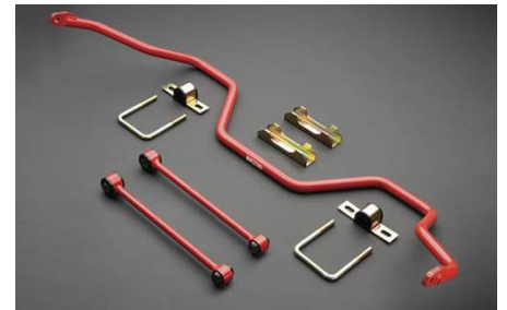
TRD Rear Sway Bar $529.12

Engineered by TRD to enhance the vehicle's handling characteristics, the sway bars provide a flatter, more stable cornering stance, reducing front wheel slip and limiting body roll without adding harshness to the ride. Constructed of high-quality alloy steel, the sway bars feature a gloss red powder coat finish that resists corrosion and protects against road damage, while providing a striking visual enhancement to the underbody of the vehicle.