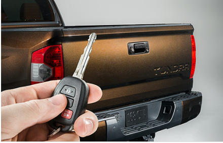
Power Tailgate Lock $423.54

Add even more convenience and security with the Power Tailgate Lock. This system locks and unlocks the vehicle's tailgate remotely using the original vehicle key fob.