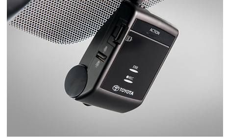
Toyota Genuine Dash Camera $696.43

Made from thick high-grade tinted acrylic, the Hood Deflector offers high impact resistance and reduces the potential damage to your hood from road debris. The stylish wraparound design complements the vehicle's appearance while providing extra side protection.