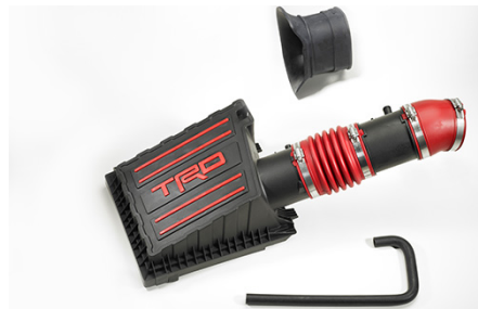
TRD Performance Air Intake System $611.77

Optional 10m Home Power Cable. This cable can be purchased instead of or in addition to the standard 2.5m Home Power Cable (PK5A4-89J40)