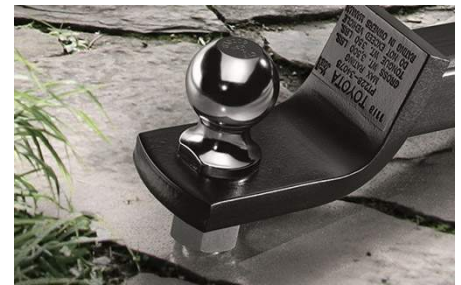
Towing Hitch Ball - 2" - 6,000 lbs $34.35

Feed your engine some cooler air with the TRD Cold Air Intake! • Designed to work with factory ECU and emissions system • Features washable and reusable TRD high-flow air filter • Maintains high Toyota quality standards for durability and strength