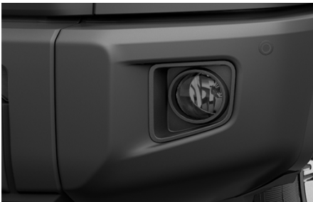
LED Fog Light Kit -Black $576.48

The Towing Mirrors help with visibility by being able to extend 4-in. to provide an even wider rear field of vision. They also feature integrated turn signals to help make your signaling more visible to other drivers.