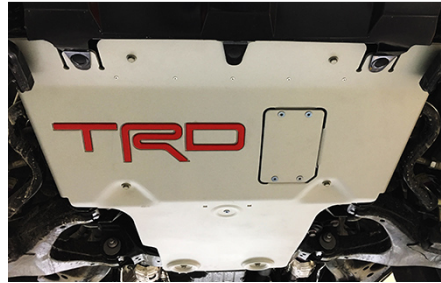
TRD Front Skid Plate $769.42

Keep your oil pure as long as possible, and help enhance the life of your engine, with the TRD Oil Filter that kicks out impurities through a 100% synthetic fiber filtration medium.