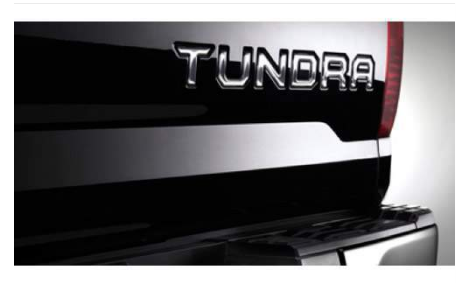
Chrome Tailgate Insert Badge $122.06

Hear your engine roar - enhance both the presence and appearance of your truck with the TRD Dual Exhaust! • Produces a deep, throaty exhaust note • Features dual stainless steel TRD logo-etched tips • Engineered to allow the engine to breathe easier and reduce the amount of back pressure in the system • Maintains high Toyota quality standards for durability and strength