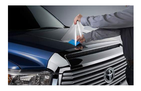
Pro Series Paint Protection Film $448.54

Made from thick high-grade tinted acrylic, the Hood Deflector offers high impact resistance and reduces the potential damage to your hood from road debris. The stylish wraparound design complements the vehicle's appearance while providing extra side protection.