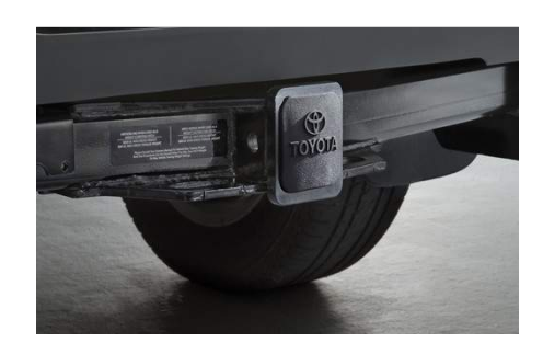
Towing Hitch with Connector (4.6L Models)

Add even more convenience and security with the Power Tailgate Lock. This system locks and unlocks the vehicle's tailgate remotely using the original vehicle key fob.