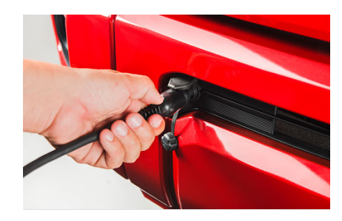
Premium Plug-In Block Heater $455.31

Gain easy access into your Tundra while enhancing the exterior appearance. These durable and robust 5-inch Side Step Bars feature dual-moulded, skid-resistant step pads and come in a brilliant chrome finish. Not only does the chrome finish look great, it also provides protection against the elements.