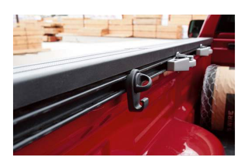
Bed Rail $354.12

Keeps Tundra's bed looking new; the custom-fitted Bed Liner for Tundra not only protects against dents and scratches but also reduces mold and mildew by allowing drainage and increased airflow. The Liner, featuring a no-drill attachment system and made from high-density polyethylene copolymer, keeps loads from moving around in the bed. The Bed Liner also includes protection for the tailgate.