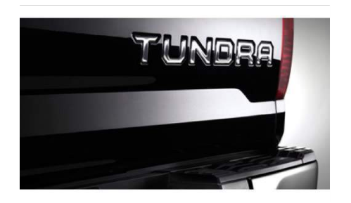
Chrome Tailgate Insert Badge $122.06

Hear your engine roar - enhance both the presence and appearance of your truck with the TRD Dual Exhaust! • Produces a deep, throaty exhaust note • Features dual stainless steel TRD logo-etched tips • Engineered to allow the engine to breathe easier and reduce the amount of back pressure in the system • Maintains high Toyota quality standards for durability and strength