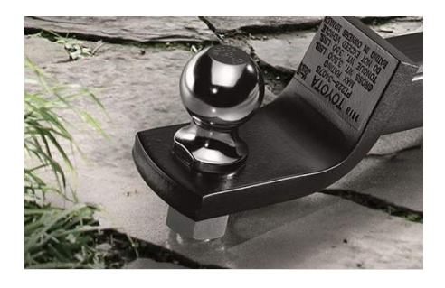
Towing Hitch Ball - 2" - 6,000 lbs $34.35

The Door Sill Protectors help guard against scuffs and scratches. Not only are they functional, but they also provide a styling accent that is immediately noticed when entering the vehicle. Kit of 2 (rear).