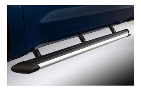
Side Step Bars - 4-inch Aluminum $693.54

Versatile tri-fold design to suit all kinds of cargo needs. - The hard tri-fold tonneau cover adds extra security with five rotary latches, so you can rest assured that your cargo is protected. - This hard tri-fold tonneau cover is weather-resistant and can fold to the cab for bed access - Meets Toyota's high quality standard