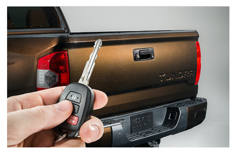
Power Tailgate Lock $423.54

•Individual letters fit in the stamped tailgate Tundra logo •Attached with strong 3M adhesive backing •Two colors available: bright chrome and flat black