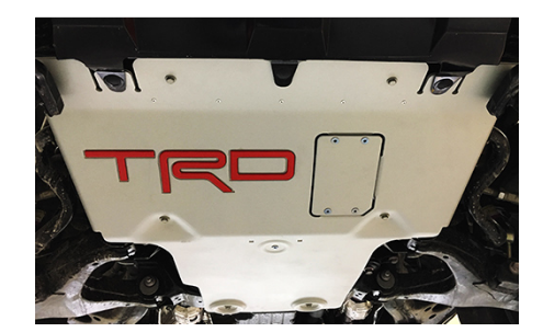
TRD Front Skid Plate $769.42

Keep your oil pure as long as possible, and help enhance the life of your engine, with the TRD Oil Filter that kicks out impurities through a 100% synthetic fiber filtration medium.