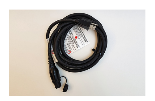
Premium Plug-In Block Heater -Optional 5.0m Home Power Cable $65.00

Toyota START+ long range remote engine starter enables you to start your Toyota from 800 meters or 2,600 feet away (unobstructed). Toyota START+ activates your pre-set heating and air conditioning system, as well as your front and rear defoggers. Non-Genuine remote engine starters and any damages or failures resulting from installation and use, are not covered by any Toyota warranty. Only the Genuine Toyota START+, is covered by Toyota warranty. All Non-Genuine remote engine starter installation is hostile and requires cutting, splicing and soldering of wires and/or require an additional immobilizer bypass device. All features may not be applicable to all vehicle models.