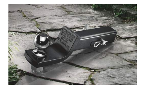
Towing Hitch Ball - 2 5/16" - 14,000 lbs $59.35

The Towing Hitch Ball is designed and tested to meet your vehicle's towing specifications and quality standards.