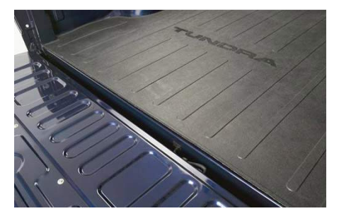
Bed Mat $196.35

Add to your Tundra's bold style with these shiny exhaust tips. Built Toyotatough, they're constructed from polished, corrosion resistant double-walled 304 stainless steel. Plus, they're easy to install – no cutting, drilling or welding! Features a finely etched Toyota logo.