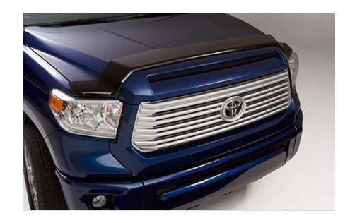
Hood Deflector $236.77

This custom-designed Block Heater not only warms your vehicle up quicker, but also reduces engine strain and wear. The system also helps to save fuel and battery power during startups, and the strain relief electrical cord reduces cord damage.