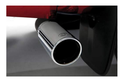
Stainless Steel Exhaust Tip

Add to your Tundra's bold style with these shiny exhaust tips. Built Toyotatough, they're constructed from polished, corrosion resistant double-walled 304 stainless steel. Plus, they're easy to install – no cutting, drilling or welding! Features a finely etched Toyota logo.