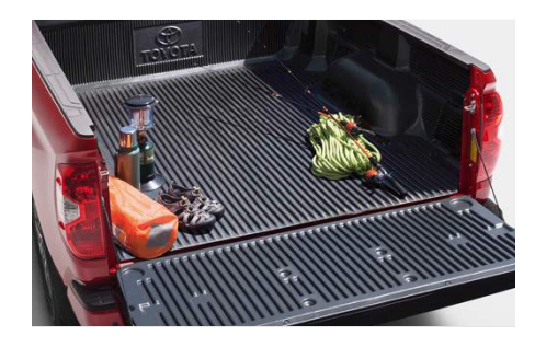
Bed Liner (Incompatible with Bed Rails) $563.83

Guard your vehicle from weathering, UV radiation and road debris that can chip and scratch the finish with 3M Pro Series Genuine Toyota Paint Protection Film. This durable and nearly invisible thermoplastic urethane is designed to protect the hood and front fenders to maintain a like-new appearance.