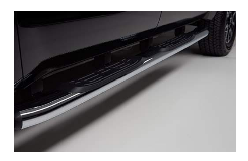
Side Step Bars - 5-inch Chrome $961.48

Gain easy access into your Tundra while enhancing the exterior appearance. These durable and robust 5-inch Side Step Bars feature dual-moulded, skid-resistant step pads and come in a brilliant chrome finish. Not only does the chrome finish look great, it also provides protection against the elements.