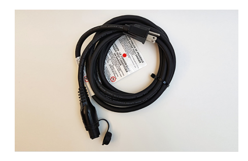
Premium Plug-In Block Heater -Optional 10m Home Power Cable $100.00

The Door Sill Protectors help guard against scuffs and scratches. Not only are they functional, but they also provide a styling accent that is immediately noticed when entering the vehicle. Kit of 2 (front)