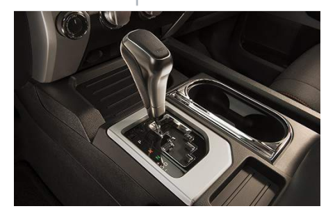
TRD Shift Knob

Enhance your connection to your Tundra every time you shift with the TRD Shift Knob. Delivers an enhanced shifting feel while providing an impressive addition to your interior.