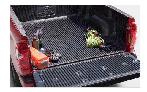
Bed Liner (Accomodates bed rails) $813.83

Hear your engine roar - enhance both the presence and appearance of your truck with the TRD Dual Exhaust! • Produces a deep, throaty exhaust note • Features dual stainless steel TRD logo-etched tips • Engineered to allow the engine to breathe easier and reduce the amount of back pressure in the system • Maintains high Toyota quality standards for durability and strength