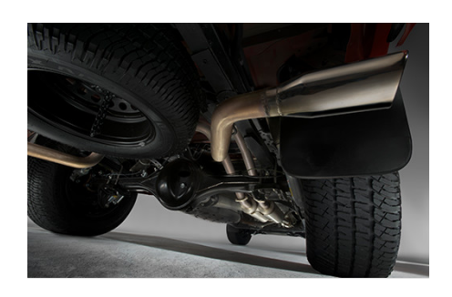
TRD Performance Dual Exhaust System - Black Tips $1.692.94

Hear your engine roar - enhance both the presence and appearance of your truck with the TRD Dual Exhaust! • Produces a deep, throaty exhaust note • Features dual stainless steel TRD logo-etched tips • Engineered to allow the engine to breathe easier and reduce the amount of back pressure in the system • Maintains high Toyota quality standards for durability and strength