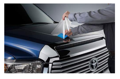
Pro Series Paint Protection Film $448.54

Gain easy access into your Tundra while enhancing the exterior appearance. These Side Step Bars feature a corrosion-resistant aluminum construction, with a skid-resistant step pad to help ensure secure footing when entering your Tundra.