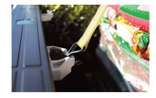
Bed Cleat $71.35

Not only do the Running Boards assist with entering your Tundra, they also help protect the lower body from road debris. Constructed from highly durable aluminum for corrosion-resistance, they feature a wide-step surface with rubber grommets to help ensure a secure footing. Engineered to mount securely to the Tundra's sides using existing mounting points.