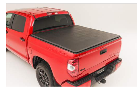
Soft Tri-Fold Tonneau Cover $836.77

A convenient storage tray, customdesigned for your Tundra's center console area. Three distinct compartments provide areas for coins or small objects, phones, tablets, and tools. The console also features railings to accommodate letter-size hanging file folders