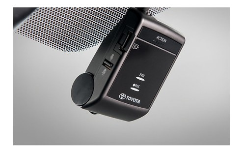
Toyota Genuine Dash Camera $696.43

Keeps Tundra's bed looking new; the custom-fitted Bed Liner for Tundra not only protects against dents and scratches but also reduces mold and mildew by allowing drainage and increased airflow. The Liner, featuring a no-drill attachment system and made from high-density polyethylene copolymer, keeps loads from moving around in the bed. The Bed Liner also includes protection for the tailgate.