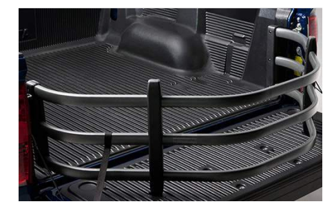
Bed Extender $514.77

Protect your Tundra's bed when you need it. Custom designed for an exact fit, the Bed Mat protects against scratches, spills, and damage. Made from thick cord-reinforced, synthetic rubber for durability, the Bed Mat is resistant to cracking and breaking while providing airflow and drainage to keep the Tundra's bed dry. The anti-slip design also prevents items from sliding around in the bed area.