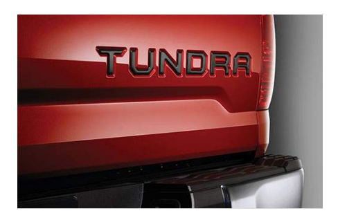
Black Tailgate Insert Badge

The Bed Divider allows you to create a separated partition in your Tundra's bed space, to help keep items from sliding around. The Bed Divider is engineered to work with Tundra's Bed Rails (standard or add-on accessory) and is rated for a 400-lb load capacity. Please note, the Bed Divider accessory cannot be installed in conjunction with the Hard Tri-Fold Tonneau Cover accessory.