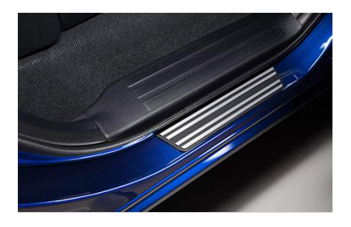
Rear Door Sill Protectors $129.71

The Door Sill Protectors help guard against scuffs and scratches. Not only are they functional, but they also provide a styling accent that is immediately noticed when entering the vehicle. Kit of 4 (front and rear).