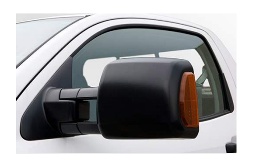
Towing Mirrors - Left Side $383.54

The Towing Mirrors help with visibility by being able to extend 4-in. to provide an even wider rear field of vision. They also feature integrated turn signals to help make your signaling more visible to other drivers.