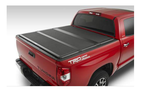
Hard Tri-Fold Tonneau Cover $1,623.54

The Towing Mirrors help with visibility by being able to extend 4-in. to provide an even wider rear field of vision. They also feature integrated turn signals to help make your signaling more visible to other drivers.