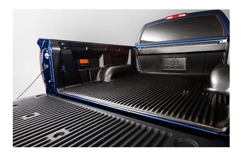
Bed Liner (Accomodates bed rails) $563.83

Guard your vehicle from weathering, UV radiation and road debris that can chip and scratch the finish with 3M Pro Series Genuine Toyota Paint Protection Film. This durable and nearly invisible thermoplastic urethane is designed to protect the hood and front fenders to maintain a like-new appearance.