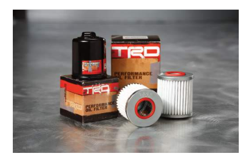
TRD Performance Oil Filter $106.77

Keep your oil pure as long as possible, and help enhance the life of your engine, with the TRD Oil Filter that kicks out impurities through a 100% synthetic fiber filtration medium.