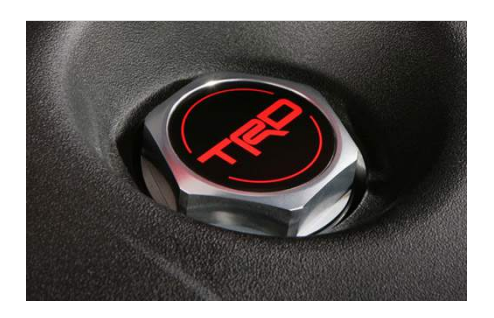
TRD Forged Aluminum Oil Cap

Enhance your connection to your Tundra every time you shift with the TRD Shift Knob. Delivers an enhanced shifting feel while providing an impressive addition to your interior.