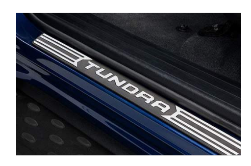
Front Door Sill Protectors $150.71

The Door Sill Protectors help guard against scuffs and scratches. Not only are they functional, but they also provide a styling accent that is immediately noticed when entering the vehicle. Kit of 2 (front)