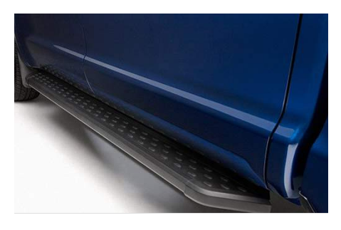
Running Board Kit $838.54

Not only do the Running Boards assist with entering your Tundra, they also help protect the lower body from road debris. Constructed from highly durable aluminum for corrosion-resistance, they feature a wide-step surface with rubber grommets to help ensure a secure footing. Engineered to mount securely to the Tundra's sides using existing mounting points.