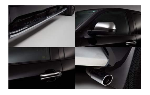
Chrome Accent Package $1,373,00

Add even more versatility to your Tundra with the Bed Rail system. Galvanized steel construction provides superior strength while black powder coating resists corrosion. The kit includes four die-cast aluminum tie-down Bed Cleats, which are rated for loads up to 880 lb. (220 lb. each). The Bed Rails also allow you to add additional accessories to the Tundra's bed, such as the Bed Divider.