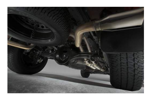
TRD Performance Dual Exhaust System $1.572.24

•Individual letters fit in the stamped tailgate Tundra logo •Attached with strong 3M adhesive backing •Two colors available: bright chrome and flat black