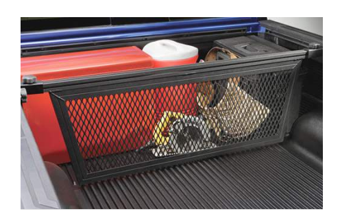
Bed Divider $379.71

The Bed Divider allows you to create a separated partition in your Tundra's bed space, to help keep items from sliding around. The Bed Divider is engineered to work with Tundra's Bed Rails (standard or add-on accessory) and is rated for a 400-lb load capacity. Please note, the Bed Divider accessory cannot be installed in conjunction with the Hard Tri-Fold Tonneau Cover accessory.