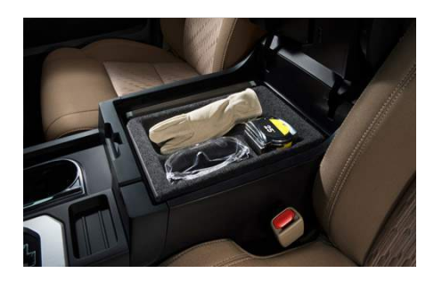
Centre Console Tray $156.77

Manufactured from forged, highly polished billet aluminum, the TRD Oil Cap features a red on black TRD logo to customize the engine compartment with a high-tech, race-inspired appearance. It's finished with a high-luster coating to maintain its appearance for years to come.