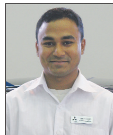
Mohammad (Imran) Khan