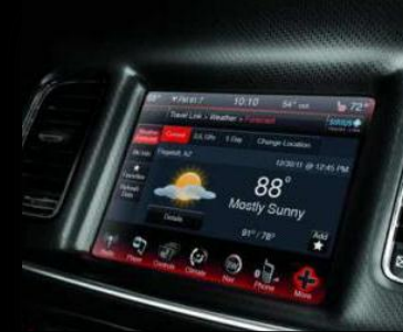
The segment's largest touch screen – 8.4" on SXT and above!

Edmunds.com issues the award each year to a vehicle that sets the standard for intuitive, practical and affordable automotive technology that enhances safety and convenience for drivers and passengers.