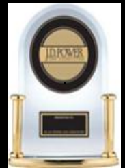
JD Power APEAL Award