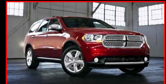
2012 Dodge Durango

“Recommended Picks” feature vehicles that, though not ranked at the very top of their category, are still worth strong consideration by consumers for their unique combination of attributes and value .