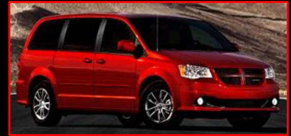
2012 Dodge Grand Caravan