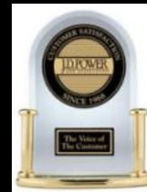
2011 J.D. Power APEAL