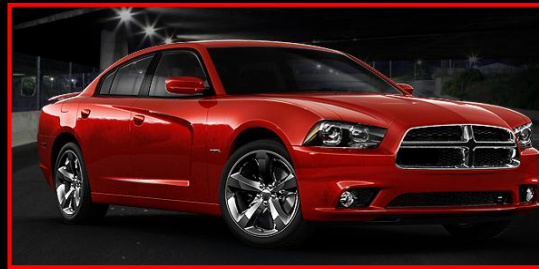
2012 Dodge Charger