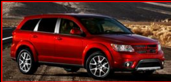
2012 Dodge Journey

A “Best Buy” rating signifies that a vehicle is ranked at the top of its class and is strongly approved by the editors. “Best Buy” vehicles represent the finest balance of attributes and price within their classes and they are the best choice for most consumers.