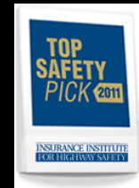
IIHS Top Safety Pick