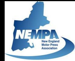
2011 NEMPA Winter Car Award