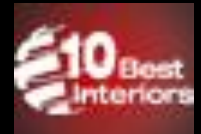
Ward’s 10 Best Interiors