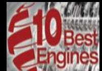
Ward’s 10 Best Engines 3.6L V6 2011 & 2012