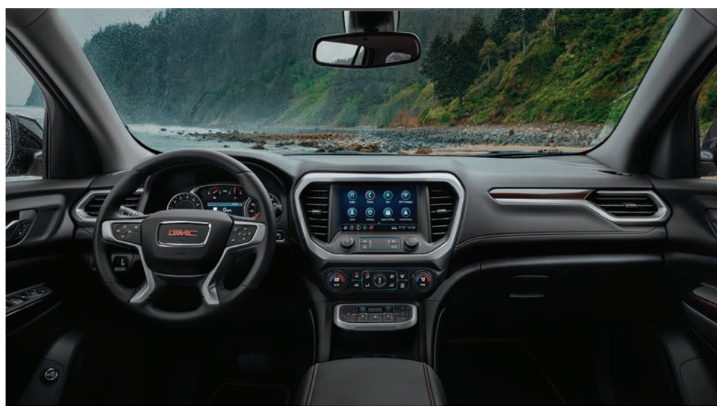
Spacious cabin features premium craftsmanship with versatile seating and storage options.

And Terrain's available easy to use technology keeps everyone entertained and informed, for example Apple CarPlay ^{\text{TM}} compatibility and an available 4G LTE Wi-Fi ^{\text{B}} Hotspot.