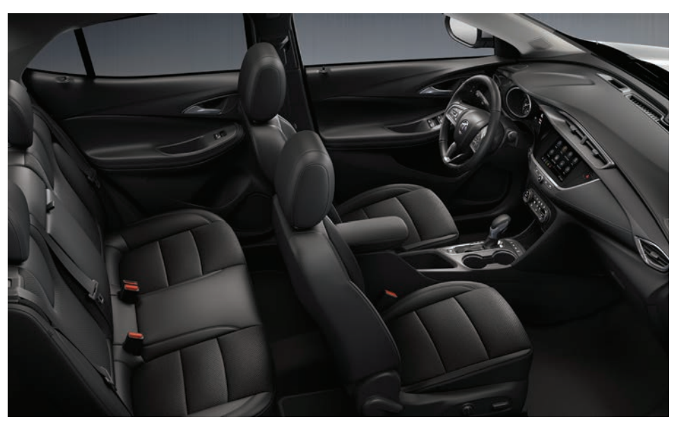
Encore GX offers premium seating for five with available refinements like leather-appointed seats, heated steering wheel, panoramic moonroof, and in-vehicle air ionizer.

Encore GX offers a personalized, powerful and connected driving experience with the Buick Infotainment System with Amazon Alexa™ integration. The full-color touch-screen display makes media accessible, informative and available in high resolution. With Apple CarPlay™ compat-