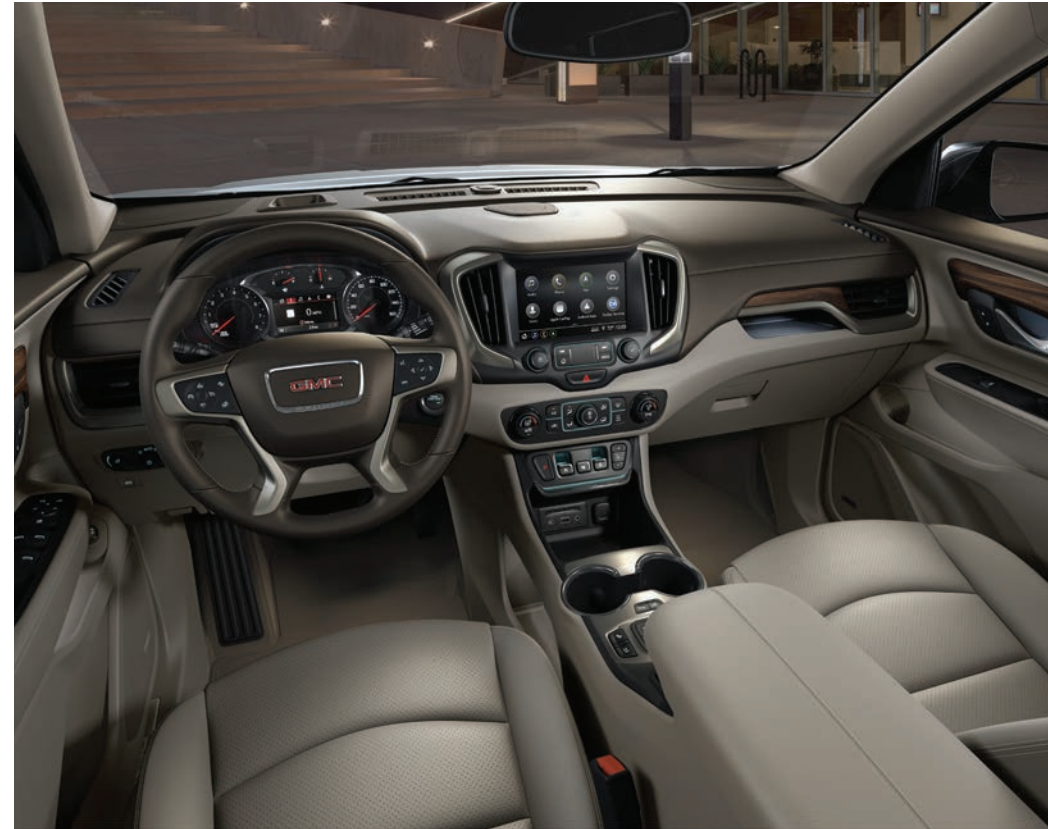
Terrain's interior blends contemporary styling, premium soft-touch materials and trim to make every trip feel like a first-class experience.

The popular Terrain SUV is compact, upscale with plenty of luxury features, and provides efficient versatile space. Featured highlights: turbocharged power, front-to-back flat load floor, and GMC Pro Safety – an array of camera-based safety technologies including cameras and ultrasonic sensors to help you feel safe and secure.