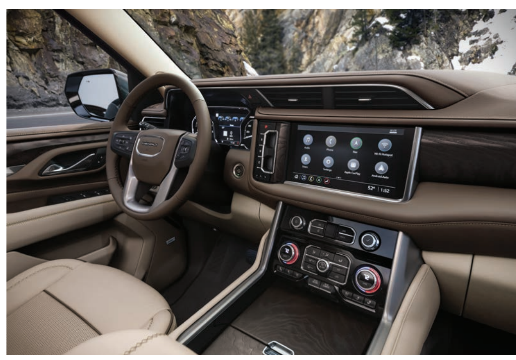
All-new Denali-exclusive interior design, and class-leading available 15" diagonal head-up display.

What makes these two centrallylocated and distinct automotive dealer-