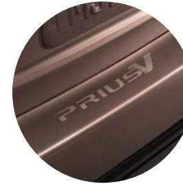
Rear bumper appliqué