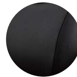
SofTex® shown in Black