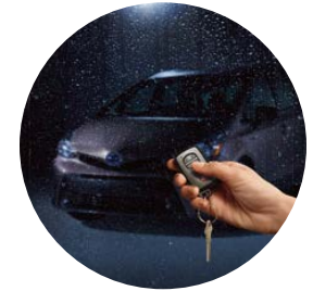
Remote Engine Starter