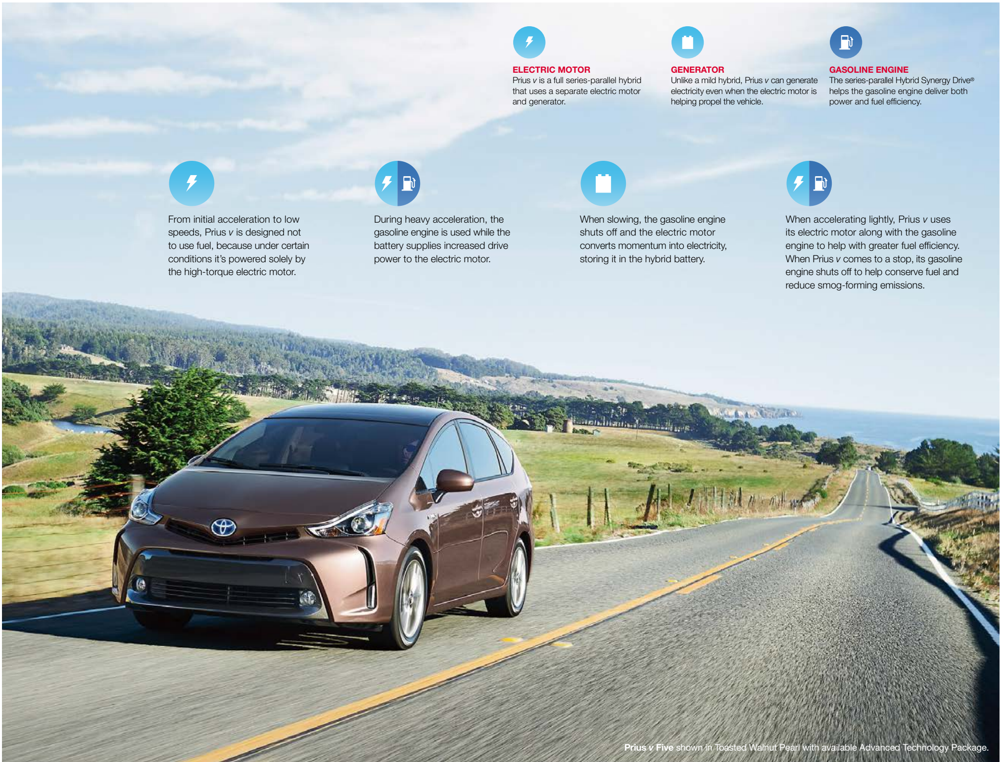
Prius v Five shown in Toasted Walnut Pearl with available Advanced Technology Package.

The series-parallel Hybrid Synergy Drive® helps the gasoline engine deliver both power and fuel efficiency.