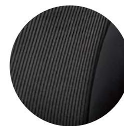
Fabric shown in Black