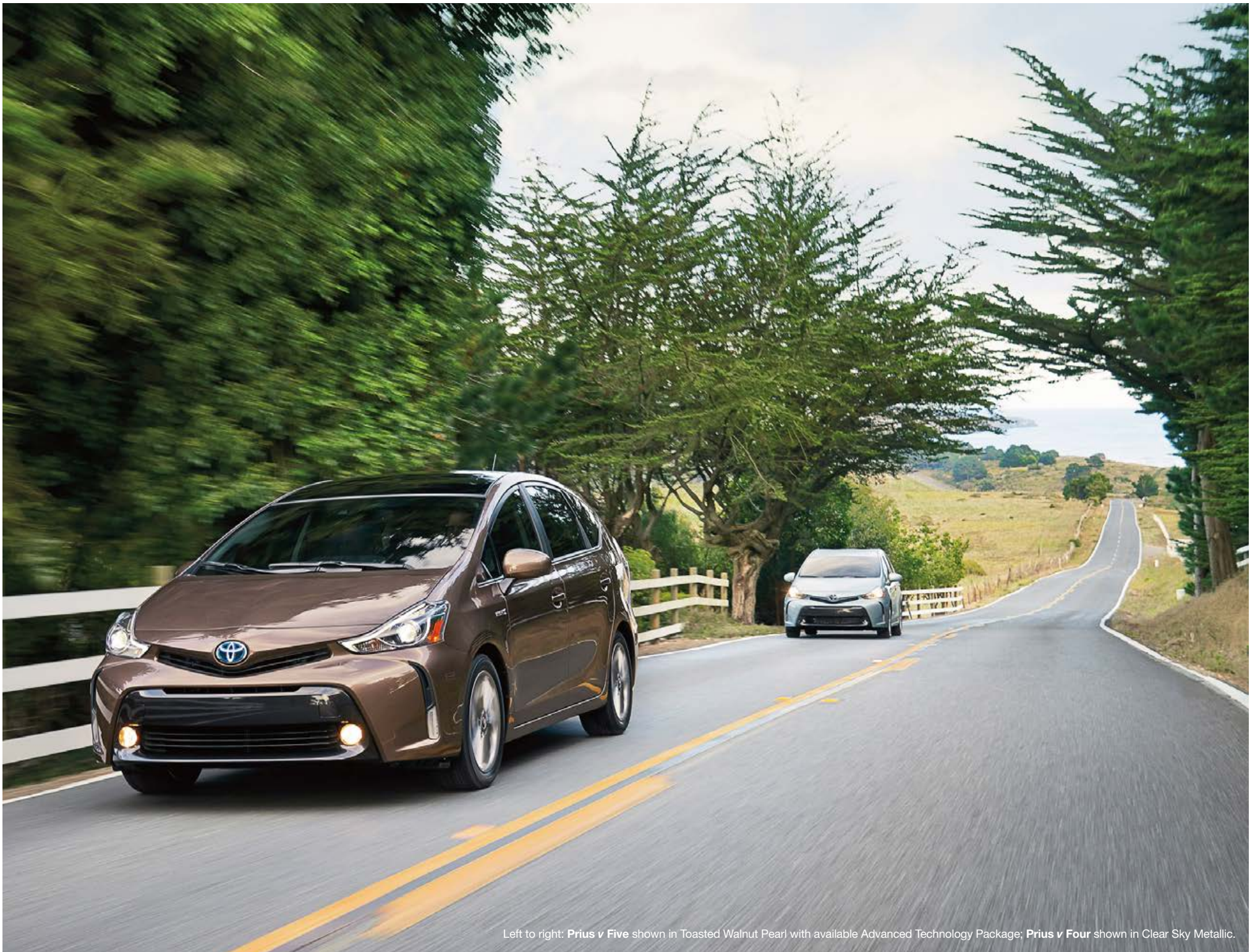
Left to right: Prius v Five shown in Toasted Walnut Pearl with available Advanced Technology Package; Prius v Four shown in Clear Sky Metallic.