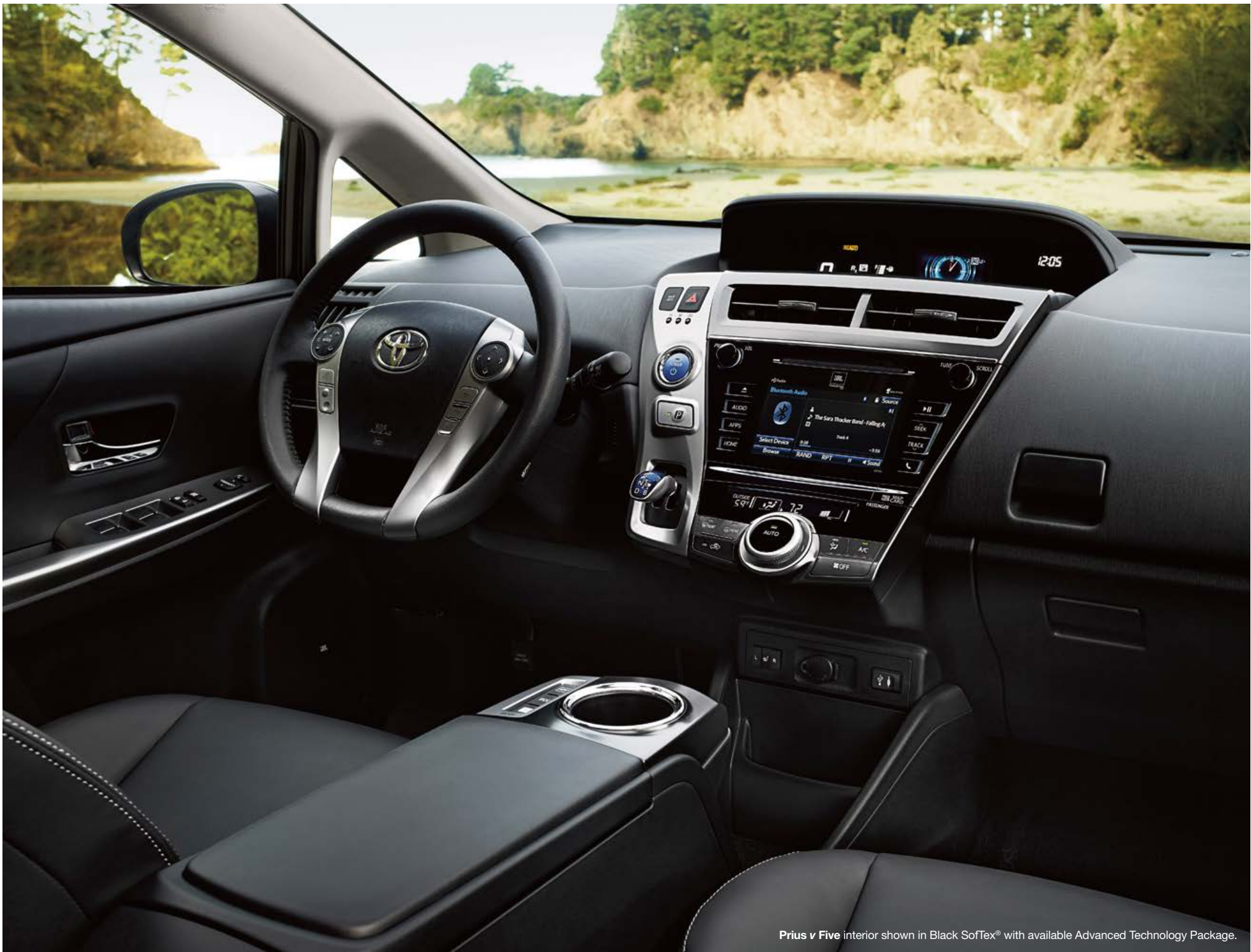
Prius v Five interior shown in Black SofTex® with available Advanced Technology Package.