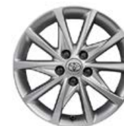
17-in. 10-spoke alloy wheels