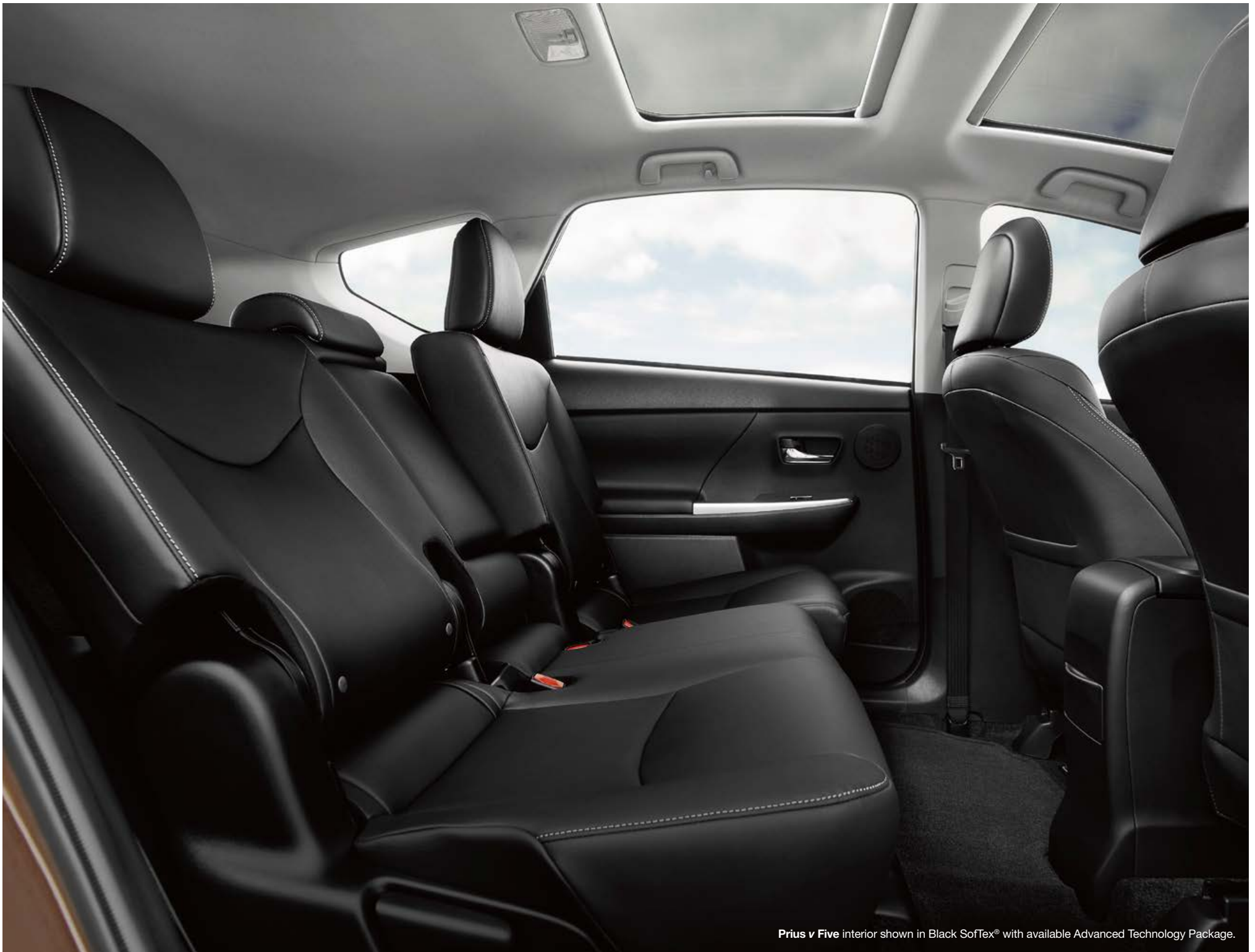
Prius v Five interior shown in Black SofTex® with available Advanced Technology Package.