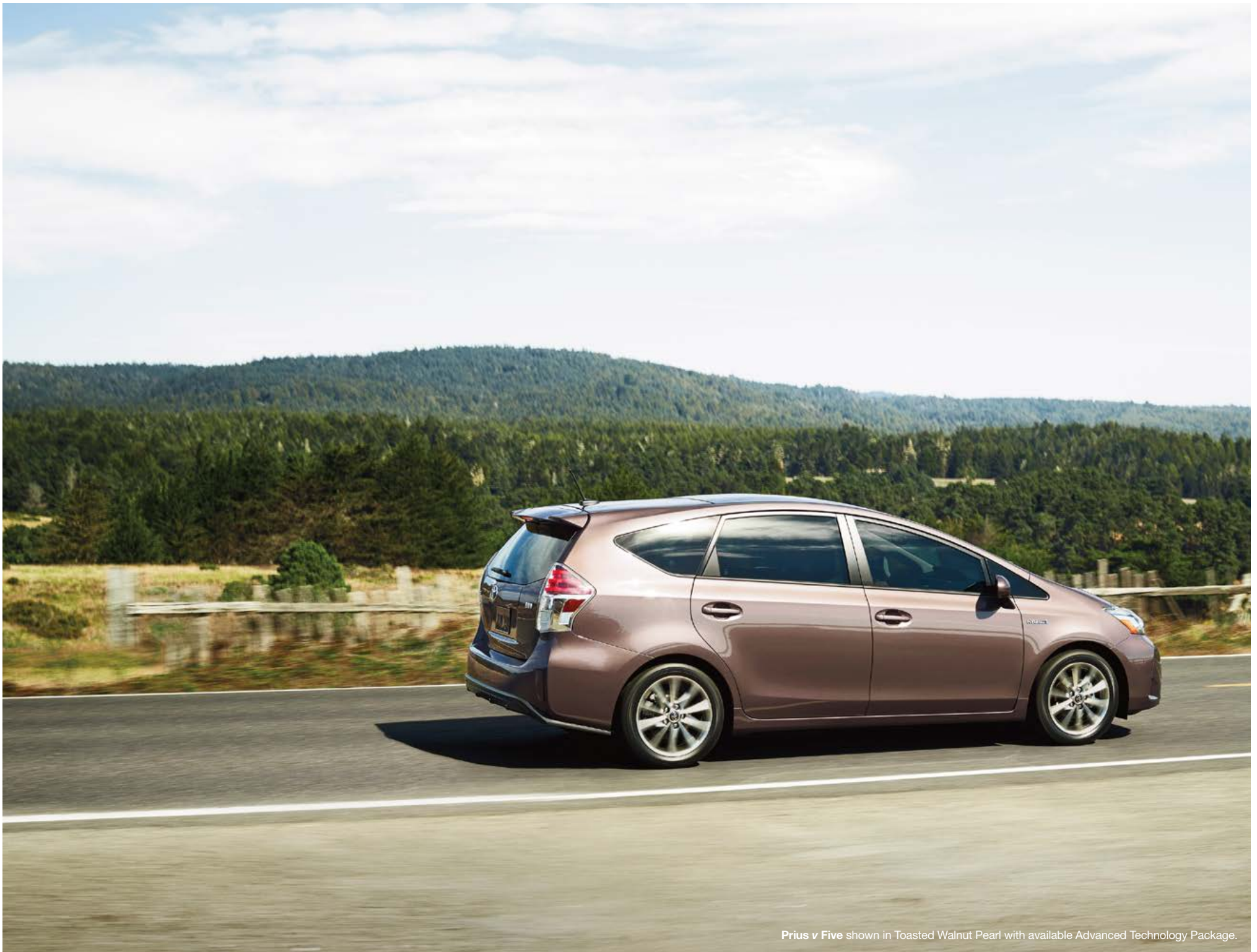
Prius v Five shown in Toasted Walnut Pearl with available Advanced Technology Package.