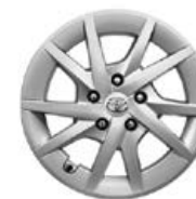
16-in. 10-spoke alloy wheels with full wheel covers