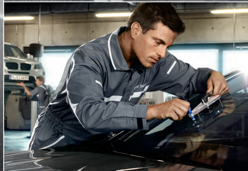
Tear along perforation.