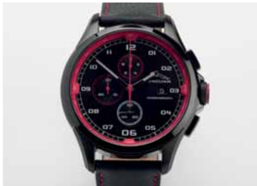
Jaguar Classic Chronograph Quartz Watch.

Silver-tone - 50JJCLLEAPKS Gunmetal - 50JJCLLEAPKGM Gold-plate - 50JJCLLEAPKG MSRP $29