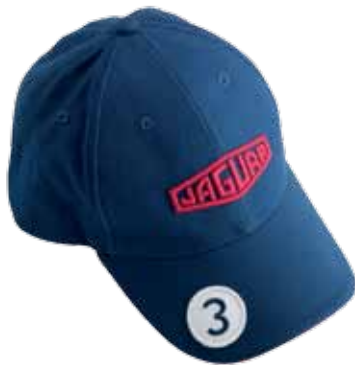
50JHERTRUCKCAP - Mesh Back