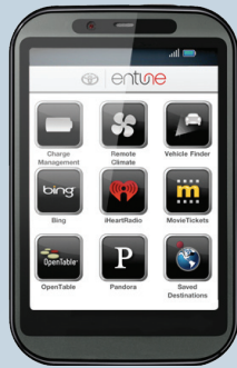
Phone not included

Most iPhone® [2] , Android™ [3] , and some BlackBerry® smartphones will work with Entune™. To verify compatibility, visit www.toyota.com/connect and provide your phone information.