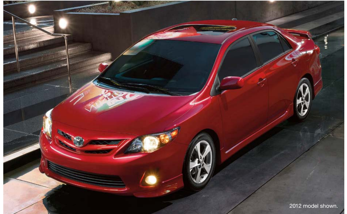
2012 model shown.

Corolla's impeccable road manners begin with its rigid chassis. Built to resist body flex, it provides a reliable platform so that the suspension can do its job. The front suspension, mounted to an additional sub-frame to reduce noise and vibration, is tuned for precision handling. In back, the rear suspension employs a torsion-type design that further smooths the ride quality.