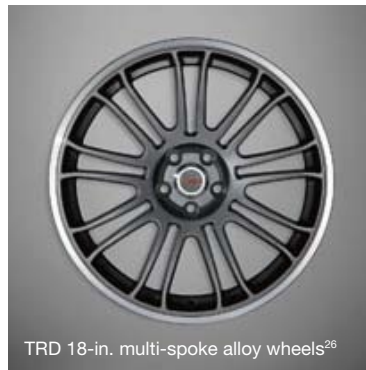
TRD 18-in. multi-spoke alloy wheels 26