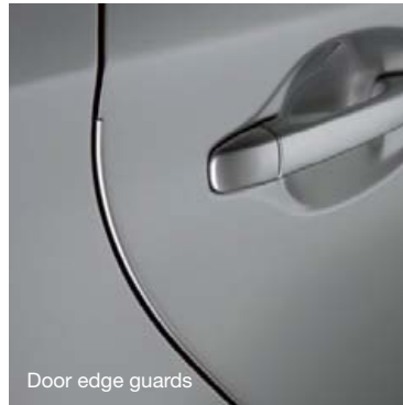
Door edge guards