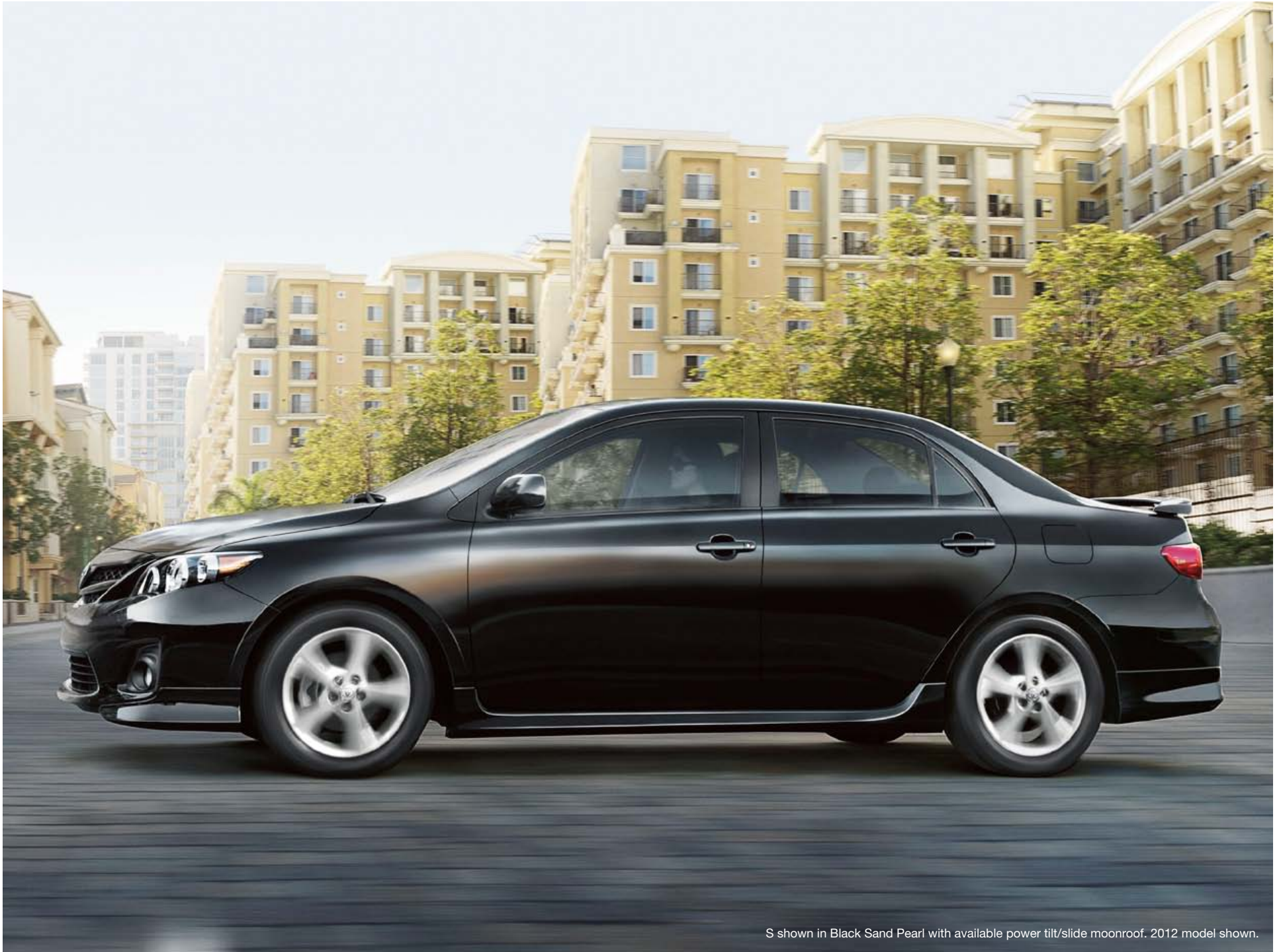
S shown in Black Sand Pearl with available power tilt/slide moonroof. 2012 model shown.