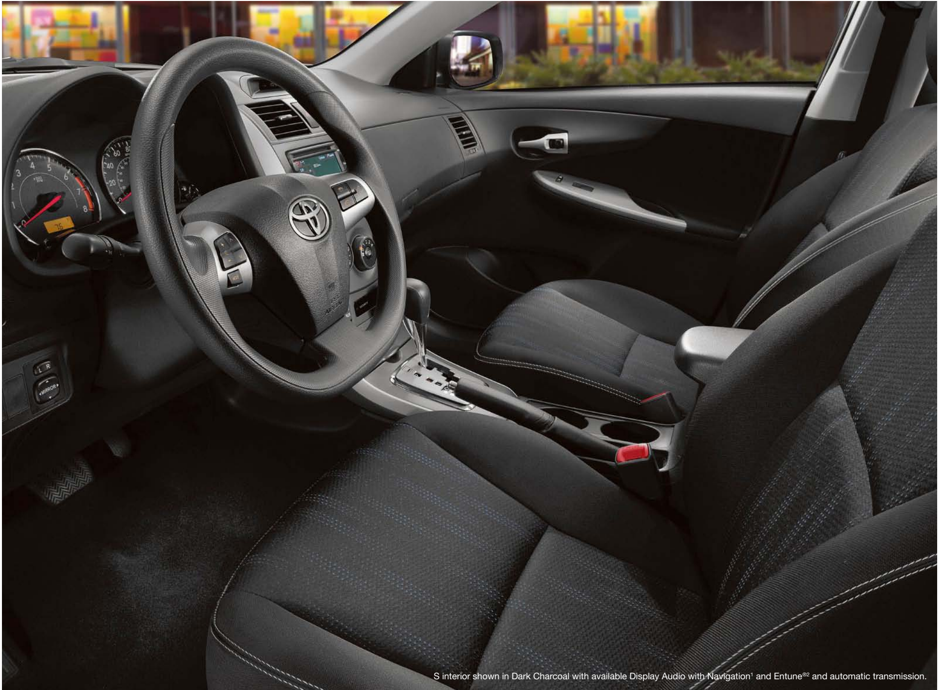
S interior shown in Dark Charcoal with available Display Audio with Navigation 1 and Entune ®2 and automatic transmission.