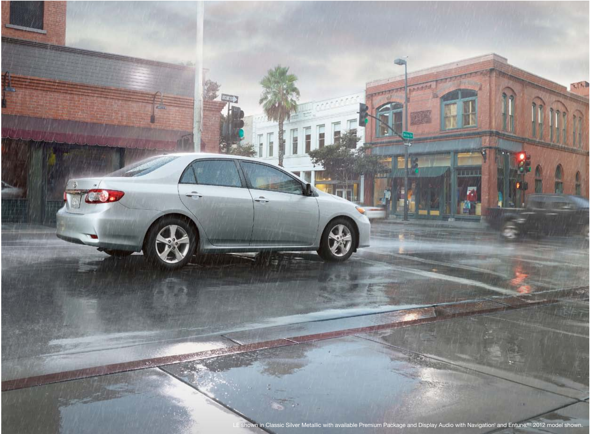
LE shown in Classic Silver Metallic with available Premium Package and Display Audio with Navigation 1 and Entune ®2 2012 model shown.