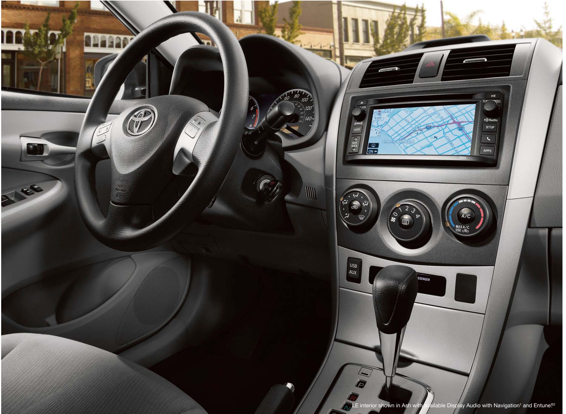
LE interior shown in Ash with available Display Audio with Navigation 1 and Entune ®2