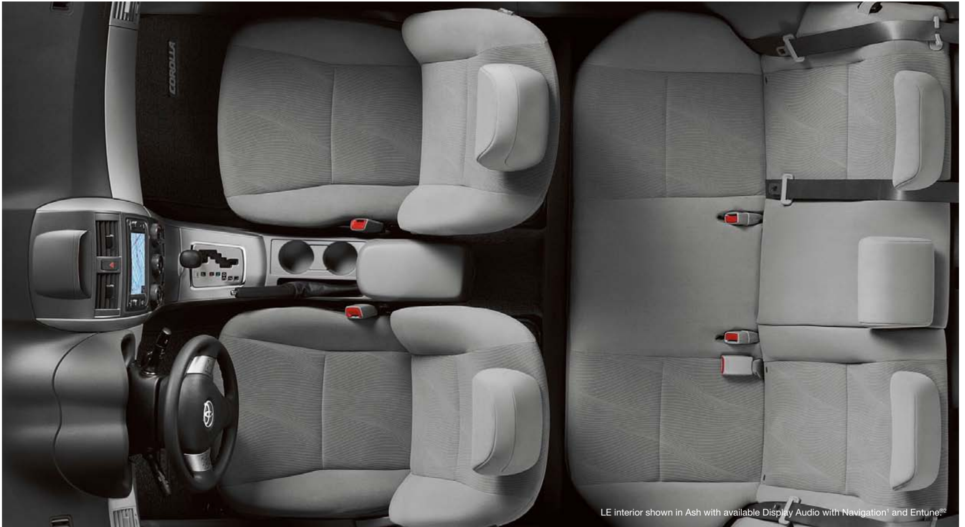
LE interior shown in Ash with available Display Audio with Navigation 1 and Entune. 2

1. See footnote 11 in Disclosures section. 2. See footnote 12 in Disclosures section.