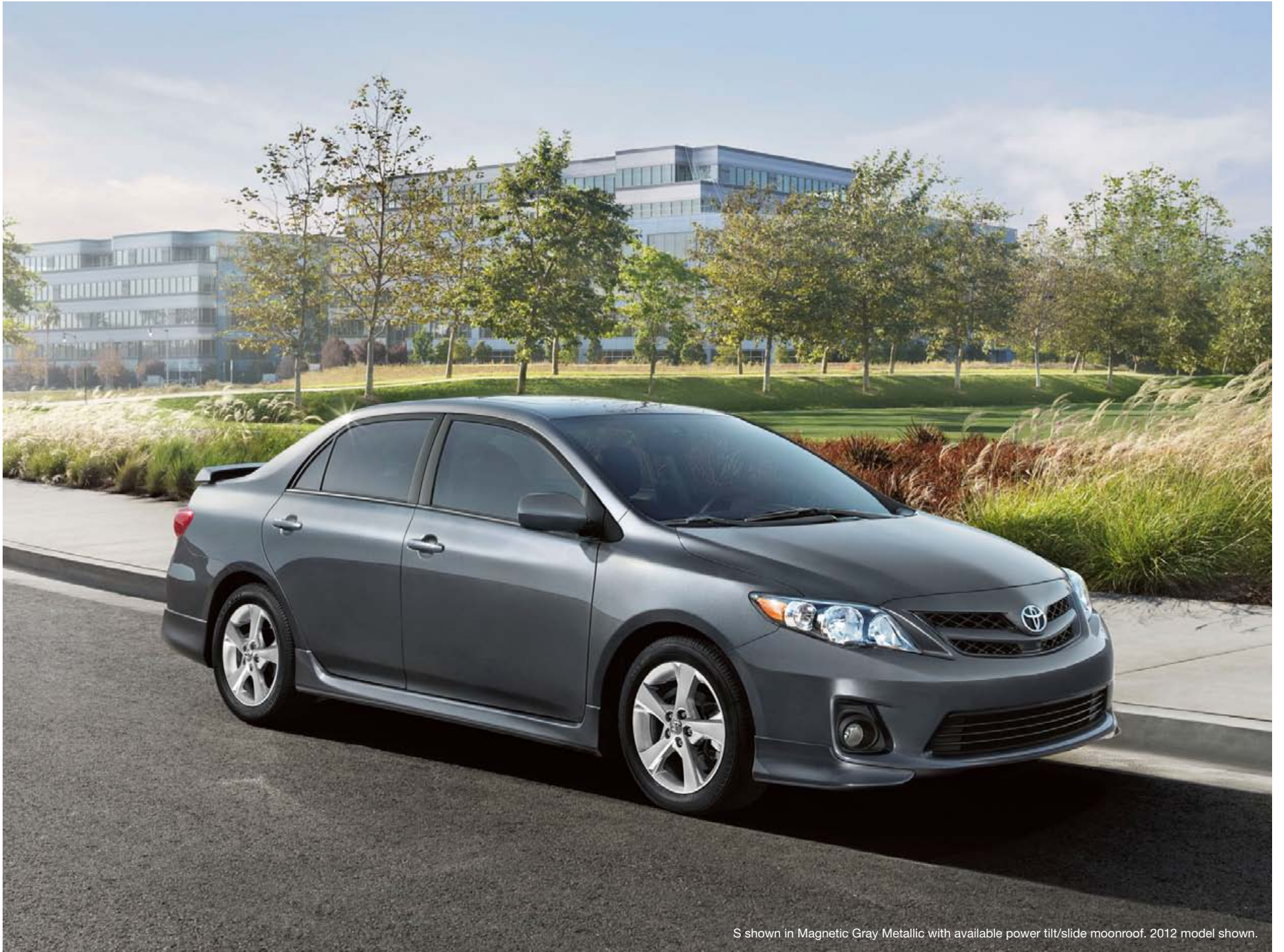
S shown in Magnetic Gray Metallic with available power tilt/slide moonroof. 2012 model shown.