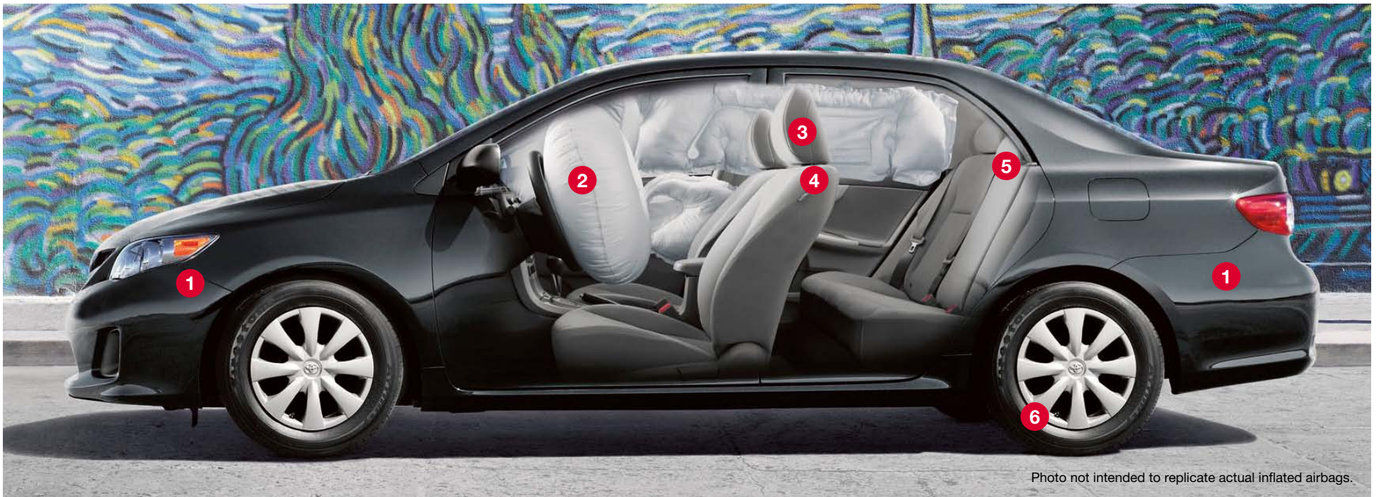
Photo not intended to replicate actual inflated airbags.

Corolla comes standard with active headrests in the front seats that adjust to better support the front occupants' heads in the event of certain lower-speed, rear-end collisions.