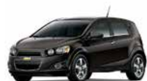
GVU - MOCHA BRONZE METALLIC 1

* Not available on RS. ** Available at extra cost. † Not available on LS and LT.