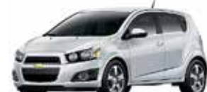
GAN - SILVER ICE METALLIC