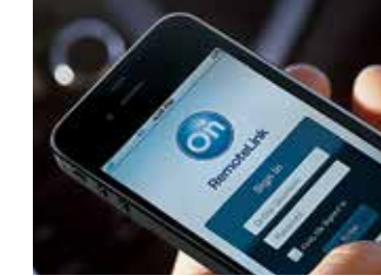
OnStar RemoteLink 7 mobile app.