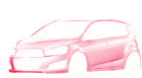
GBE - CRYSTAL RED TINTCOAT **