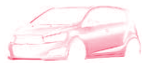
G7C - RED HOT