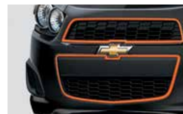
Z-Spec Orange-Flash Grille Surround (Also available in Black, Silver and White)