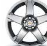
17" Painted Aluminum (Standard on LTZ; available on LT)