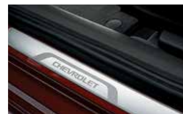
Door Sill Plate