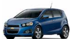
GTS - BLUE TOPAZ METALLIC