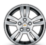
15" Painted Aluminum (Standard on LT Hatchback)