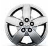
15" Steel with Bolt-On Wheel Cover (Standard on LS and LT Sedan)