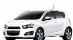
GAZ - SUMMIT WHITE