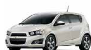
GBN - WHITE DIAMOND TRICOAT **†