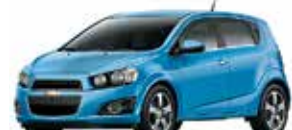
G7X - COOL BLUE 1