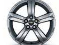
17" Midnight Silver-Painted Aluminum (Standard on RS)