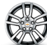
16" Painted Aluminum (Available on LT)