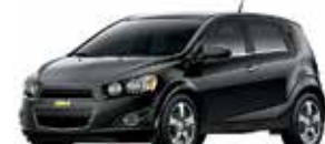
GAR - BLACK GRANITE METALLIC **