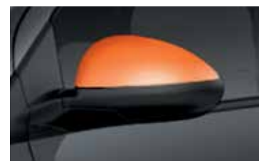
Z-Spec Orange-Flash Mirror Cap (Also available in Black, Silver and White)