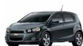
GLJ - ASHEN GREY METALLIC