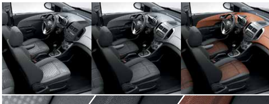
Jet Black/Dark Titanium-Colour Cloth 1