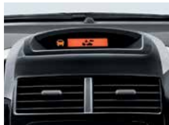
Available Forward Collision Alert.