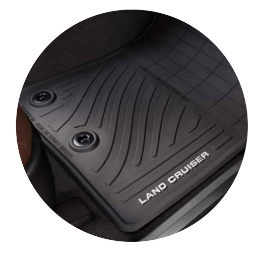
INTERIOR Explore new worlds of comfort, convenience and capability.