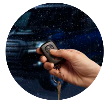
ELECTRONICS Greater security and convenience through technology.