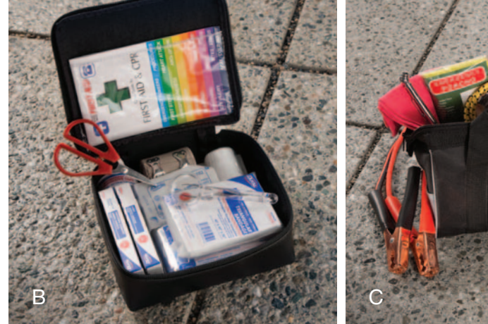
See footnote 4 in disclosure section on back cover.