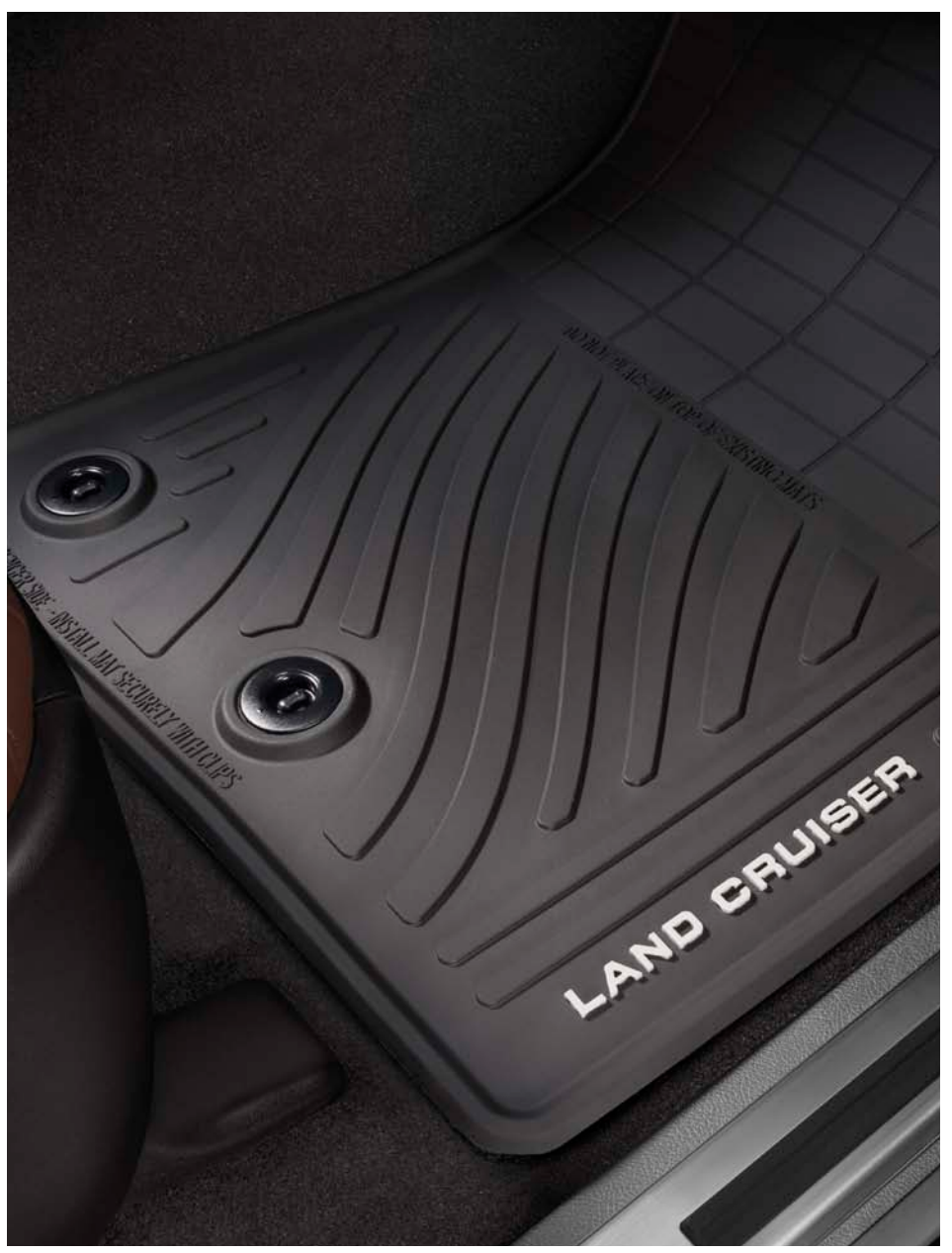
See footnote 4 in disclosure section on back cover.