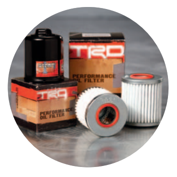
TRD Discover new adventures in performance with TRD accessories.