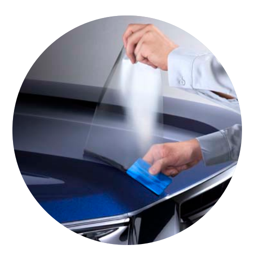
EXTERIOR Enhance your Land Cruiser's rugged good looks and unmatched versatility.

Genuine Toyota Accessories can open possibilities as big as the open road. Engineered with your new Land Cruiser in mind, they're the only accessories built and tested to meet Toyota standards for quality, fit and finish.