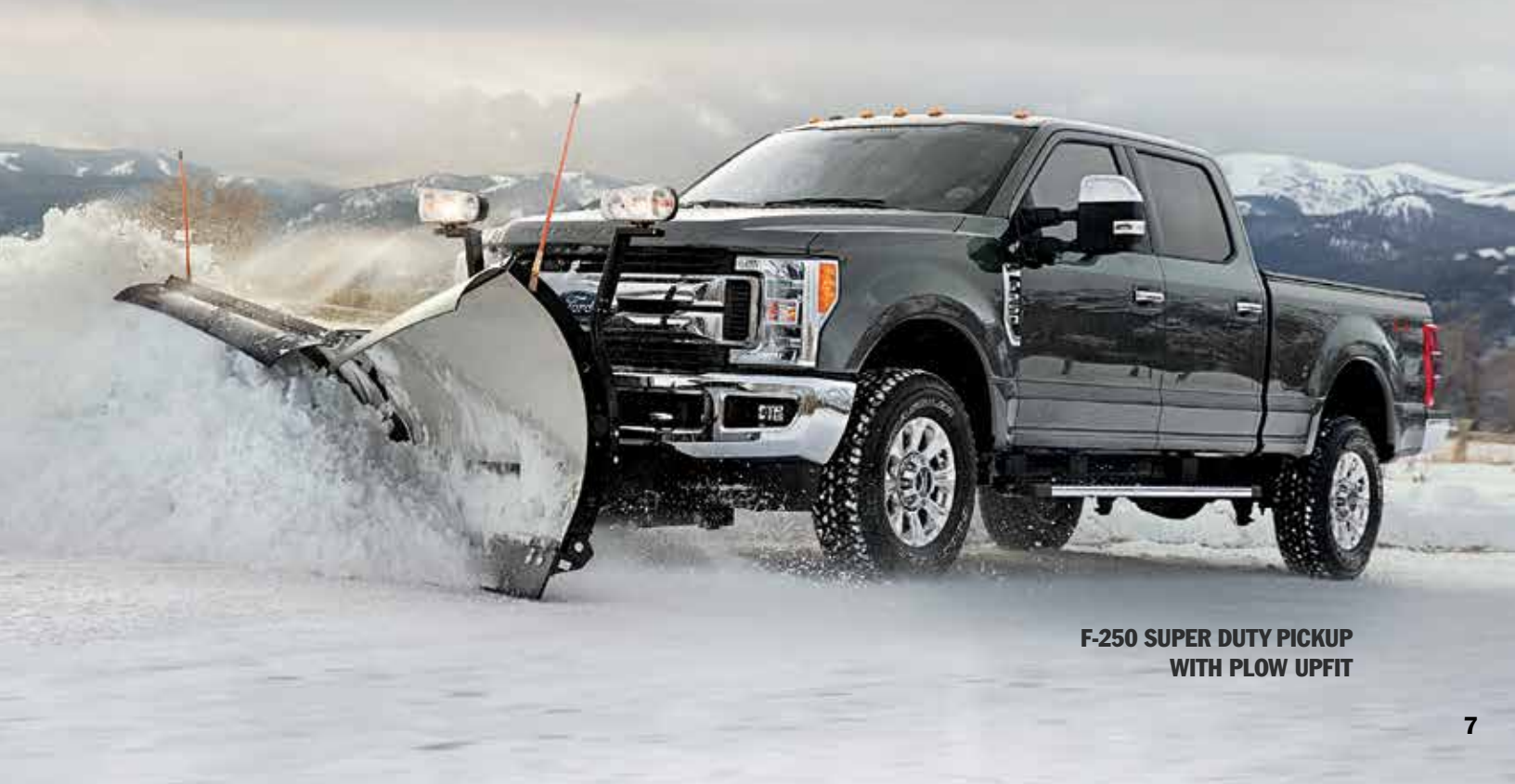
F-250 SUPER DUTY PICKUP WITH PLOW UPFIT

2 Gooseneck tow rating shown. 5th-Wheel towing rating limited to 5th-Wheel hitch rating of 27,500 lbs.