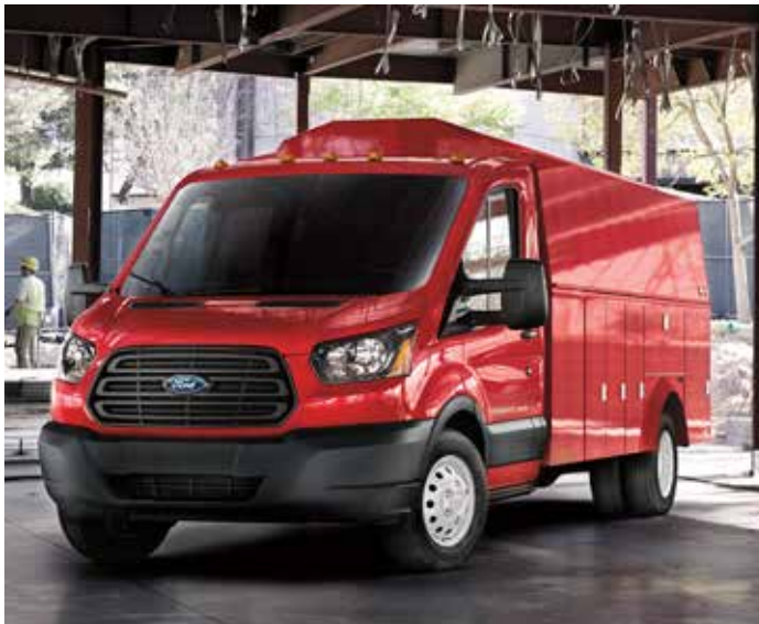
TRANSIT CHASSIS CAB WITH BOX BODY UPFIT