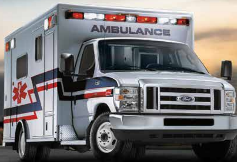
E-SERIES CUTAWAY UPFITTED WITH AMBULANCE BODY

/// POWER AND VERSATILITY THAT WORKS FOR YOUR BUSINESS