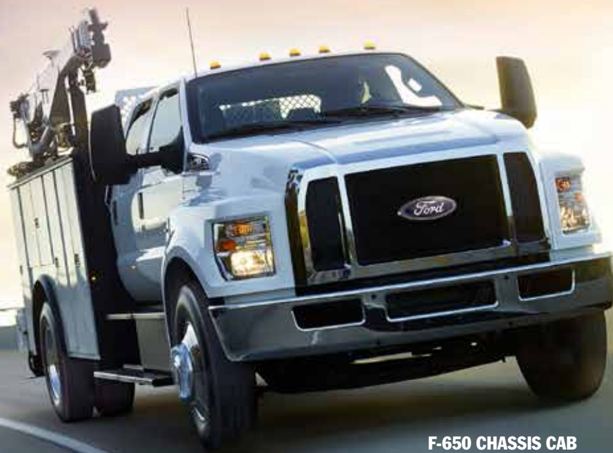
F-650 CHASSIS CAB WITH WORK BODY UPFIT

THE 2019 GENERATION OF F-650/F-750 IS DESIGNED FOR IMPROVED COMFORT AND HANDLING