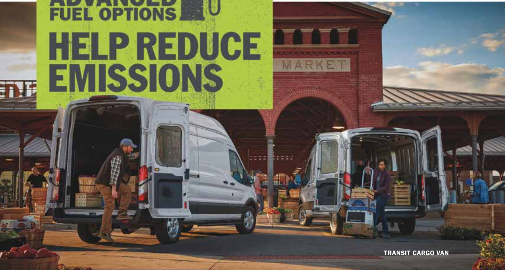
TRANSIT CARGO VAN