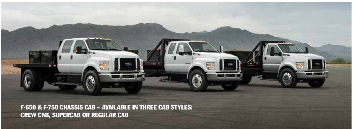
F-650 & F-750 CHASSIS CAB – AVAILABLE IN THREE CAB STYLES: CREW CAB, SUPERCAB OR REGULAR CAB