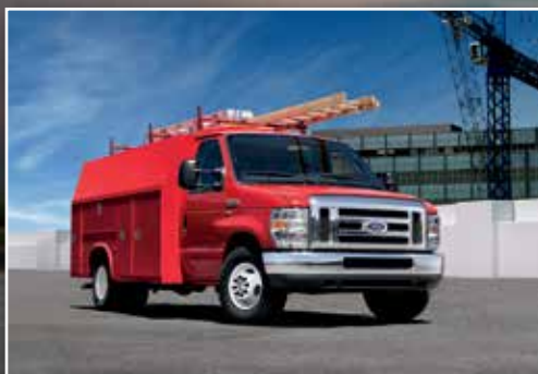
E-450 CUTAWAY UPFITTED WITH UTILITY BODY