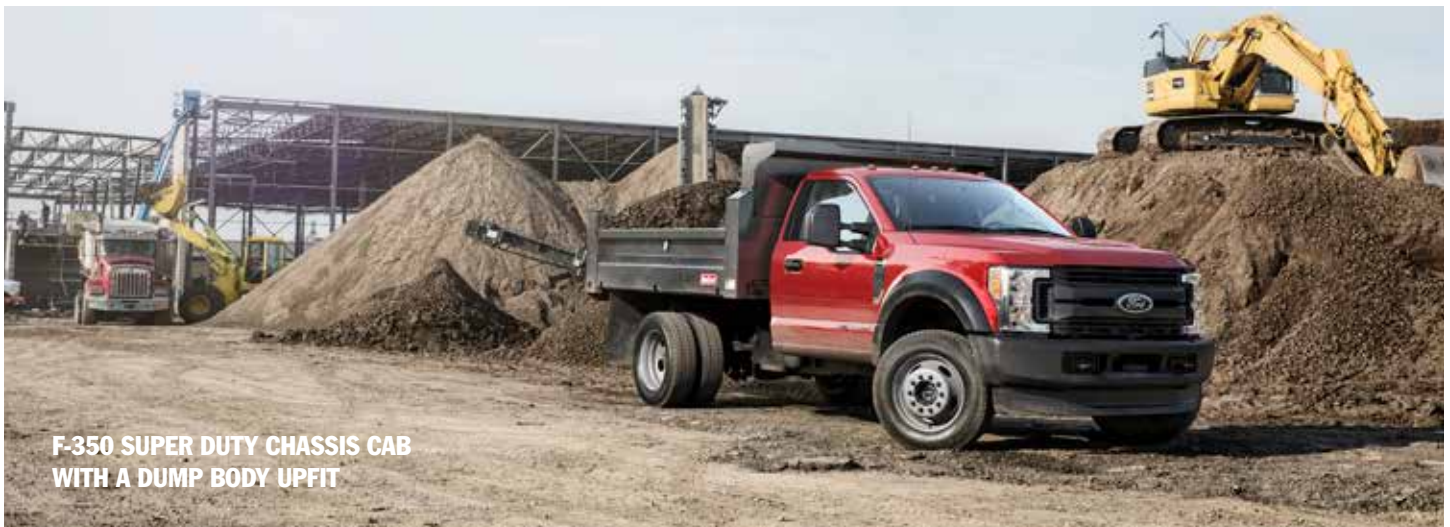
F-350 SUPER DUTY CHASSIS CAB WITH A DUMP BODY UPFIT