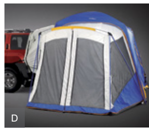
See your Nissan dealer for details, or go to accessories.nissan.ca