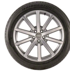
Q5 20" Summer Wheel and Tire Pkg: 10 Spoke