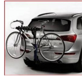
Hitch Mounted Bike Carrier