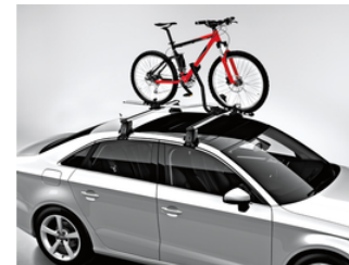
Aluminum Bike Rack