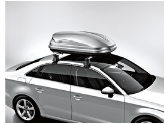
Small cargo carrier