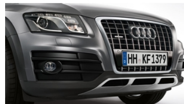
Front Spoiler - Offroad Package