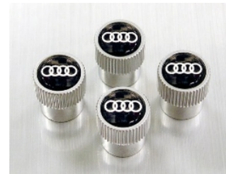
Carbon fiber valve stem caps with Audi rings logo