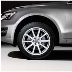
20" 10-Spoke Alloy Wheel