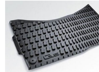
All-Weather Floor Mats (Rear)