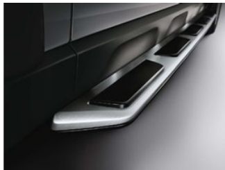
Q5 running boards (right side)