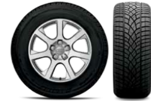
Winter Wheel and Tire - Q5