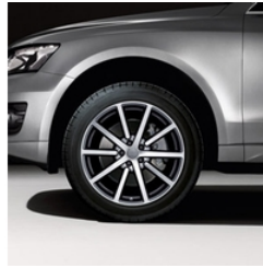
20" 10-Spoke Alloy Wheel