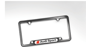
License plate frame with Audi sport logo - polished