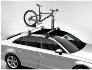
Fork Mount Bike Rack