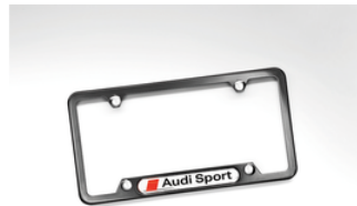
Audi sport license plate frame (black powdercoat)