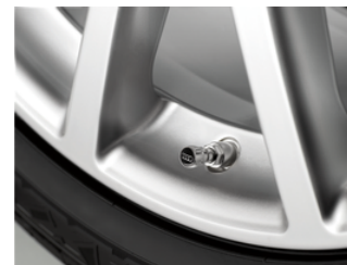
Valve stem caps