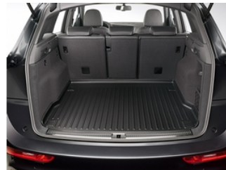
All-Weather Cargo Mat