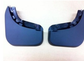
Splash Guards (Rear)