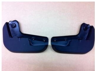
Splash Guards (Front)