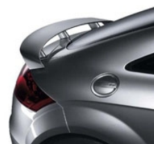
Rear wing spoiler