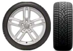
Winter Wheel and Tire - TTRS