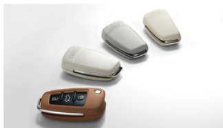
Leather key cover