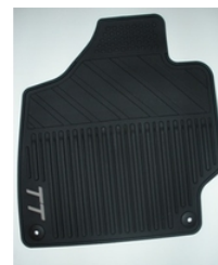
All-Weather Floor Mats (Front)