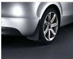
Splash Guards (Rear)