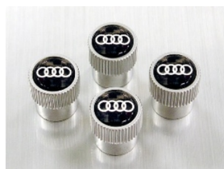
Carbon fiber valve stem caps with Audi rings logo