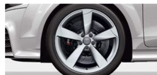
19" 5-Spoke Alloy Wheel