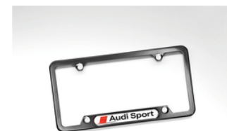
License plate frame with Audi sport logo - polished