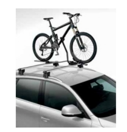
Base Carrier Bars Our Price: $488.00