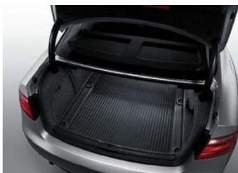
All-Weather Cargo Mat