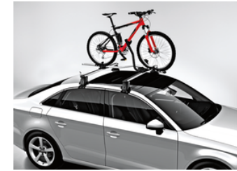
Aluminum Bike Rack