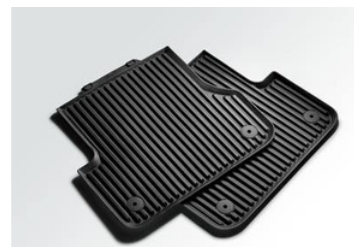
All Weather Floor Mats (Rear)