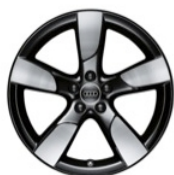
19" 5-Spoke Alloy Wheel