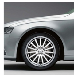
18" 15-Spoke Alloy Wheel