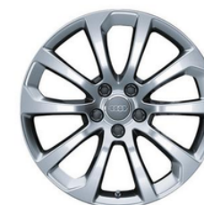
18" 10-Spoke Alloy Wheel