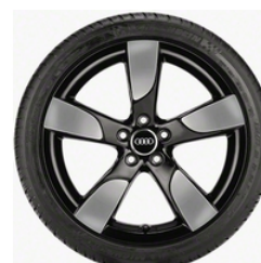
S4 Sedan 19" Summer Wheel and Tire Pkg: Hollow Spoke