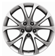
17" 5-V-Spoke Alloy Wheel