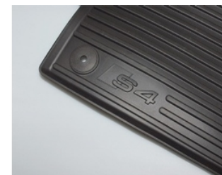
All-Weather Floor Mats (Front)