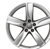
17" 5-Spoke Alloy Wheel (Winter)