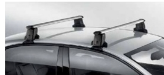
Base Carrier Bars