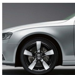
19" 5-Hollow-Spoke Alloy Wheel