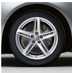
18" 5-Spoke "Rotor Design" Alloy Wheel