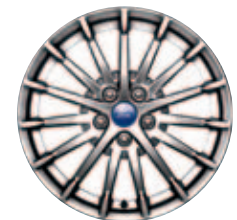
17" Machined Aluminum Standard