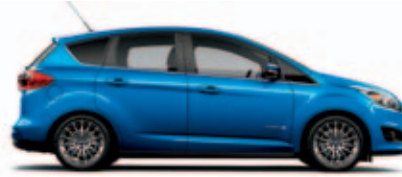
Blue Candy Metallic Tinted Clearcoat