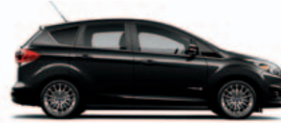
Tuxedo Black Metallic