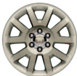
20" Premium Painted Aluminum with King Ranch Center Caps Optional