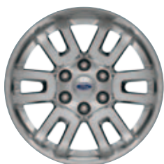
18" Machined Aluminum Standard

1st- and 2nd-row carpeted floor mats with embroidered King Ranch logo.