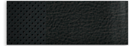
6 Charcoal Black Leather with Perforated Inserts