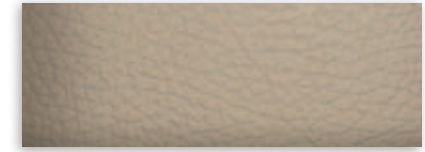
4 Camel Leather