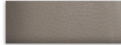
3 Stone Leather