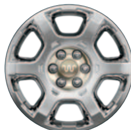
20" Chrome-Clad Aluminum with King Ranch Center Caps Optional