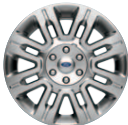
20" Polished Aluminum Optional