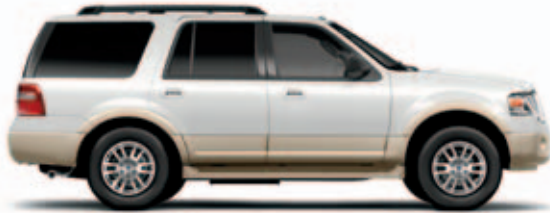
White Platinum Metallic Tri-coat