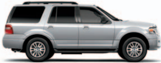
Ingot Silver Metallic