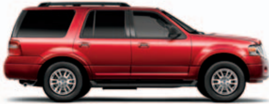
Ruby Red Metallic Tinted Clearcoat