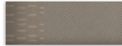
1 Stone Cloth