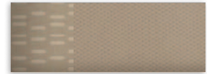
2 Camel Cloth