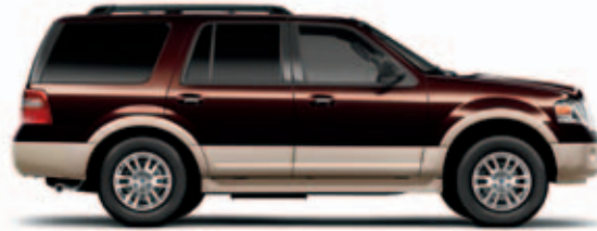
Kodiak Brown Metallic