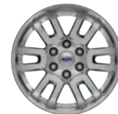
18" Machined Aluminum Standard

Voice-activated Navigation System with nearly 10-gigabyte hard drive, single-disc Premium Sound System, HD Radio ™ Technology, and SiriusXM Traffic and Travel Link with 6-month trial subscription (requires 202A)