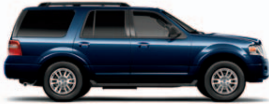
Blue Jeans Metallic