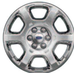
20" Chrome-Clad Aluminum Optional