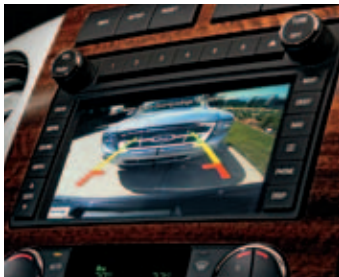
XLT. Stone leather trim. 1 Available equipment.