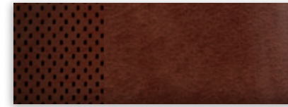
7 Chaparral Leather with Perforated Inserts