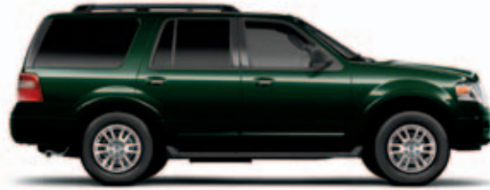
Green Gem Metallic