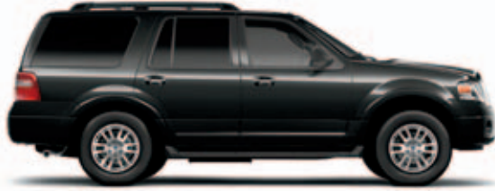
Tuxedo Black Metallic