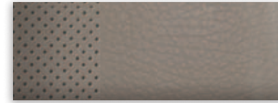
5 Stone Leather with Perforated Inserts