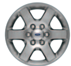
17" Aluminum Optional