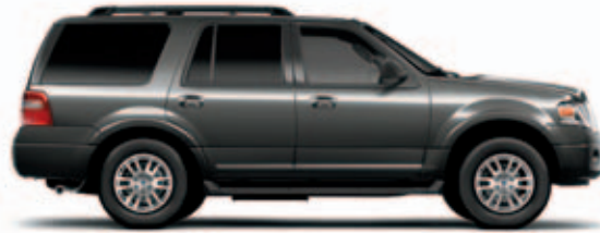
Sterling Gray Metallic