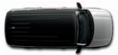
Tuxedo Black Metallic roof Ingot Silver Metallic lower