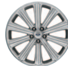
20" Polished Aluminum Optional: 300A, 301A Included: 302A, 303A