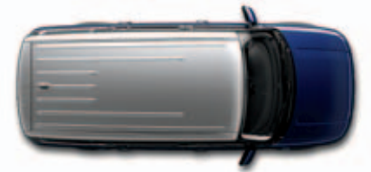
Ingot Silver Metallic roof Deep Impact Blue Metallic lower