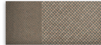
1 Dune Cloth