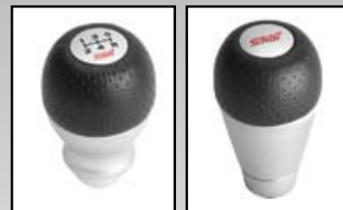
5 M/T A/T