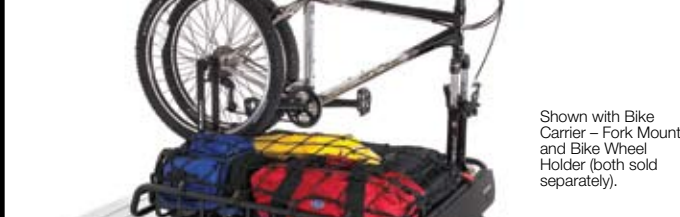
Shown with Bike Carrier - Fork Mount and Bike Wheel Holder (both sold separately).

Heavy-Duty Roof Cargo Basket Constructed of powder-coated steel. Includes mounting hardware, black stretch net with hooks and a custom fairing to help deflect wind and reduce noise. Measures 44" L x 39" W x 6.5" H.* E361SSA200 E361SSA100 (Bike Carrier - Fork Mount) E3610LS430 (Bike Wheel Holder)