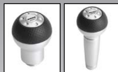
5 M/T A/T