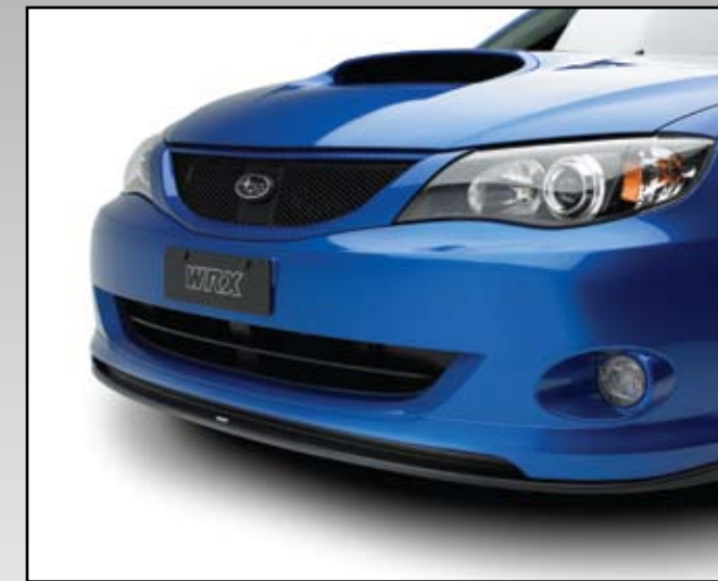
STI Front Lip Spoiler STI Front Lip Spoiler gives Impreza a mean, ground-hugging attitude. E2410FG100 Not compatible with Front Underspoiler

Front Underspoiler Enhance the good looks of your Impreza with a color-matched Front Underspoiler. Not compatible with Front Underguard or Front Lip Spoiler