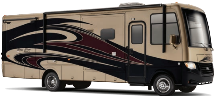
BAY STAR SPORT