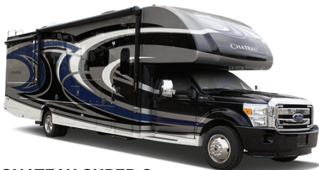
CHATEAU SUPER C