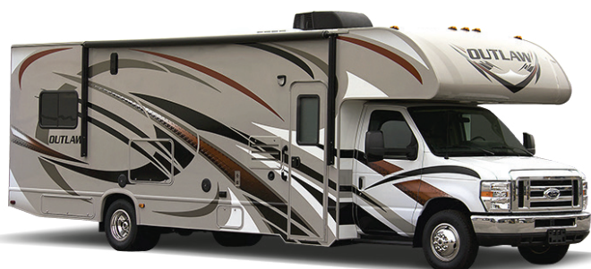
OUTLAW (TOY HAULER)