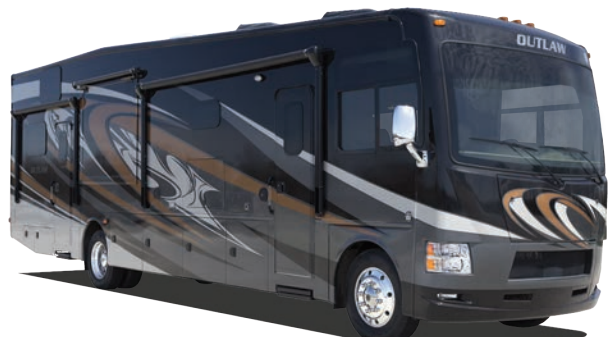
OUTLAW (TOY HAULER)