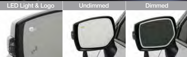
LED Light & Logo Undimmed Dimmed