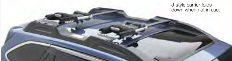
J-style carrier folds down when not in use.