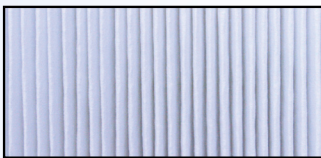
STANDARD Cabin Air Filter

The Standard Genuine Toyota Cabin Air Filter is made of high-quality non-woven fabric that is designed to remove major air pollutants including dust, pollen, soot, lead, sulfates and exhaust particles.